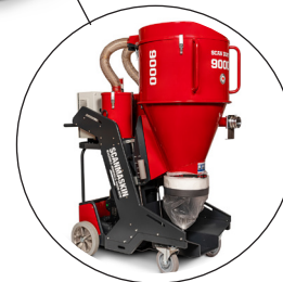
Recommended vacuum for SC650 propane Scan Dust 9000 Scan Dust 9000 propane