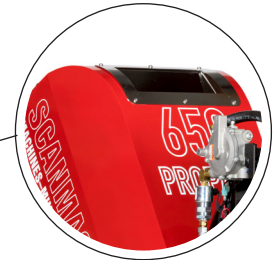
Equipped with a 22 liter water tank