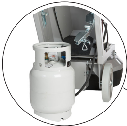
Operated 100% from propane