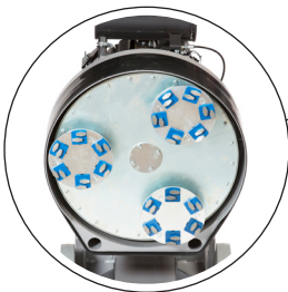
Equipped with patented planetary system to drive its three heads drum.