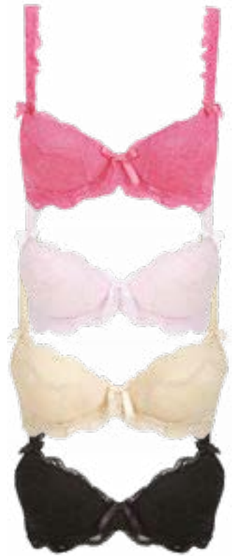
Black | Milk tea | Pale pink | Rose pink