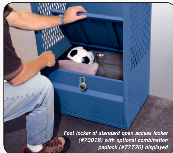
Foot locker of standard open access locker (#70018) with optional combination padlock (#77720) displayed

Note: Built-in locks are pre-installed on assembled lockers.