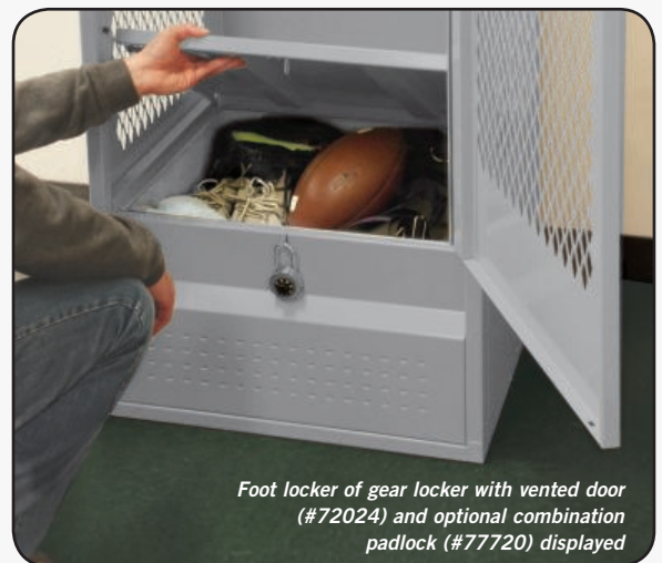
Foot locker of gear locker with vented door (#72024) and optional combination padlock (#77720) displayed

Note: Built-in locks are pre-installed on assembled lockers.