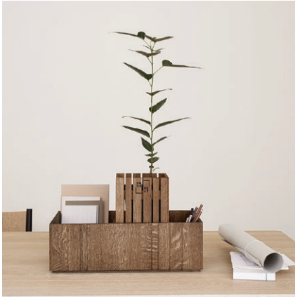
Ref. no.: 108-4A3