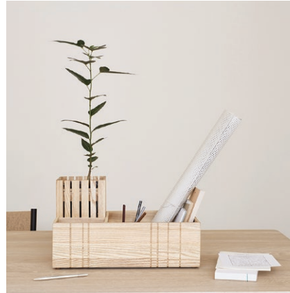
Ref. no.: 108-1A3