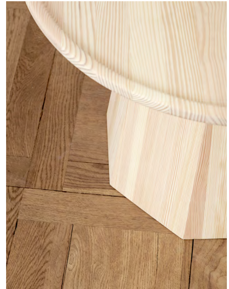
Pine Table Small in Pine