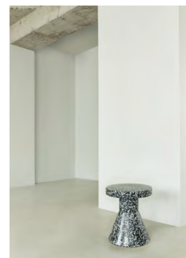
Bit Stool Cone in Black/White