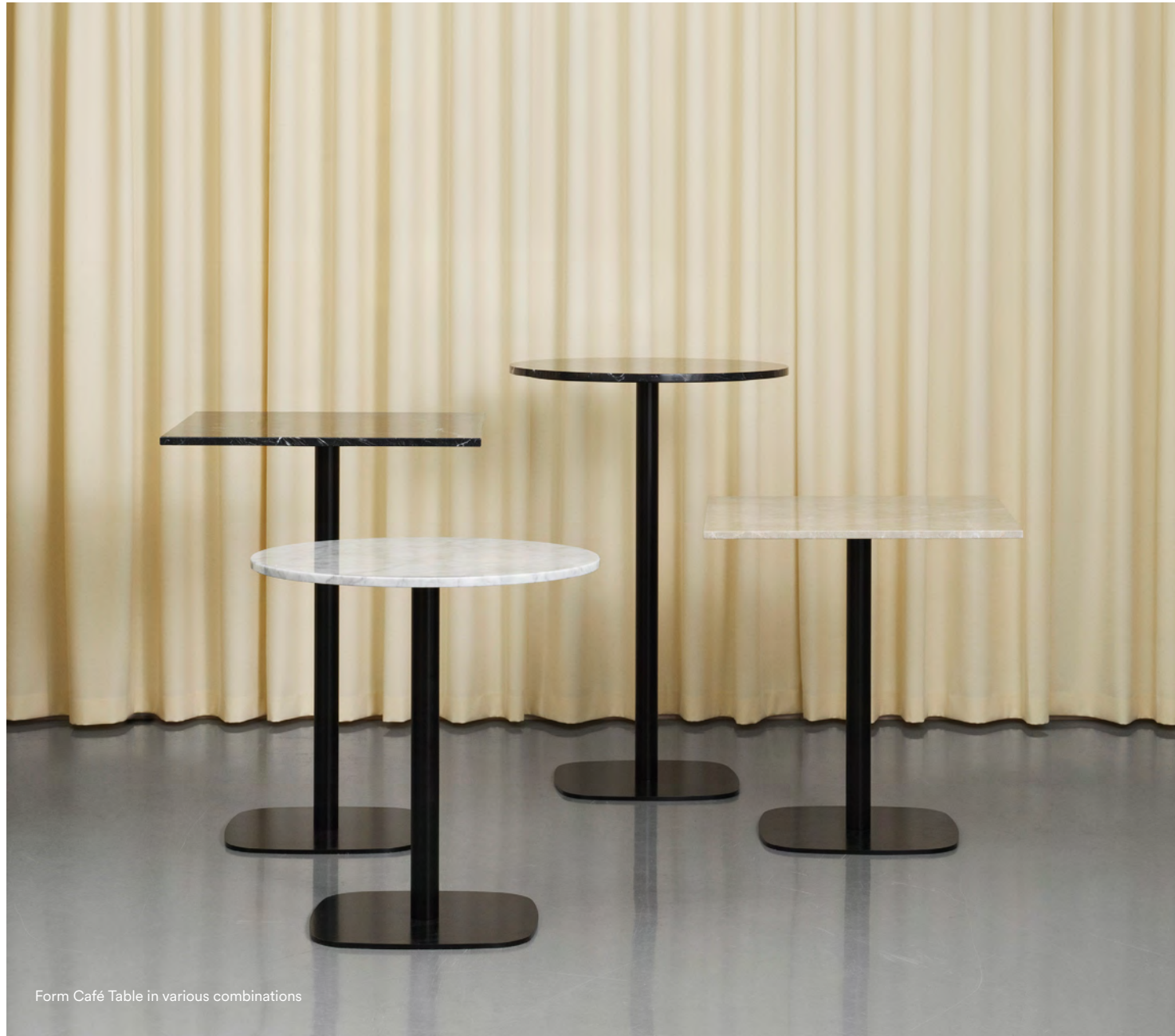
Form Café Table in various combinations