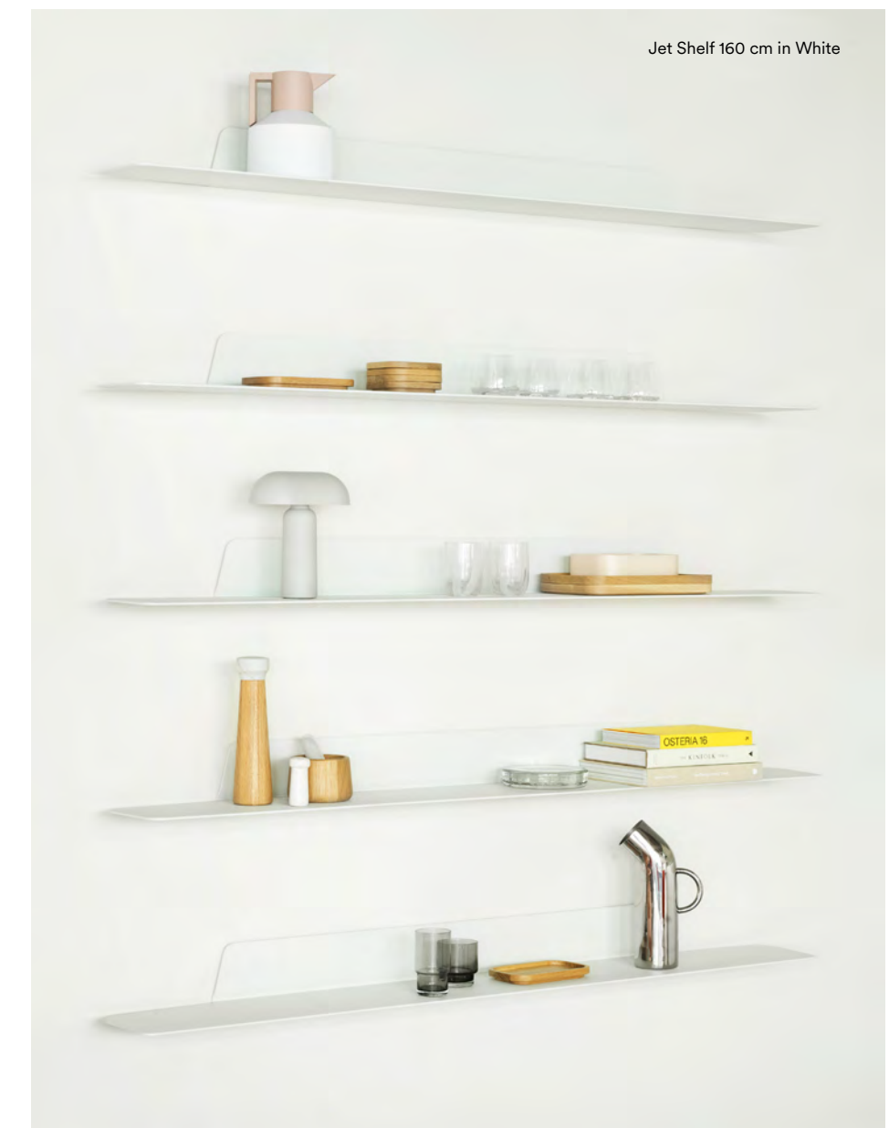
Jet Shelf 160 cm in White

An experiment with compositions of surfaces, spaciousness and texture has led to the design of Jet, a light aluminum shelf with a spacious design and a clear-cut industrial silhouette. An asymmetric relationship between a horizontal and vertical surface creates the Jet shelf's architectural design and comes together as an attractive platform for storage and display.