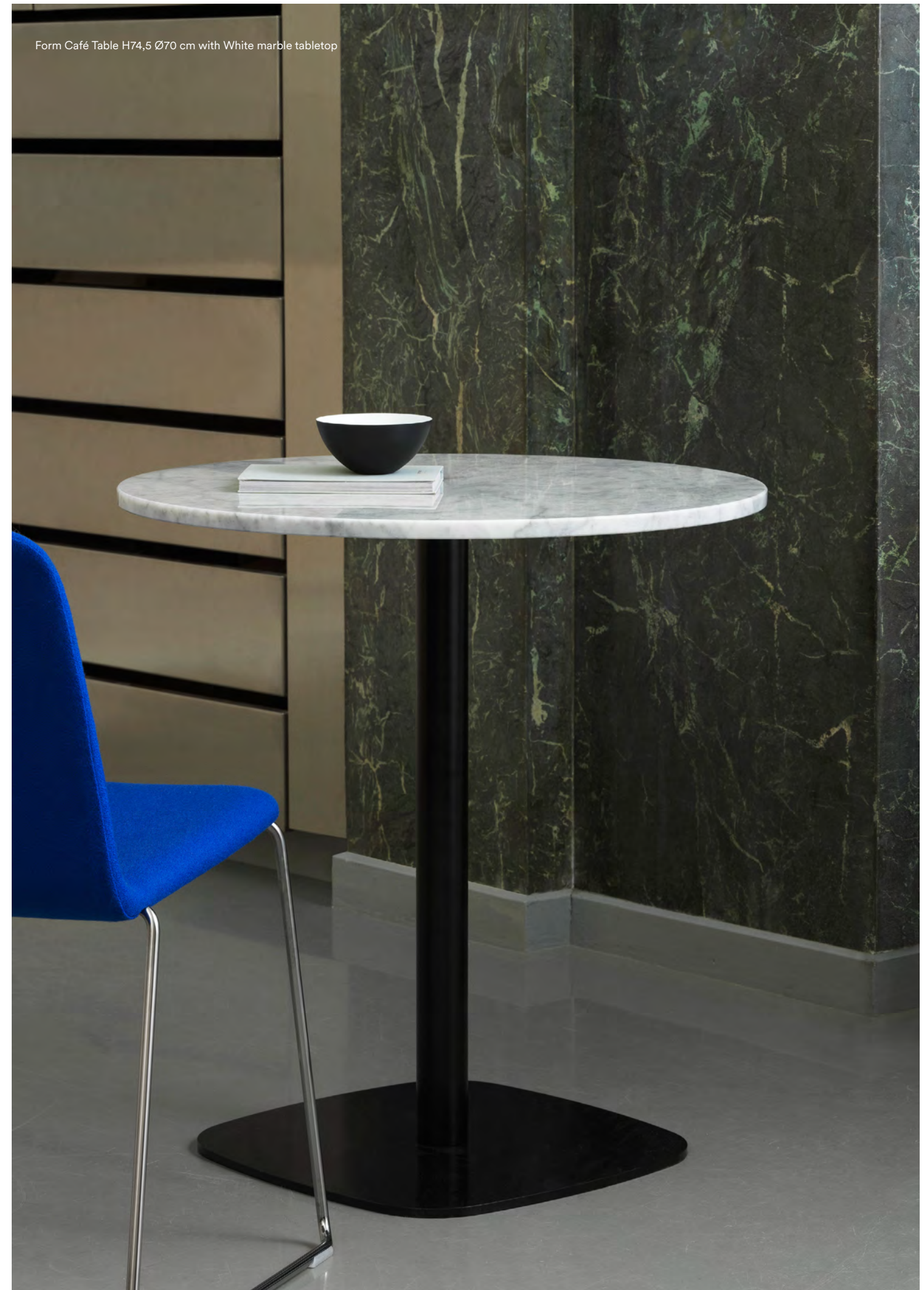
Form Café Table H74,5 Ø70 cm with White marble tabletop