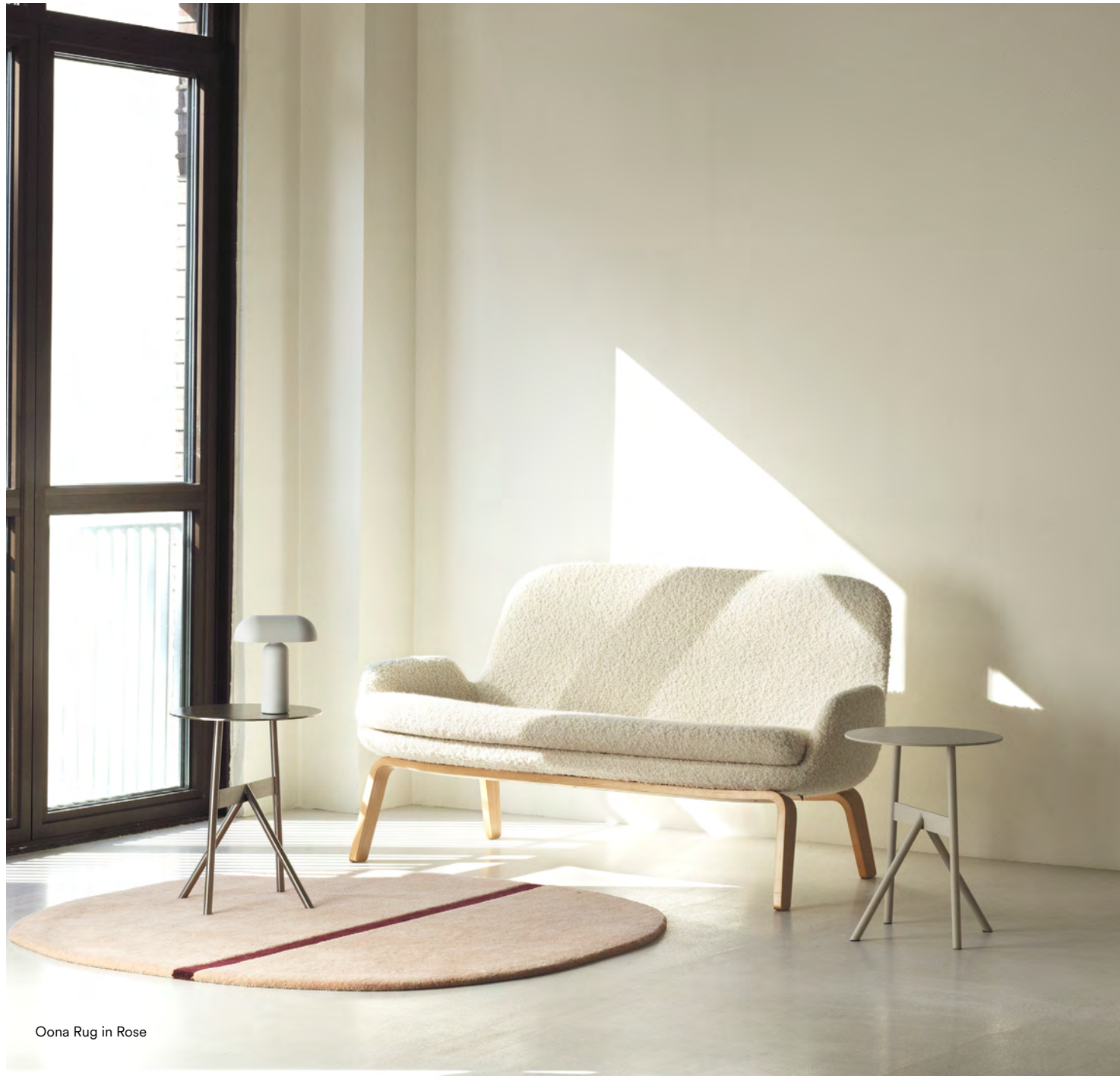
Oona Rug in Rose