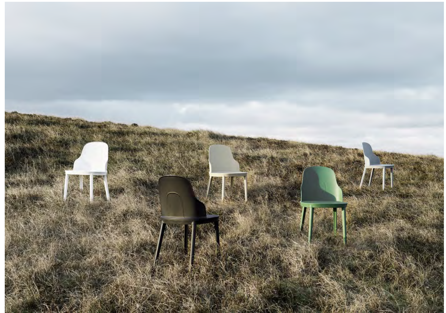
Allez Chair in various colors