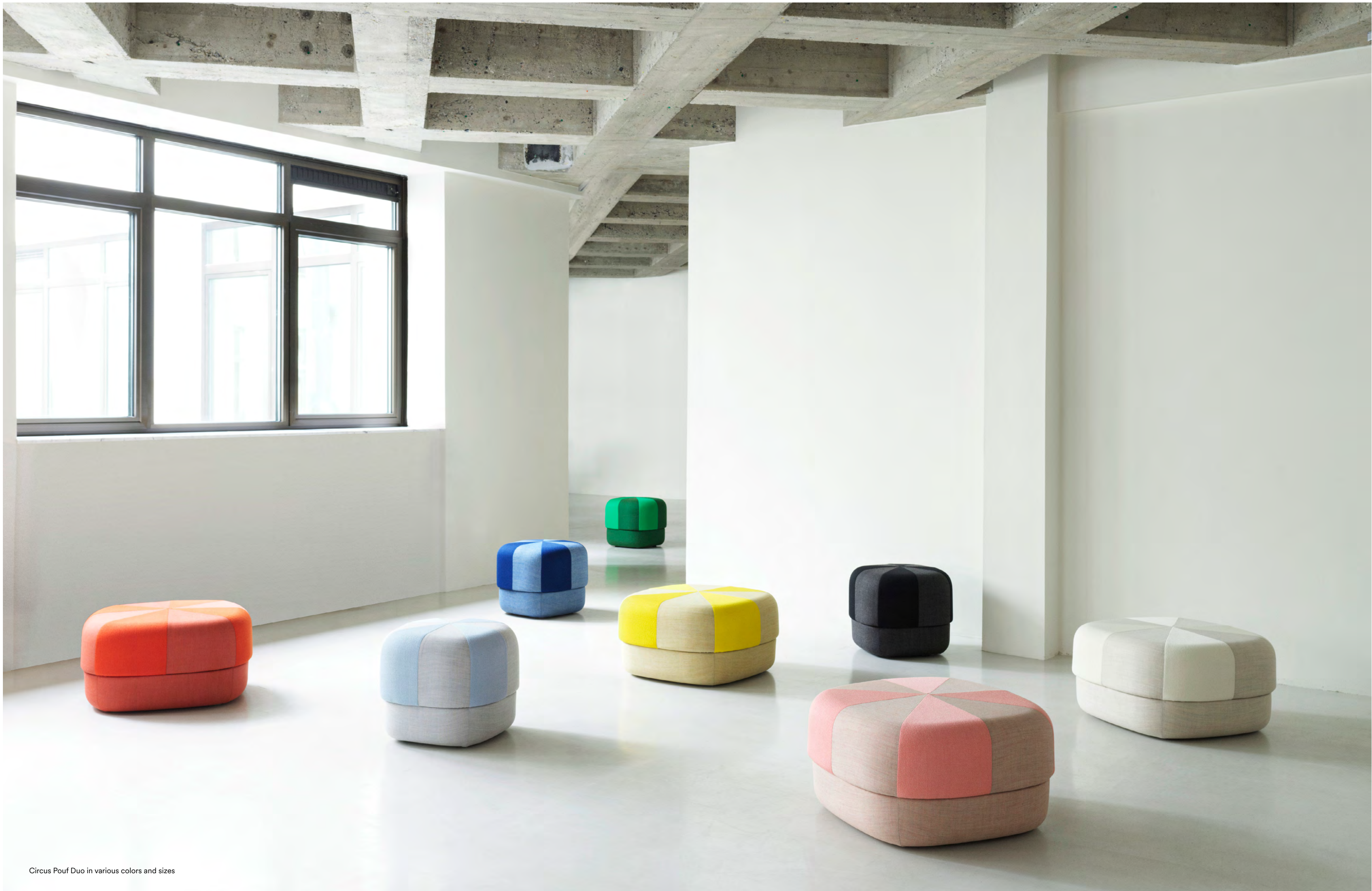
Circus Pouf Duo in various colors and sizes