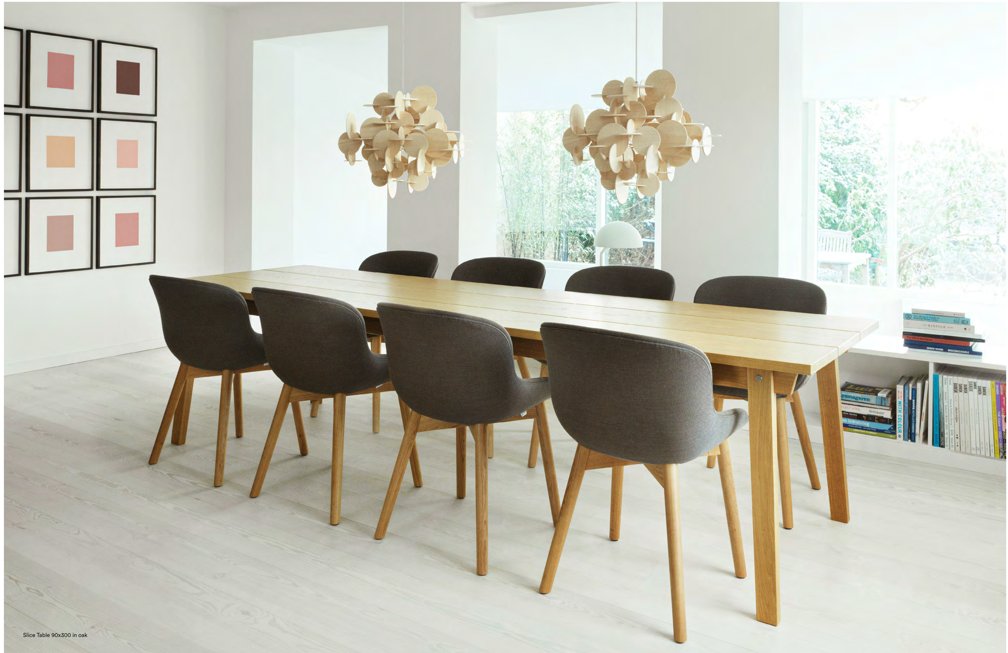
Slice Table 90x300 in oak