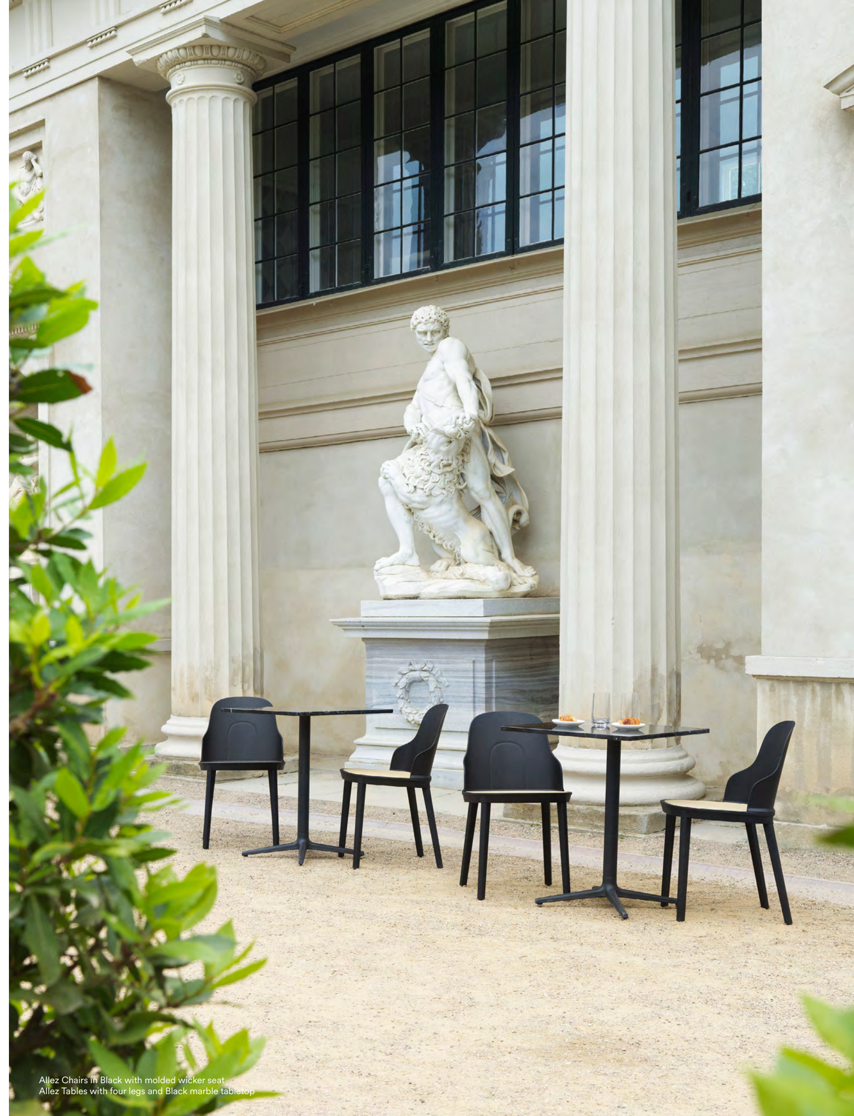
Allez Chairs in Black with molded wicker seat Allez Tables with four legs and Black marble tabletop