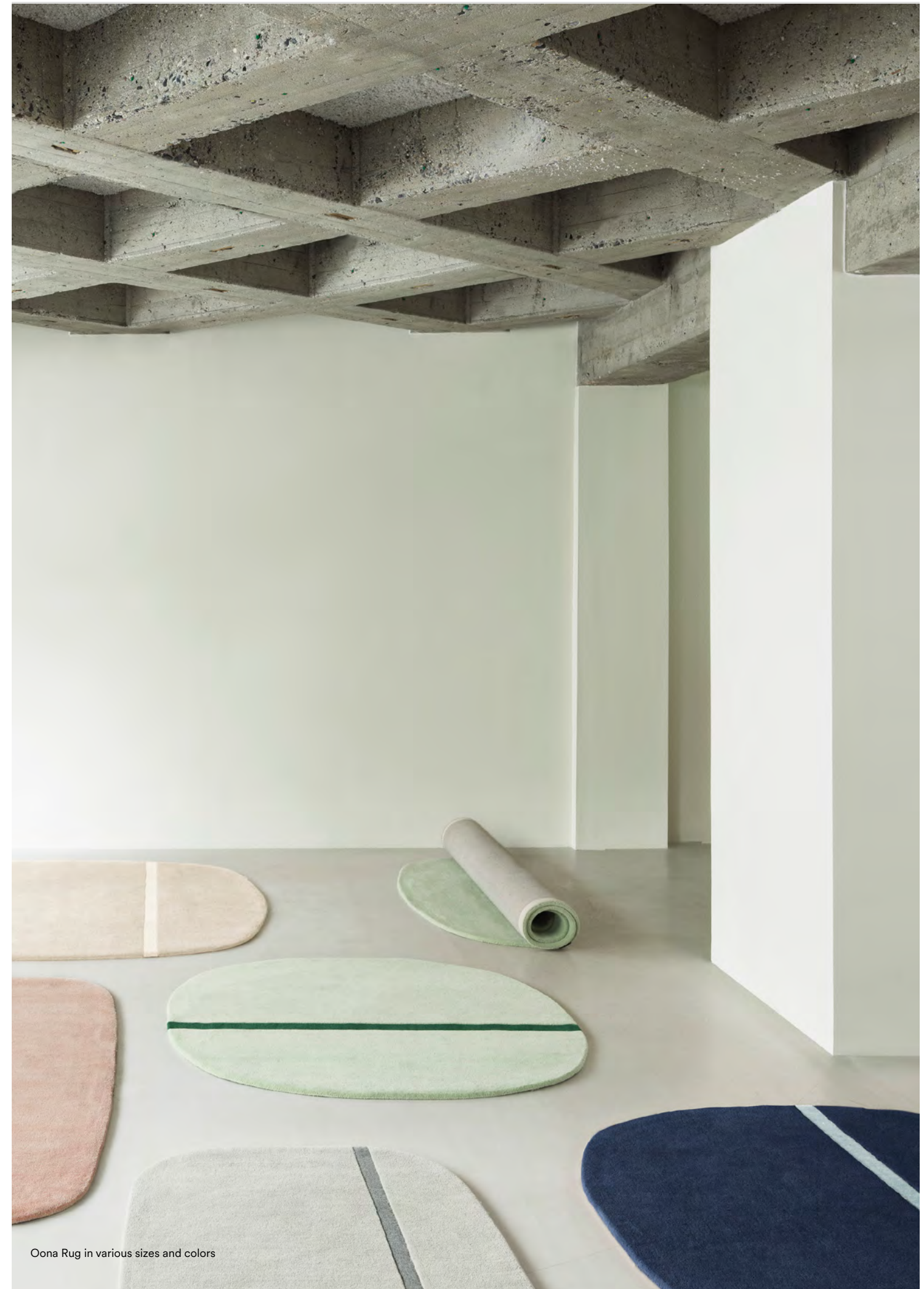
Oona Rug in various sizes and colors