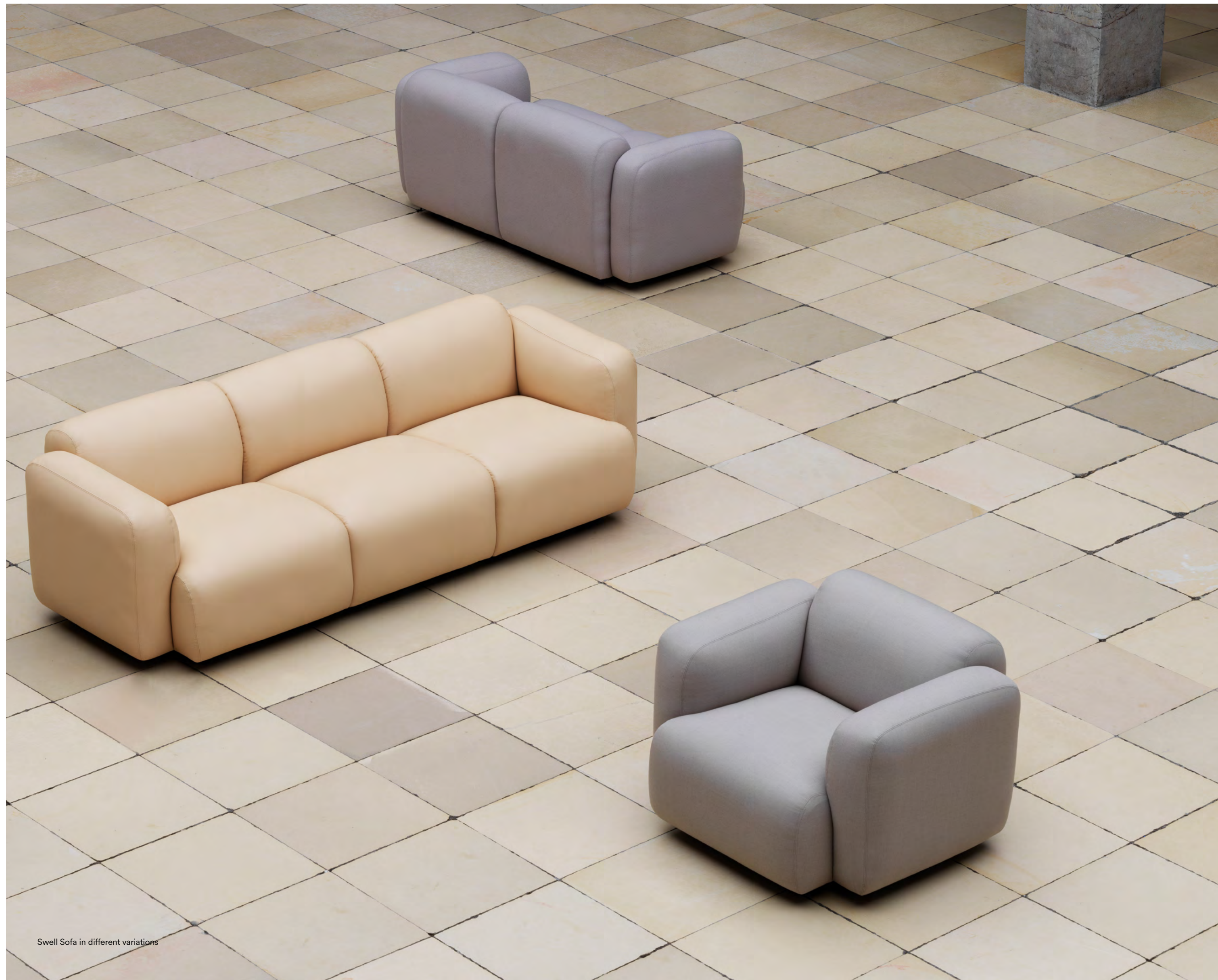
Swell Sofa in different variations