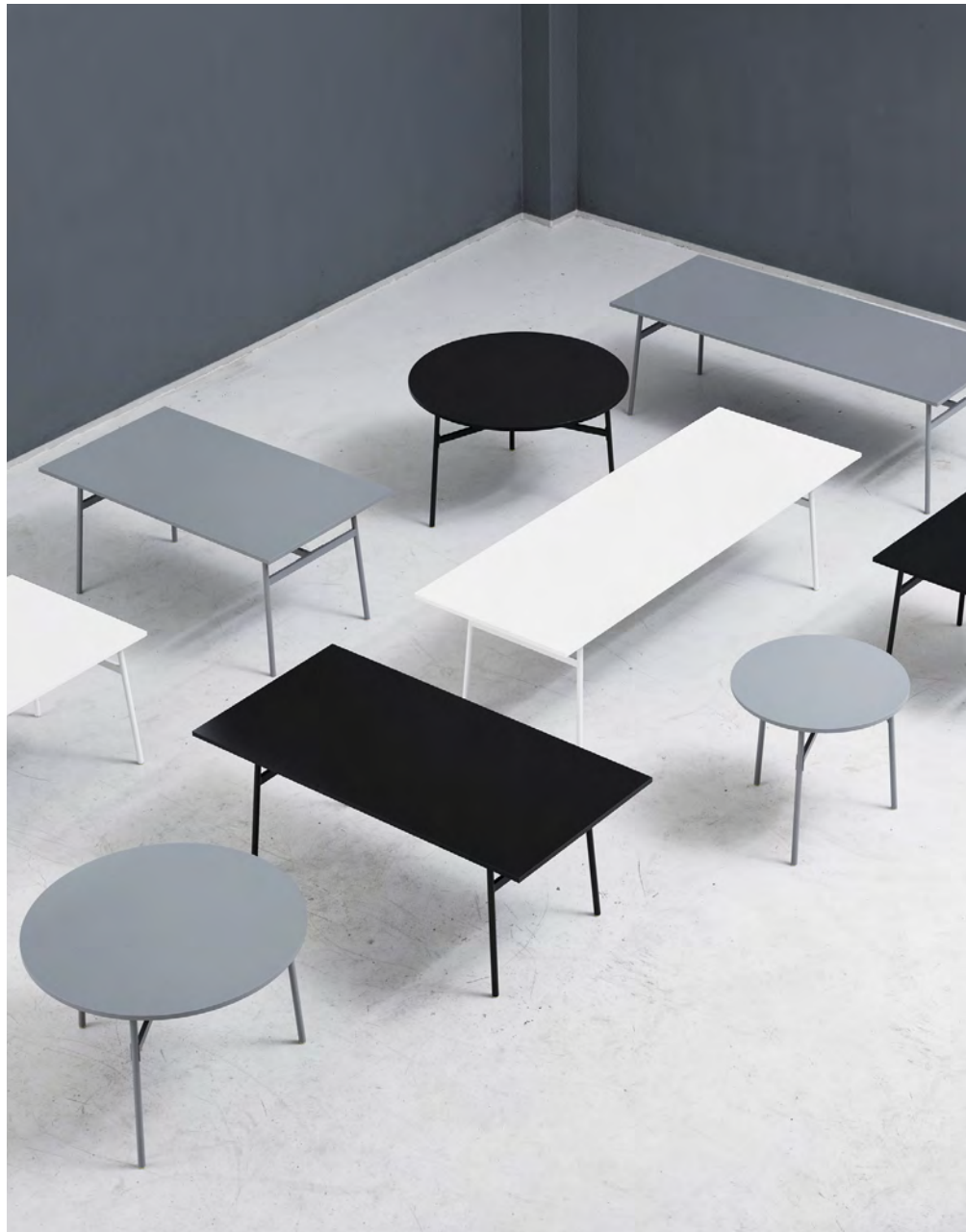
Union Table in various combinations