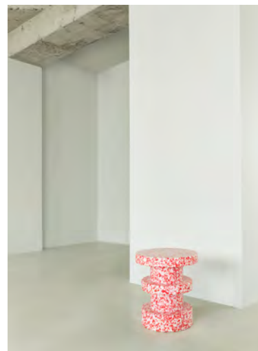
Bit Stool Stack in Red