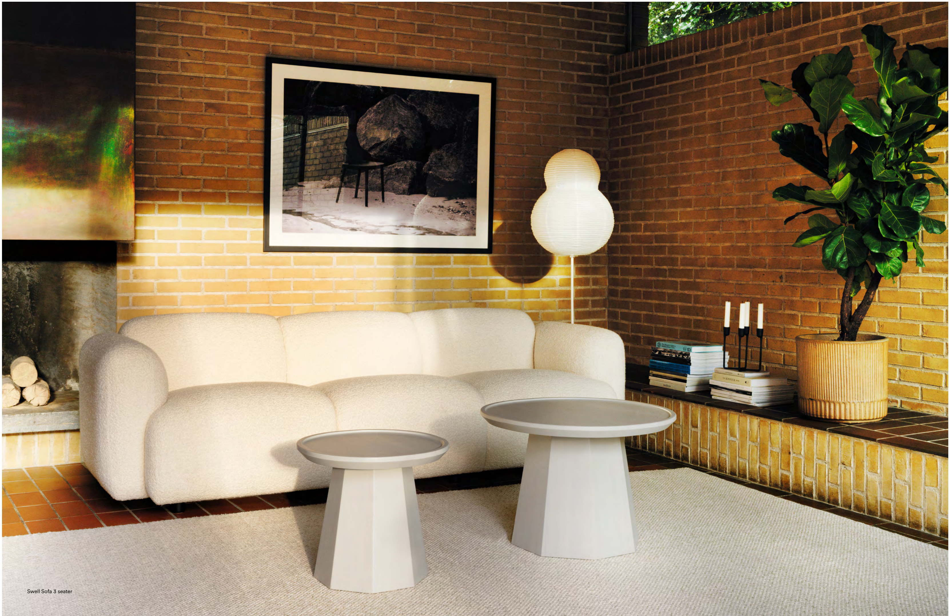
Swell Sofa 3 seater