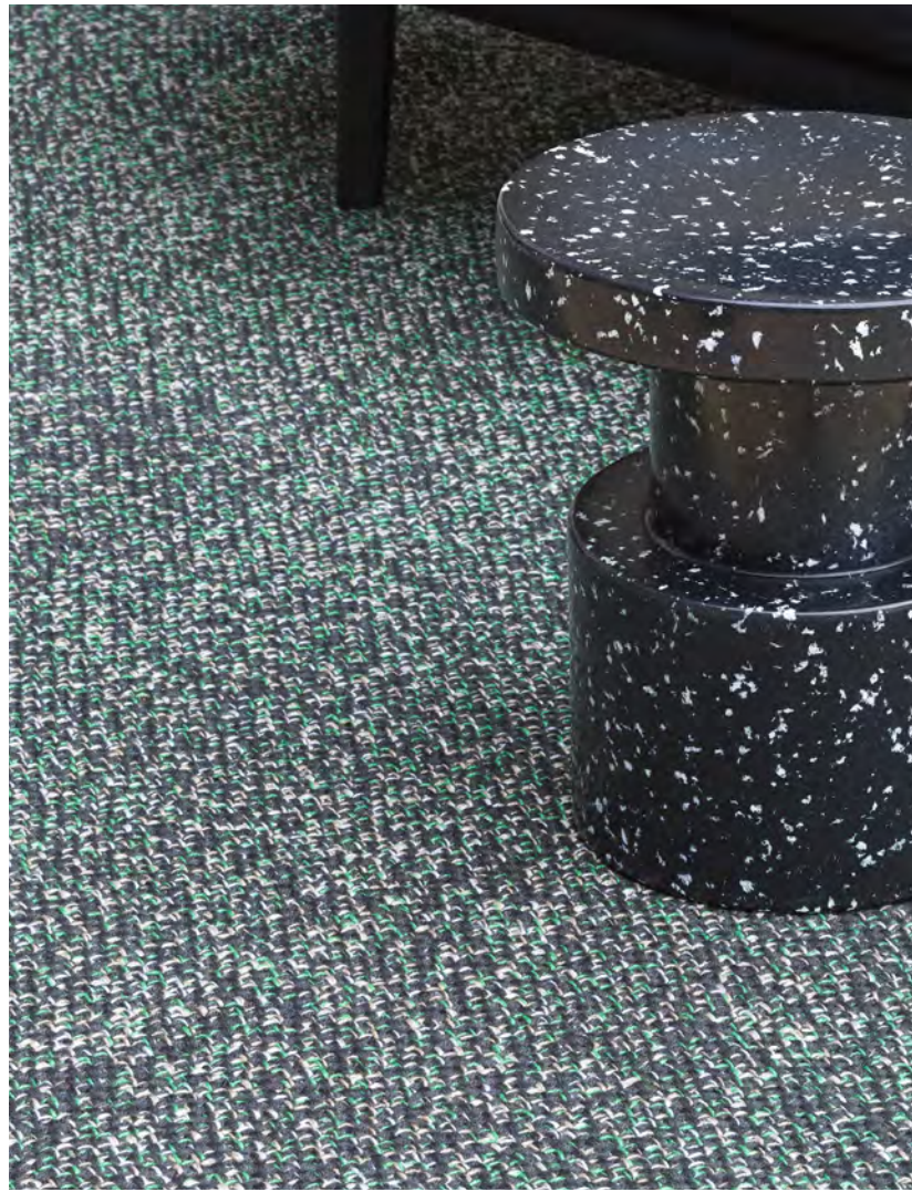
Polli Rug in Dark Grey Multi