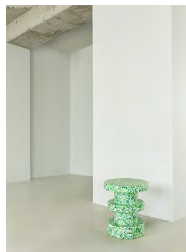
Bit Stool Stack in Green