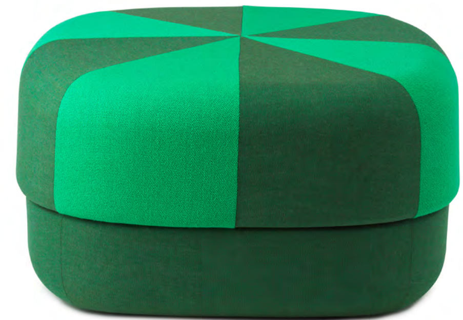
Circus Pouf Duo Large in Green

The versatile Circus Pouf allows contradictions to meet in a design whose style is strict and minimalist, while at the same time having a soft and inviting expression. Circus Pouf comes in a luxurious velvet upholstery, while Circus Pouf Duo comprises two wool textiles in complementing tones, resembling the distinctive stripes of a circus tent, alluding to the popular pouf's name.