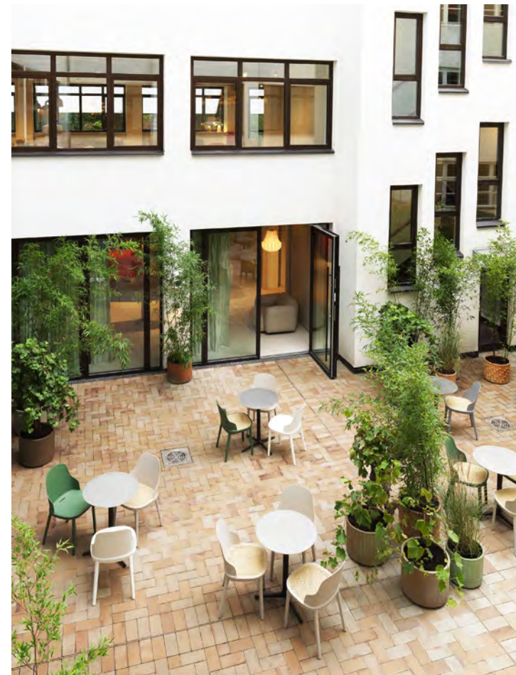
Allez Chairs & Tables in various combinations