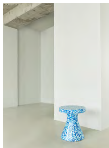
Bit Stool Cone in Blue