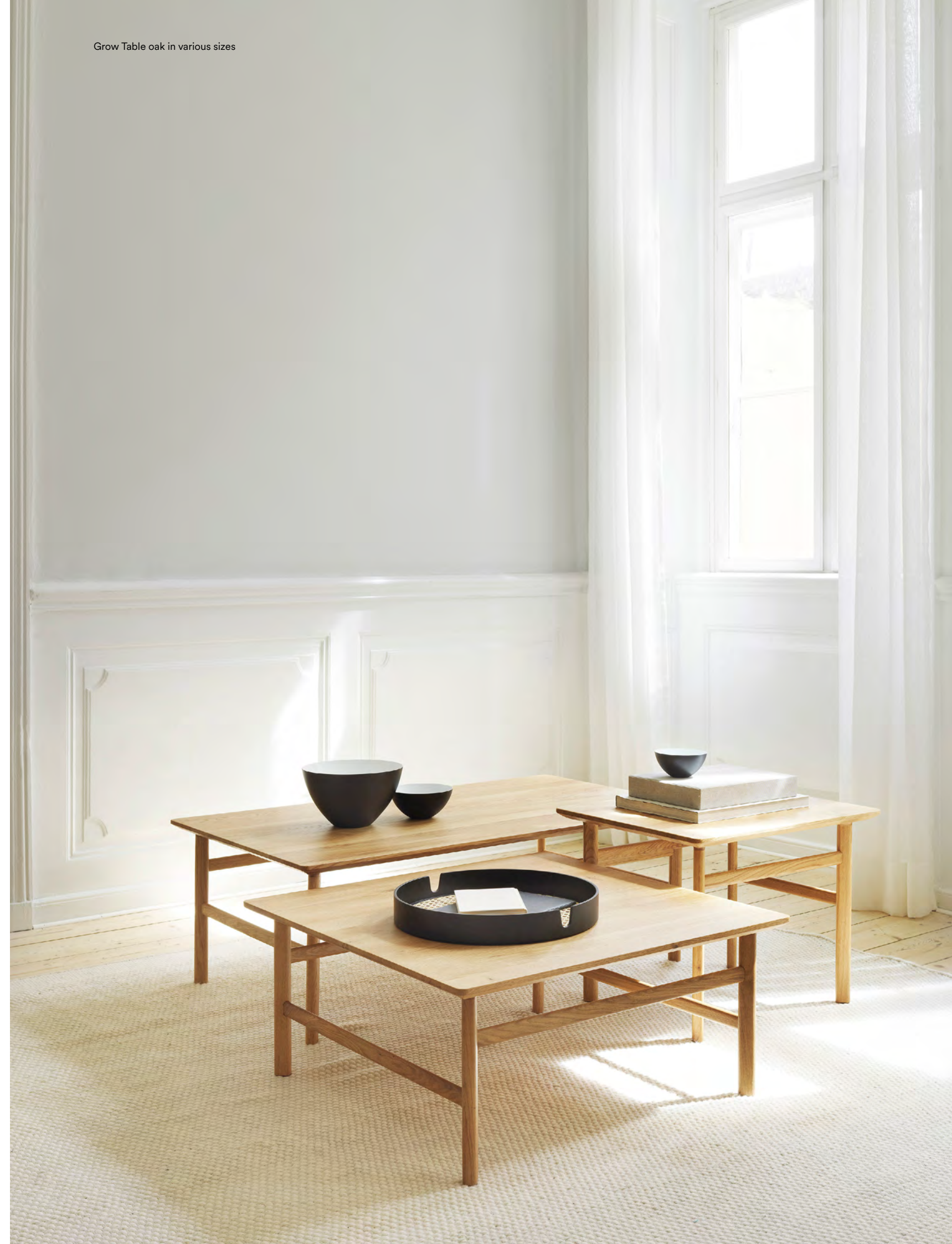
Grow Table oak in various sizes

Grow Coffee Table is crafted from solid oak in a finely balanced design with references to classic Danish shaker style. Grow gets its name from the distinctive, smooth transition from tabletop to legs, which gives the impression that the legs are growing out of the tabletop. With its simple silhouette and refined details, Grow alludes to the luxury of simplicity.