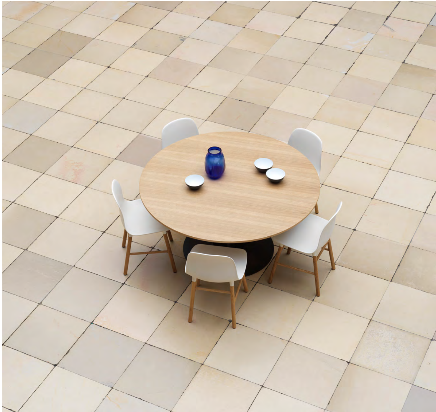
Scala Table H75 Ø150 cm with oak tabletop