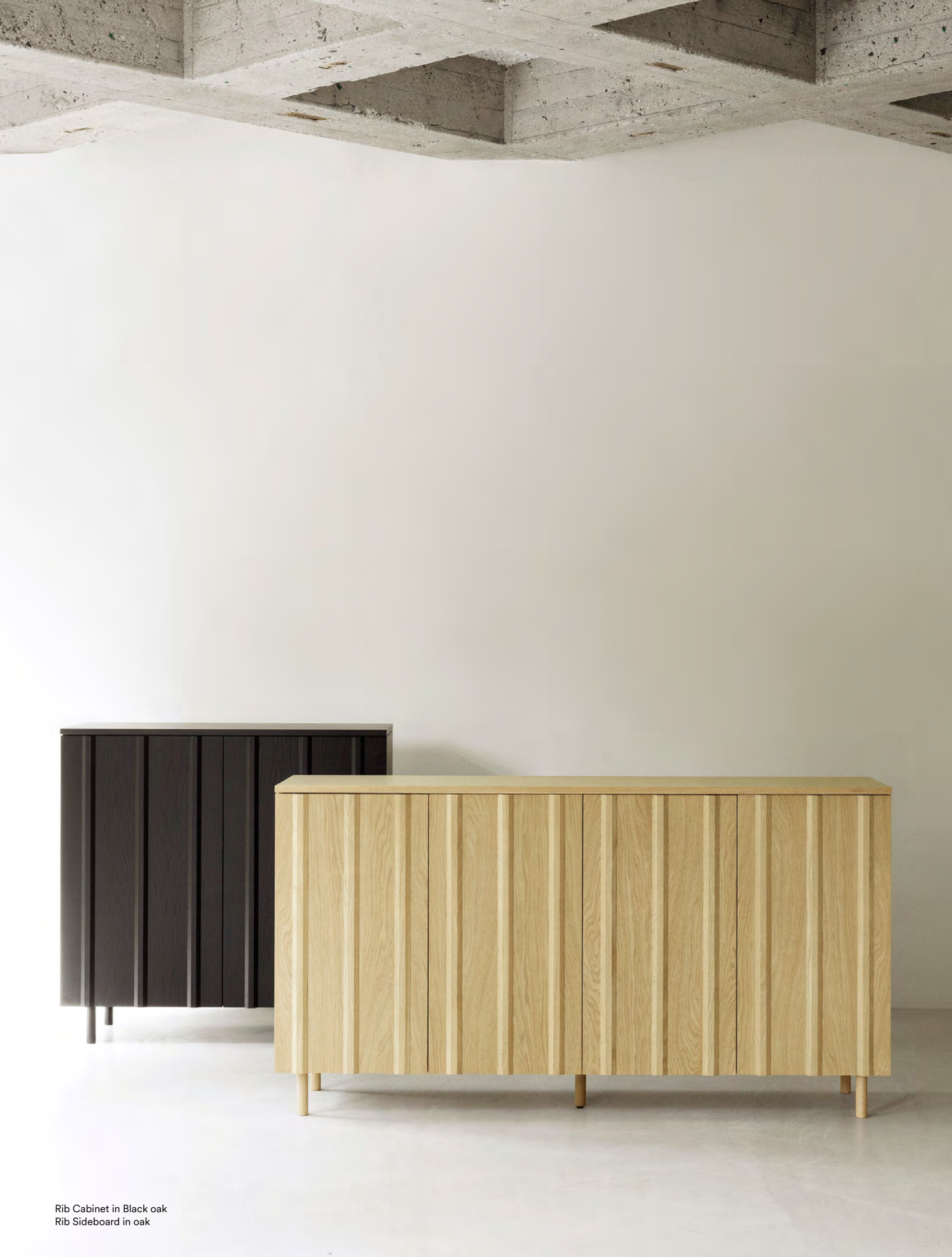
Rib Cabinet in Black oak Rib Sideboard in oak