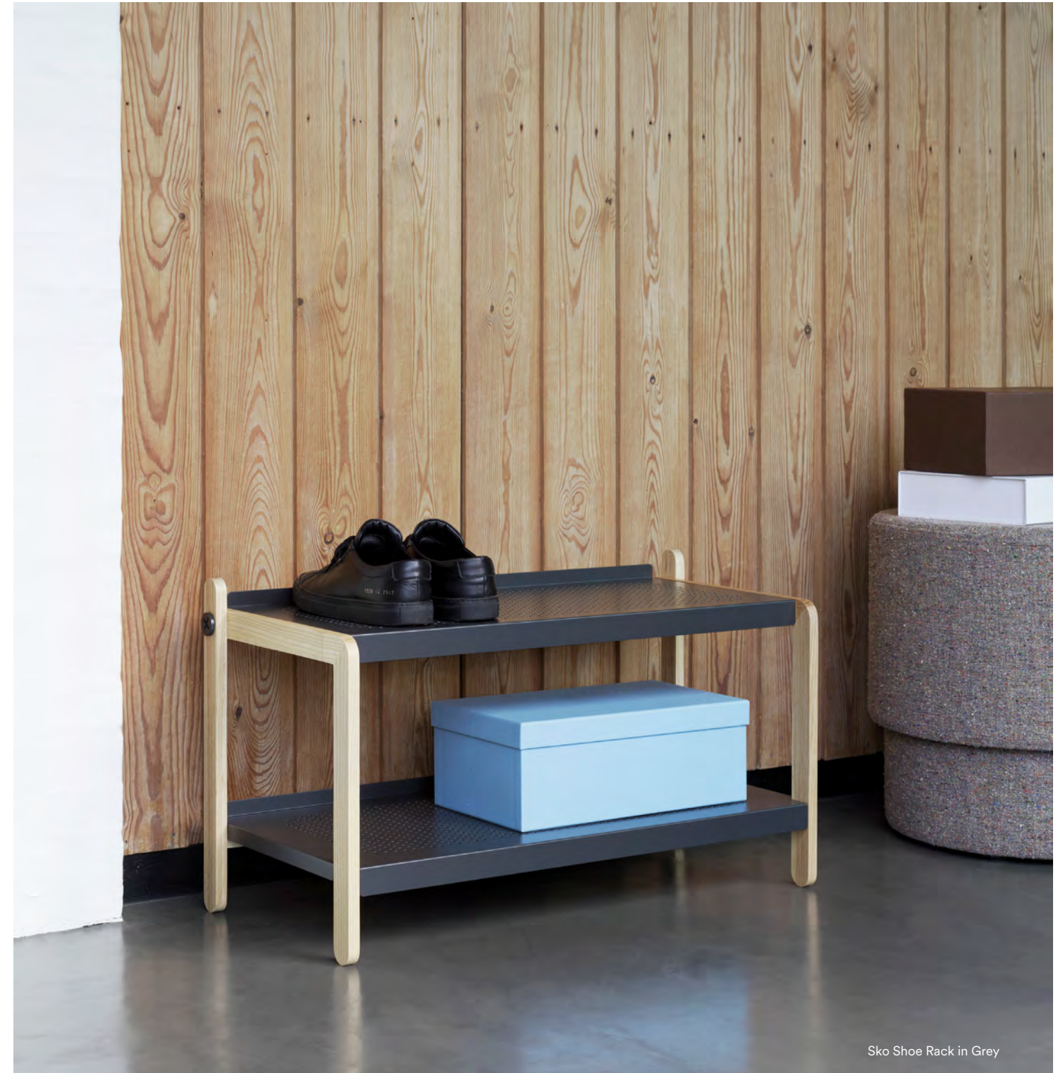
Sko Shoe Rack in Grey