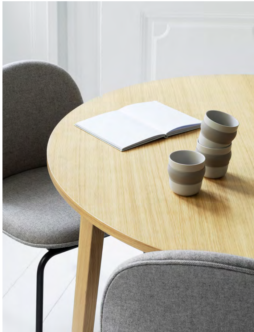
Slice Table H75 Ø120 in oak