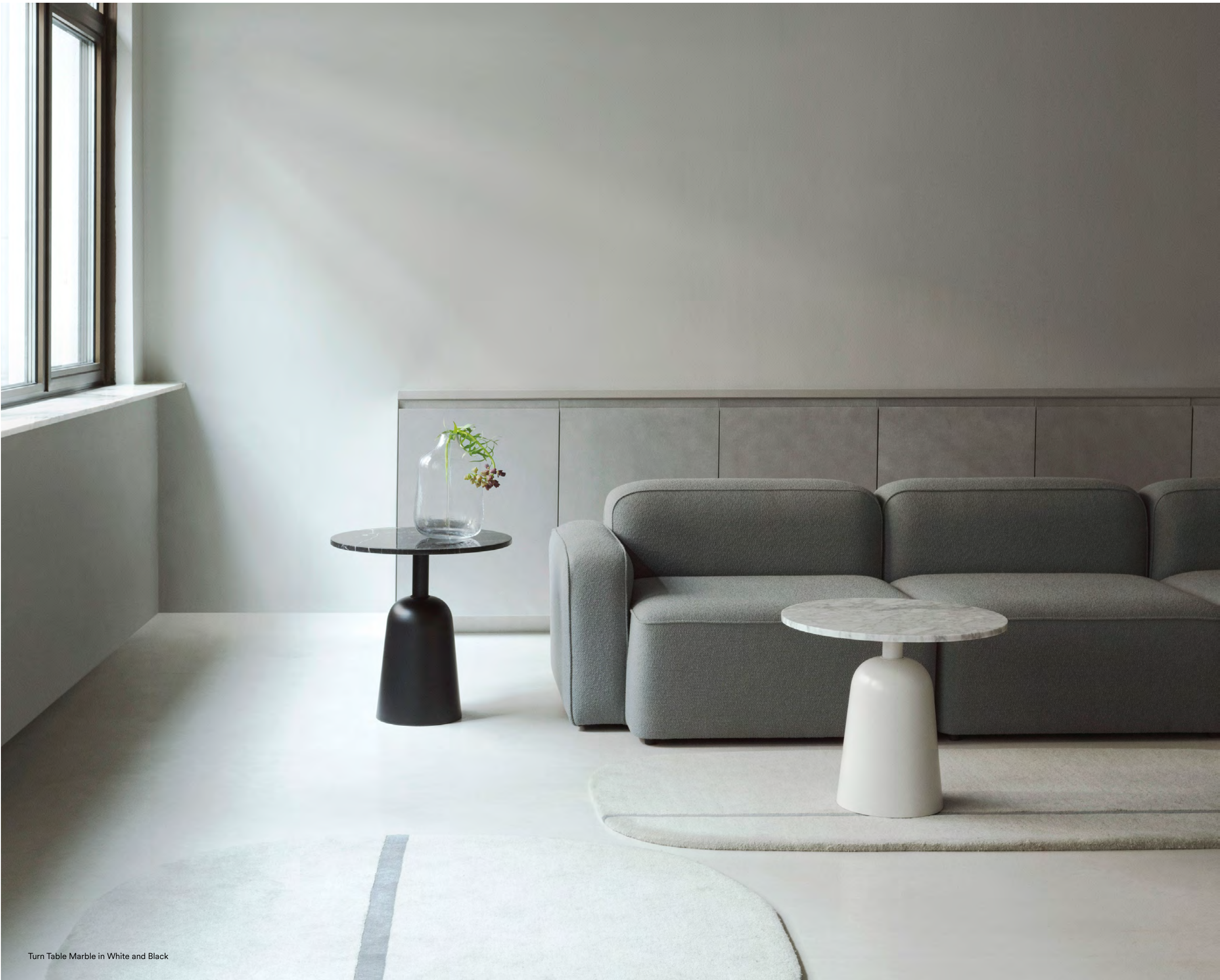
Turn Table Marble in White and Black