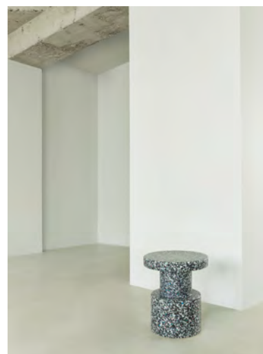
Bit Stool in Black Multi