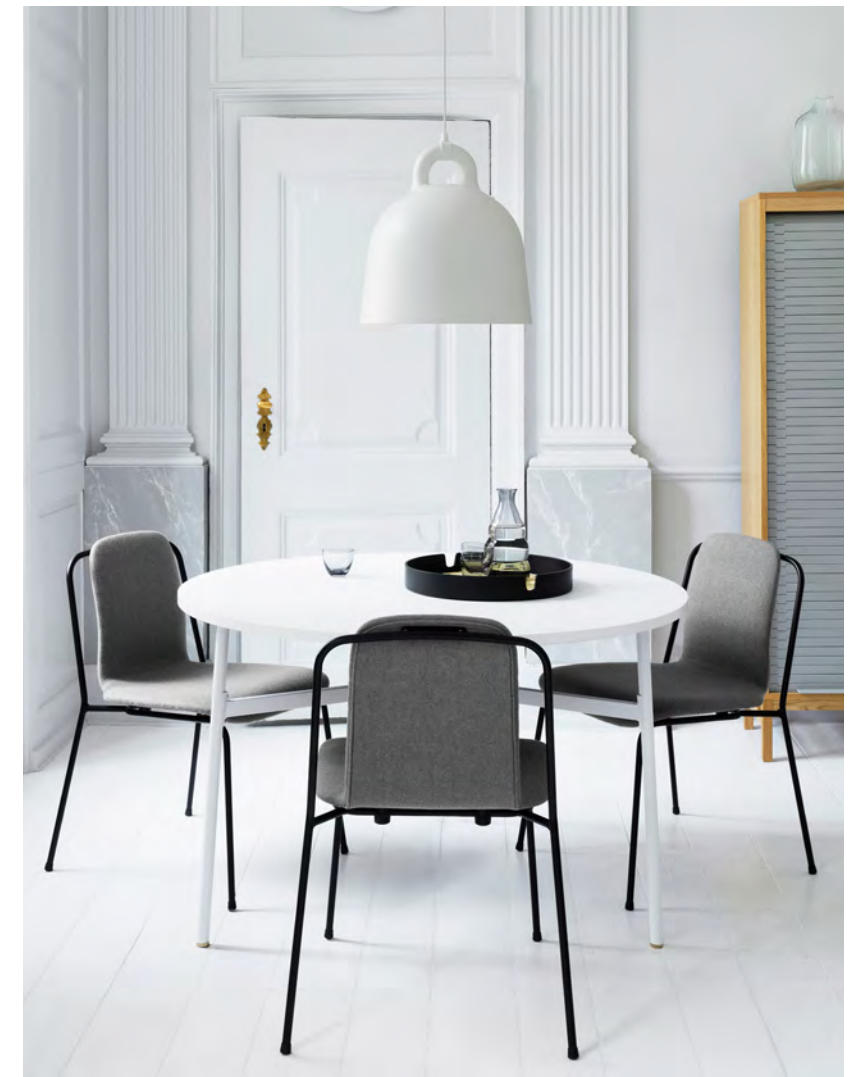
Union Table H75 Ø120 in White