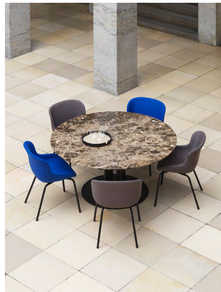
Scala Table H75 Ø150 cm with Coffee marble tabletop