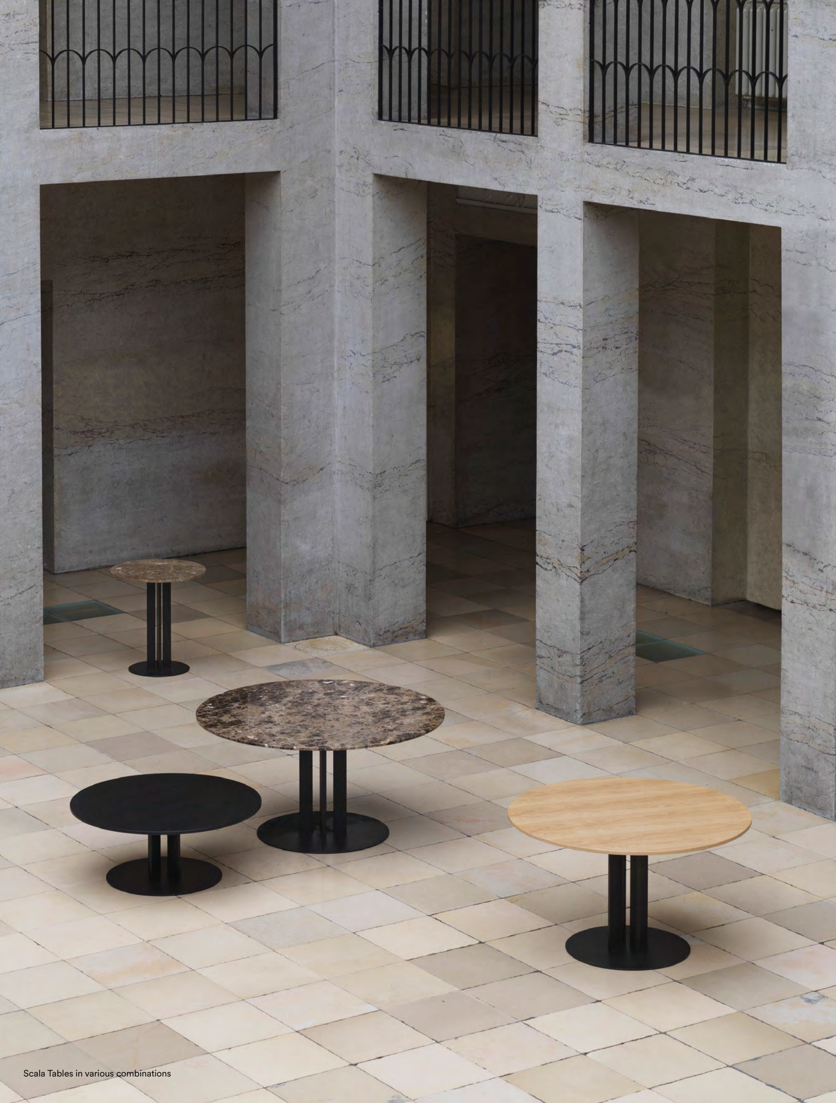
Scala Tables in various combinations