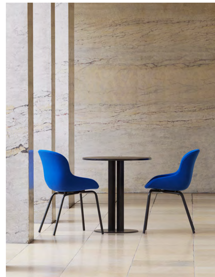
Scala Table H75 Ø70 cm with Black oak tabletop