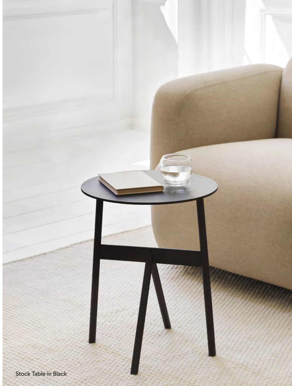
Stock Table in Black