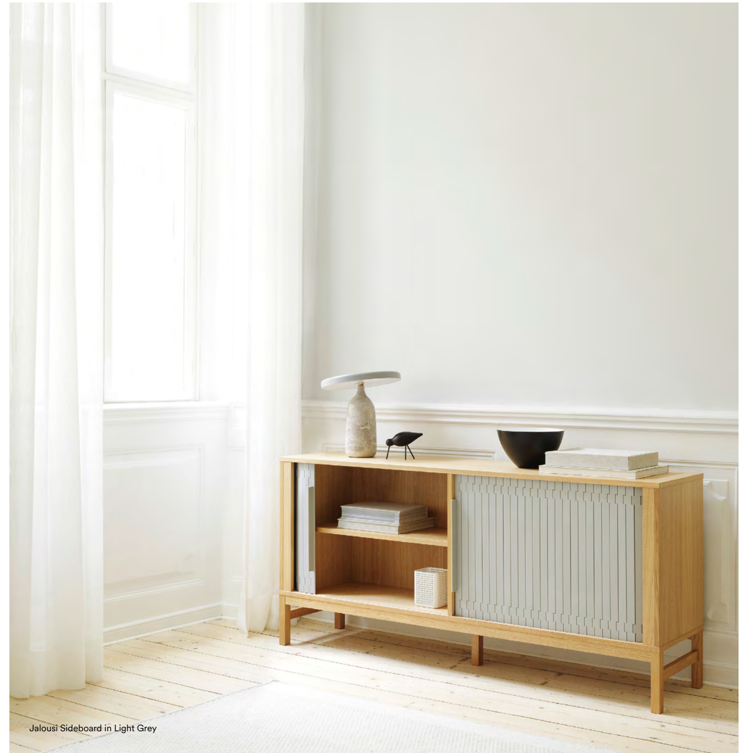
Jalousi Sideboard in Light Grey