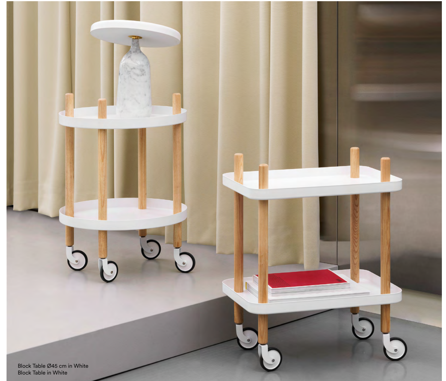
Block Table Ø45 cm in White Block Table in White