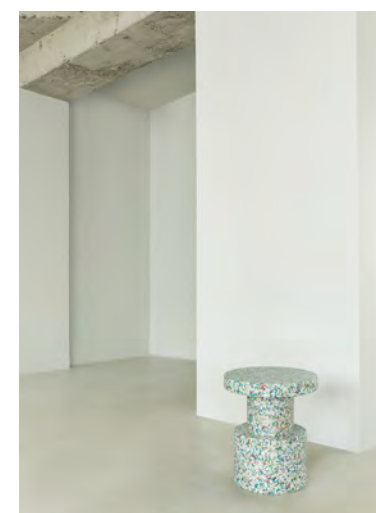
Bit Stool in White Multi