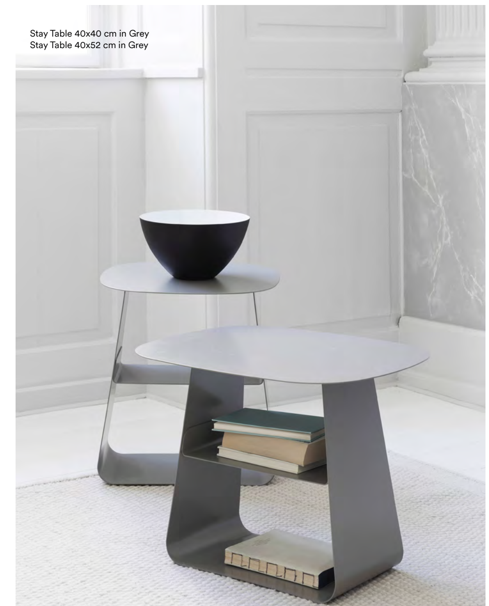
Stay Table 40x40 cm in Grey Stay Table 40x52 cm in Grey

Different interiors require different types of tables. Stay Table offers a range of small, multifunctional tables in two sizes designed for all settings and numerous uses. The rounded shape of the table stands in contrast to the flat and hard steel, giving Stay a simultaneously organic and industrial look. The practical, built-in shelf is ideal for storing magazines, books, design objects or toys.