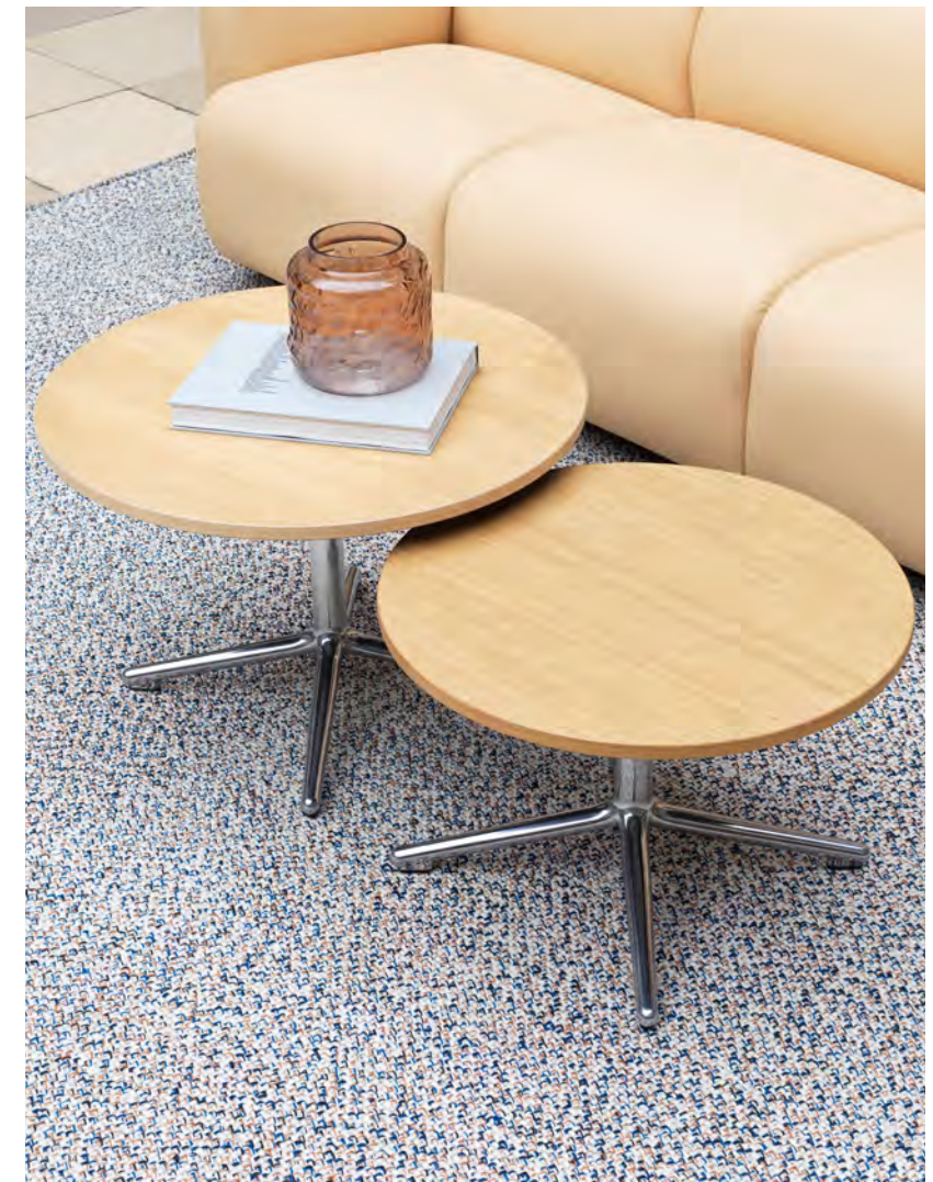
Lunar Coffee Table H45 Ø60 cm with aluminum legs and oak tabletop Lunar Coffee Table H40 Ø70 cm with aluminum legs and oak tabletop