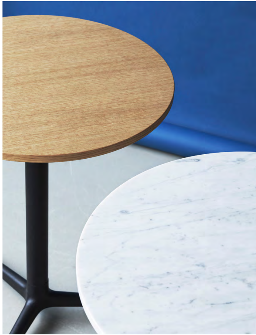
Allez Table with oak tabletop Allez Table with White marble tabletop