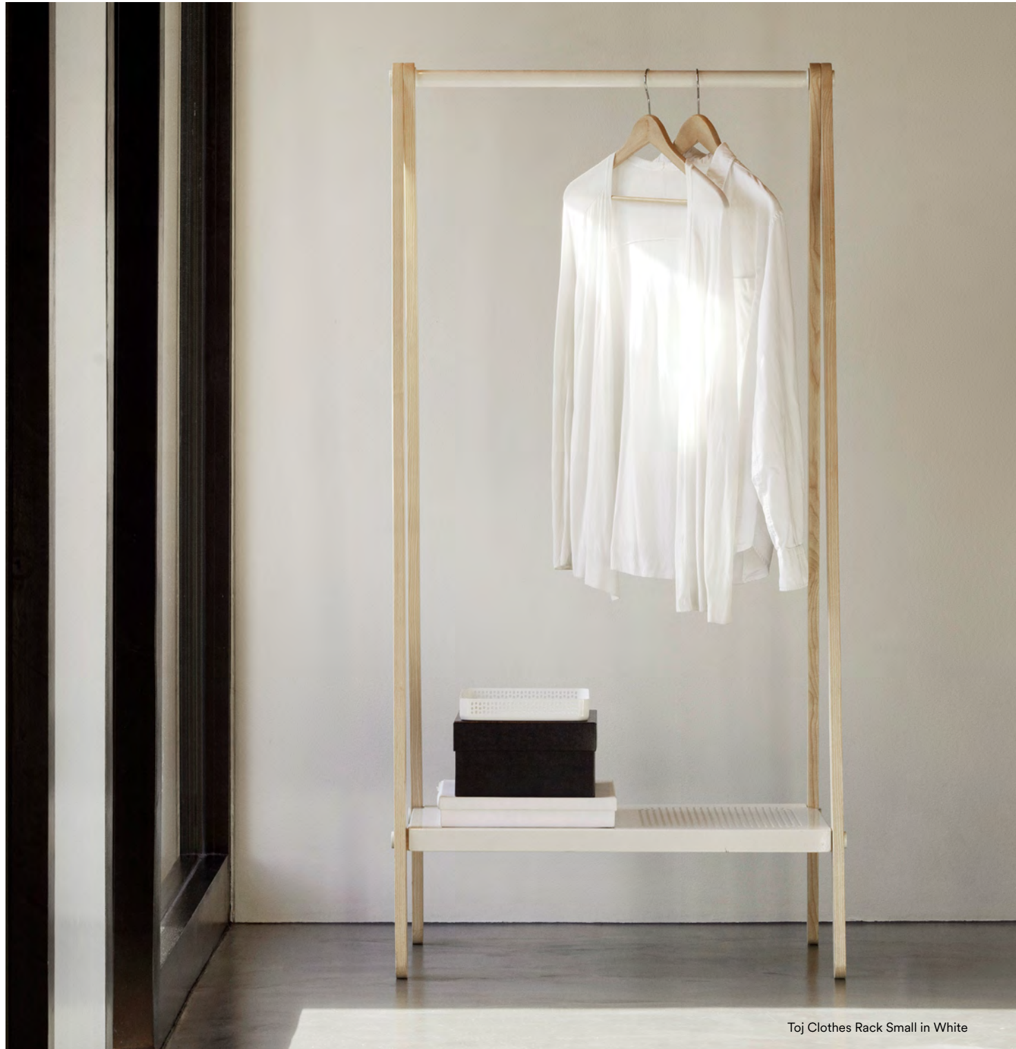
Toj Clothes Rack Small in White