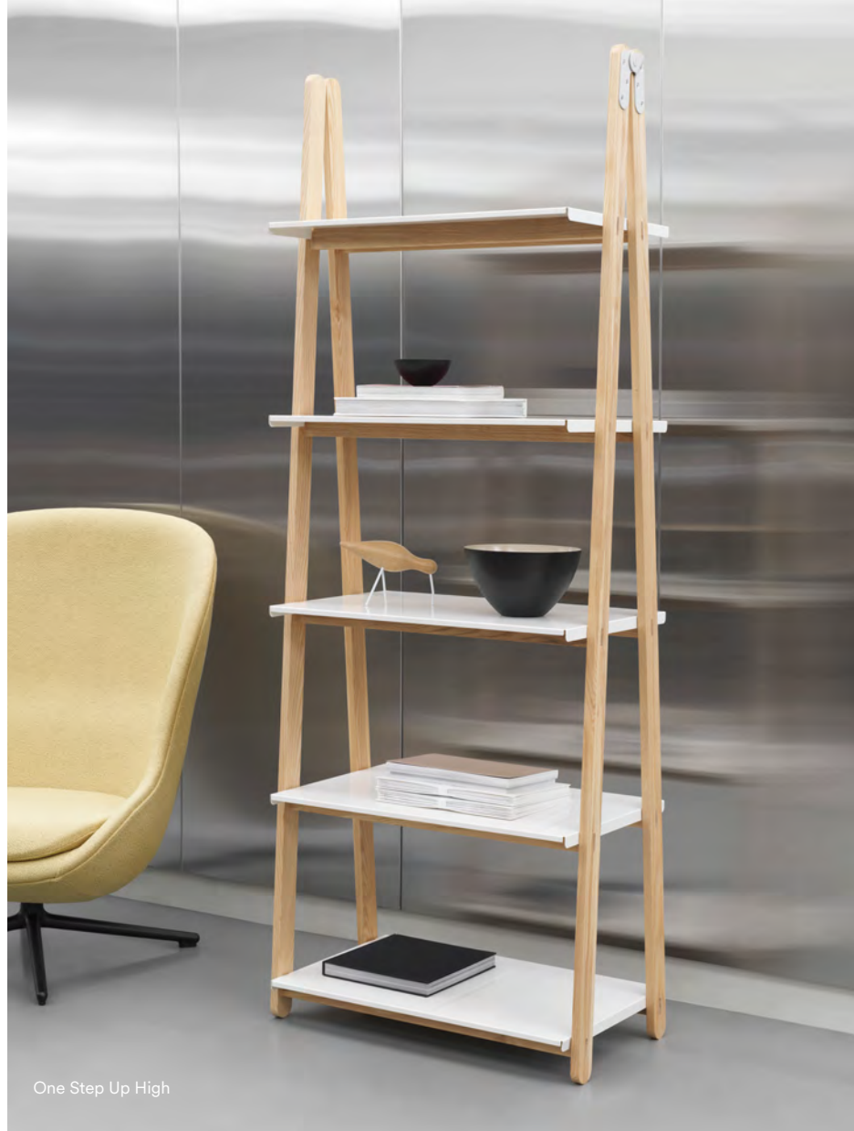
One Step Up High