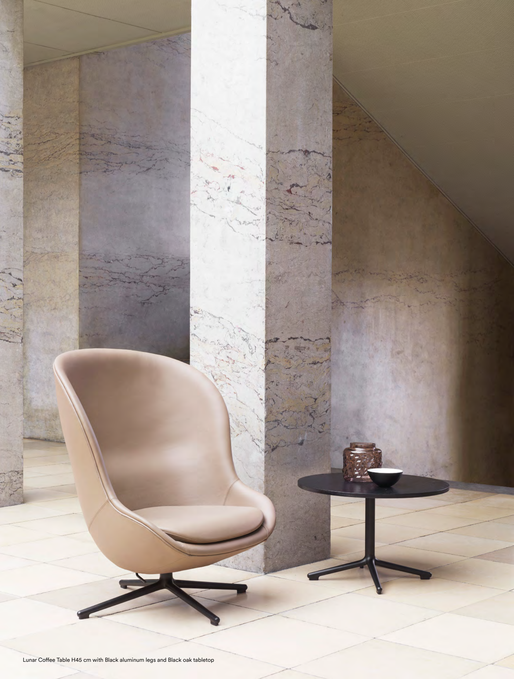
Lunar Coffee Table H45 cm with Black aluminum legs and Black oak tabletop