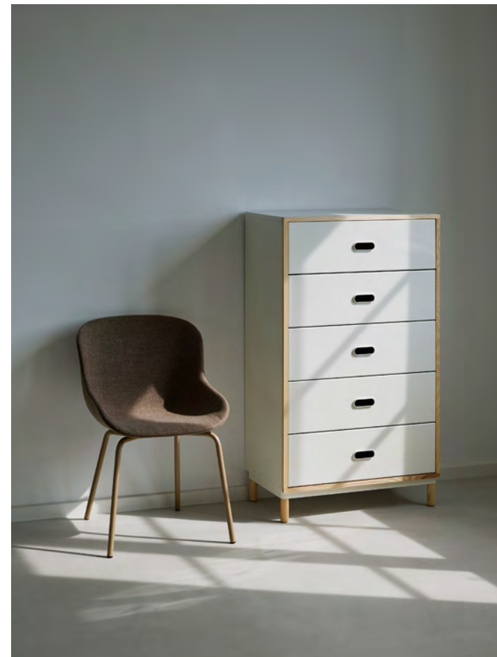
Kabino Dresser with five drawers in White