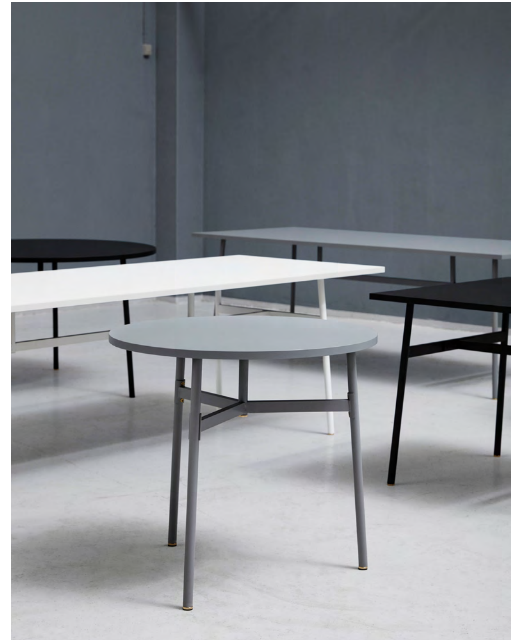
Union Table in various combinations