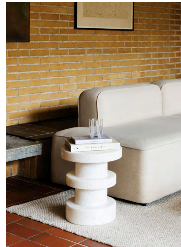
Bit Stool Stack in White/White

Bit Stool's straightforward, utilitarian look contrasts with the pixelated surface made up of small bits of 100% recycled plastic. For the production of Bit, post-industrial and post-household plastic waste is sorted, granulated into small fragments and melted in a special mold. This is a particular process where the plastic fragments are heated to a 120°C melting point, making it possible to repeatedly reuse and reheat the material without altering its properties. The result is a circular stool design with a distinctive thickness and composition. The plastic granulate is sorted into different colors, and due to its origin and production method, every Bit Stool is a bit unique.