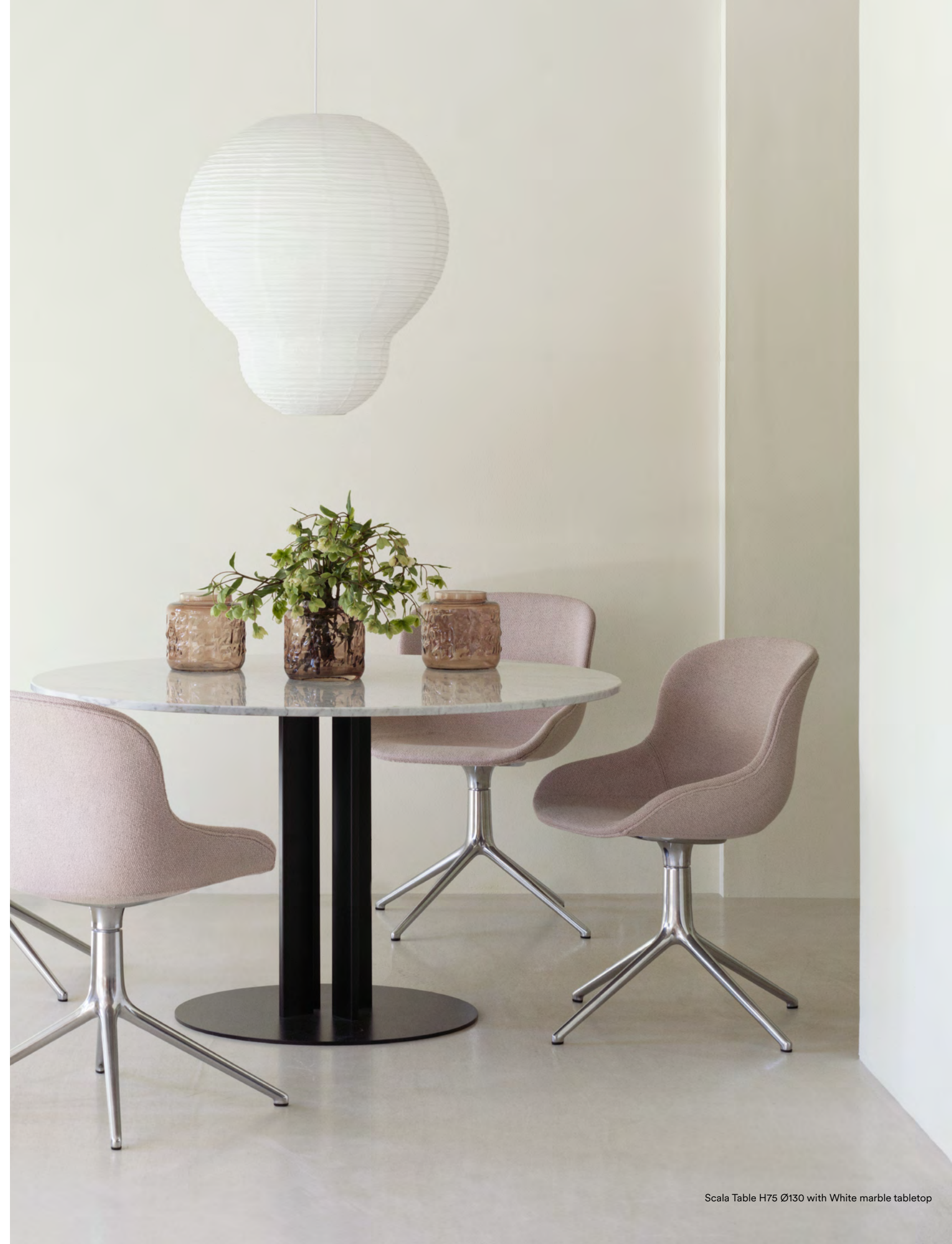
Scala Table H75 Ø130 with White marble tabletop