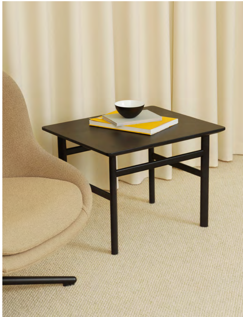
Grow Table Small in Black oak