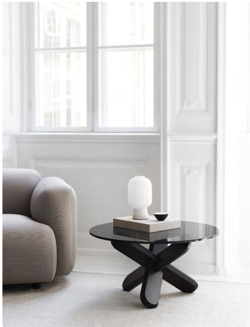
Ding Table with Black oak legs and Smoke glass tabletop