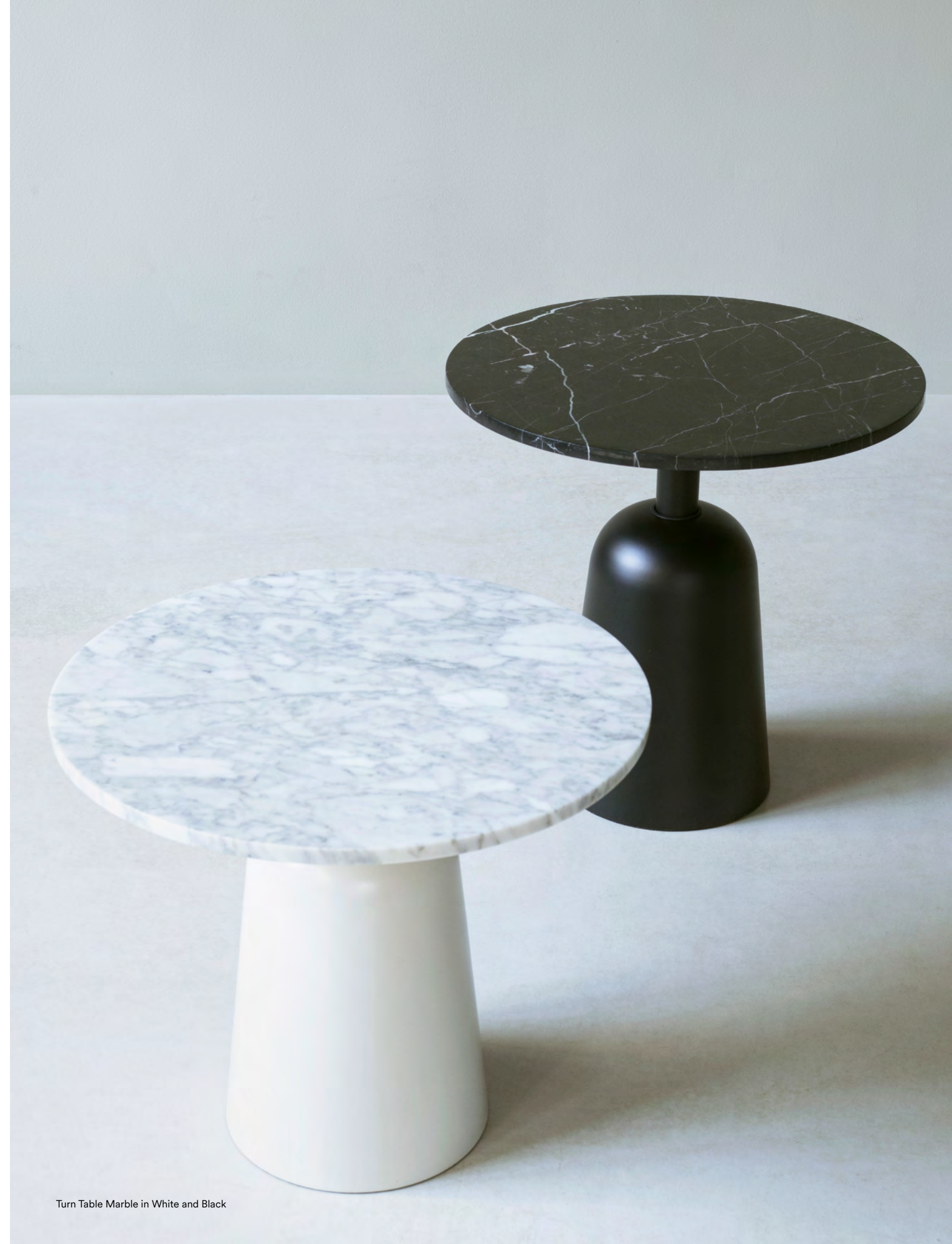
Turn Table Marble in White and Black

Turn Table is a small yet functional table with a steel base and a wood or marble tabletop. The name refers to the rotational movement used to adjust the height of its round tabletop, gently raising it up from its bell-shaped steel base. With a minimum height of 41.5 cm and a maximum height of 66.5 cm, this small table can be easily adjusted to suits its existing surroundings.