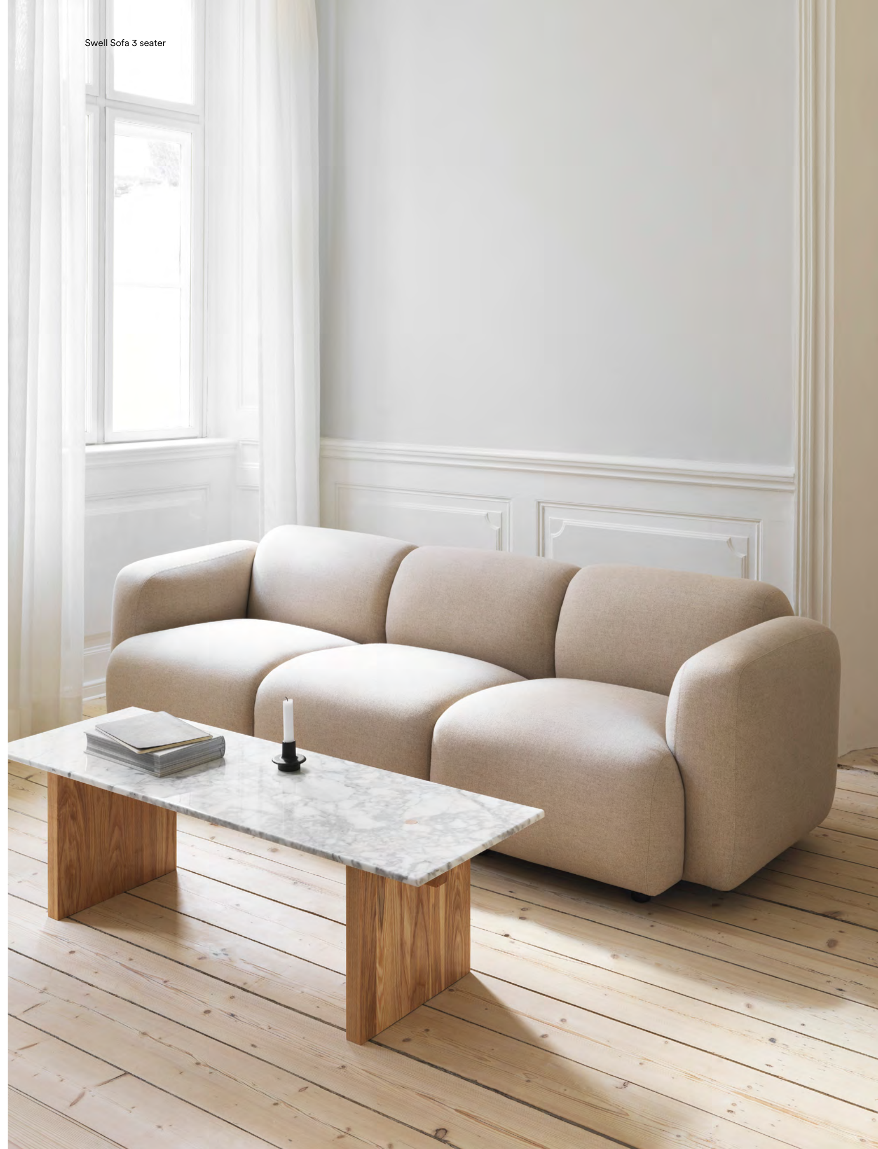
Swell Sofa 3 seater