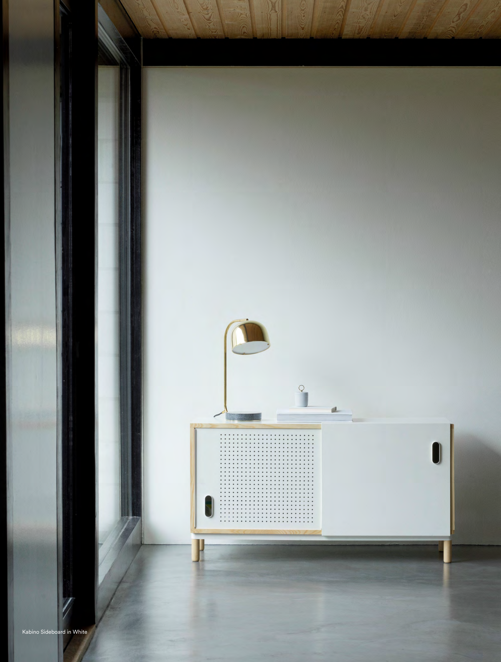
Kabino Sideboard in White