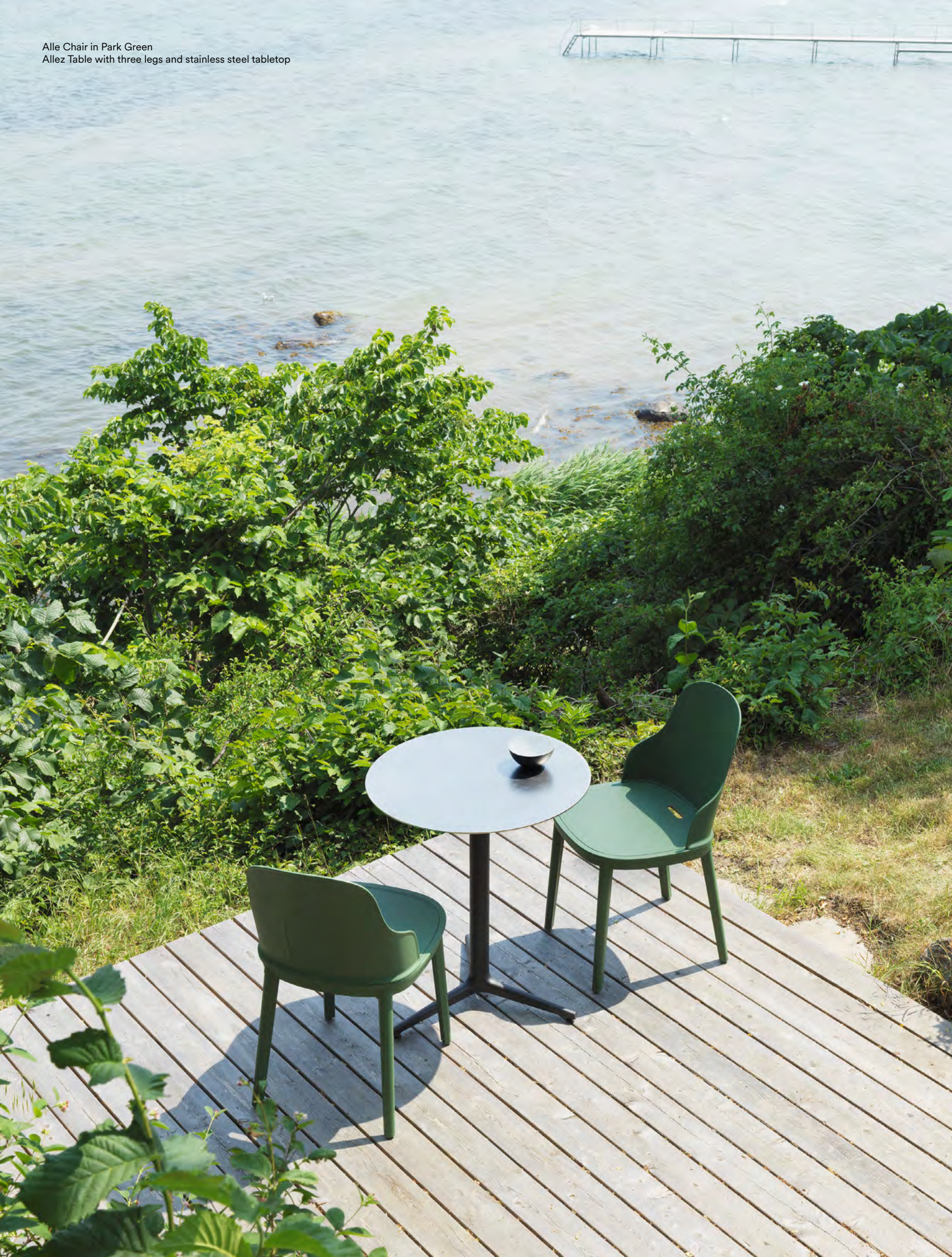
Alle Chair in Park Green Allez Table with three legs and stainless steel tabletop