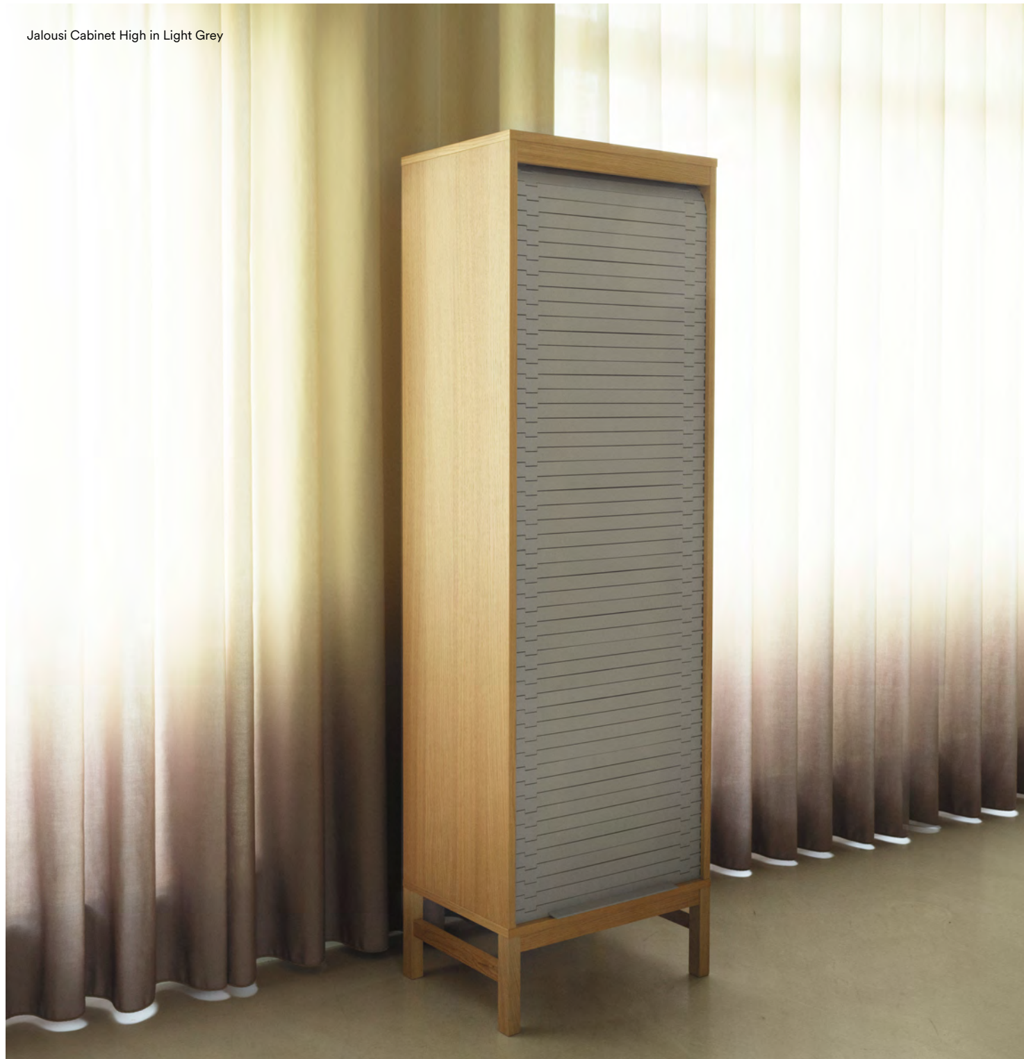
Jalousi Cabinet High in Light Grey