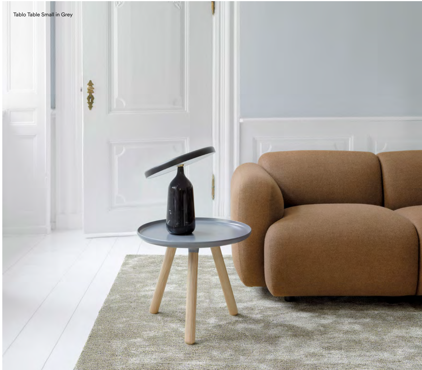
Tablo Table Small in Grey