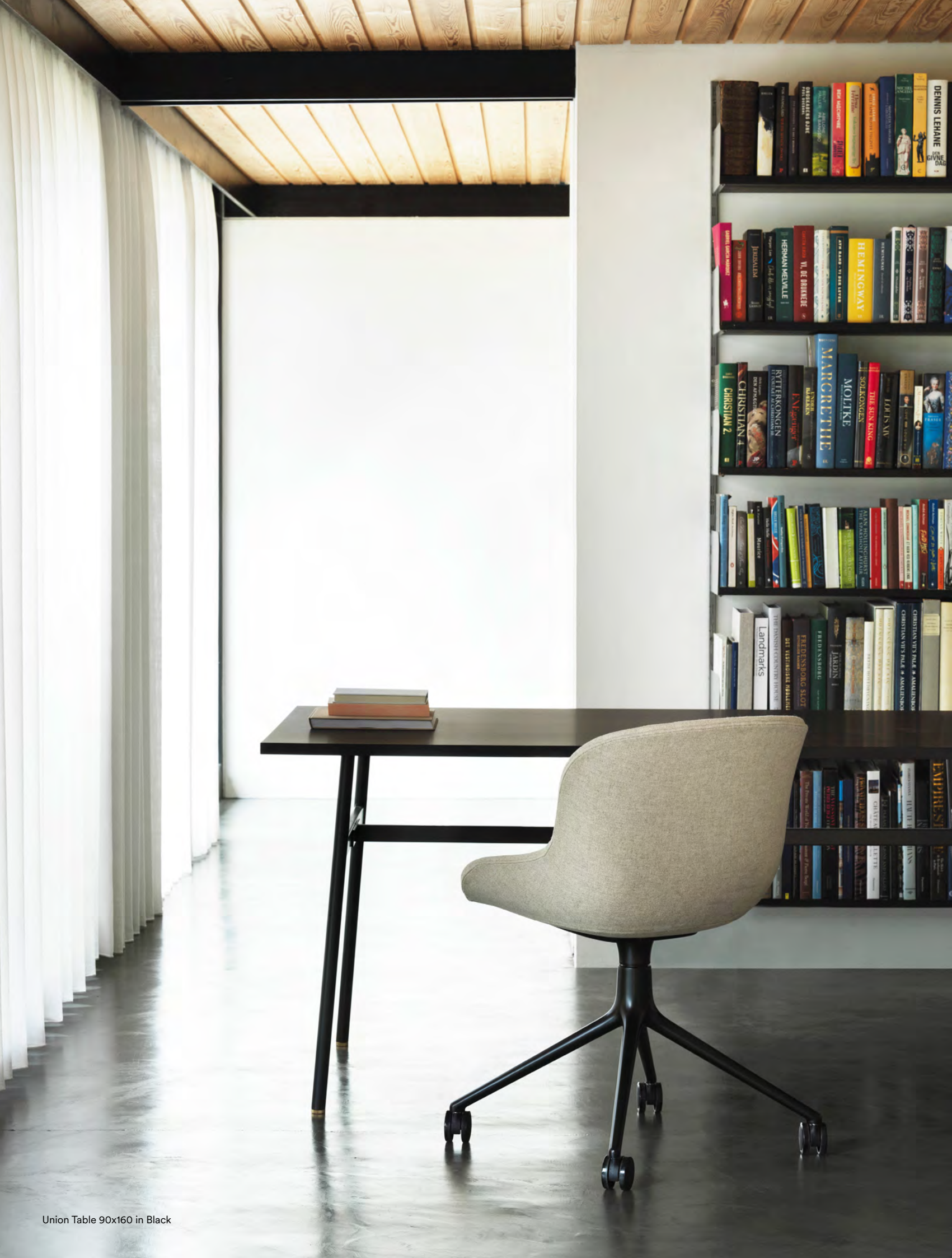
Union Table 90x160 in Black