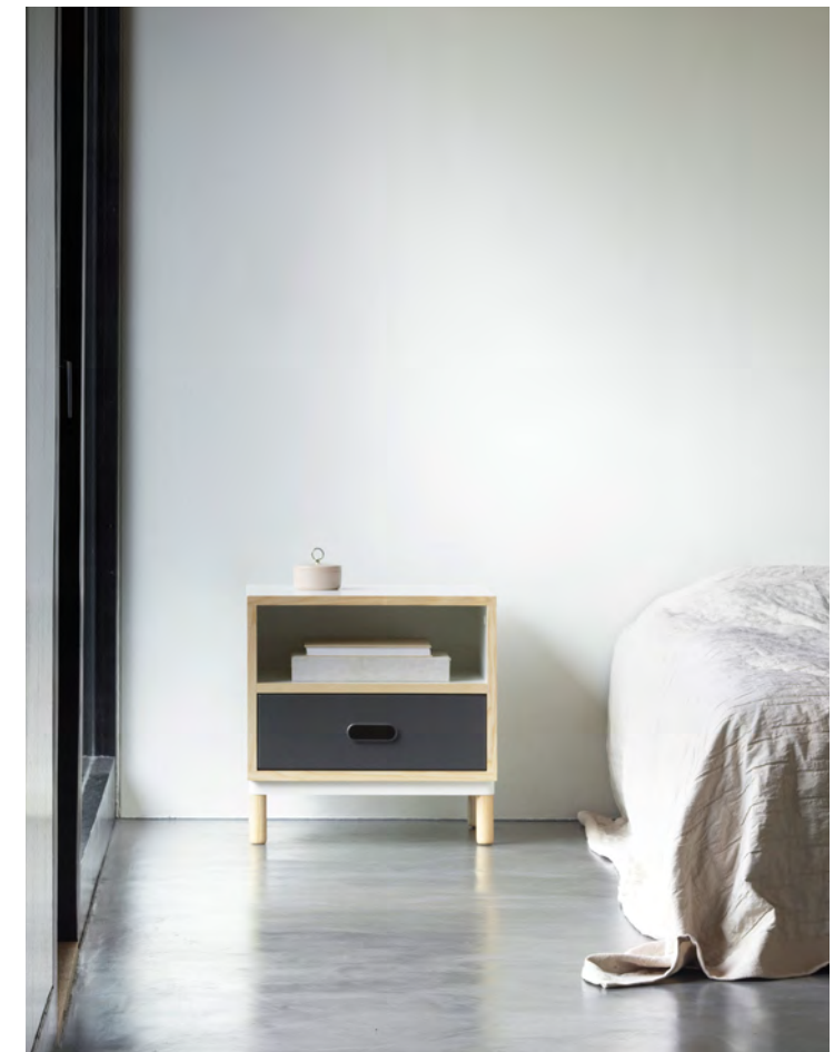
Kabino Bedside Table in Grey