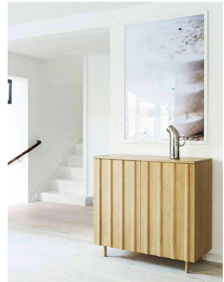
Rib Cabinet in oak