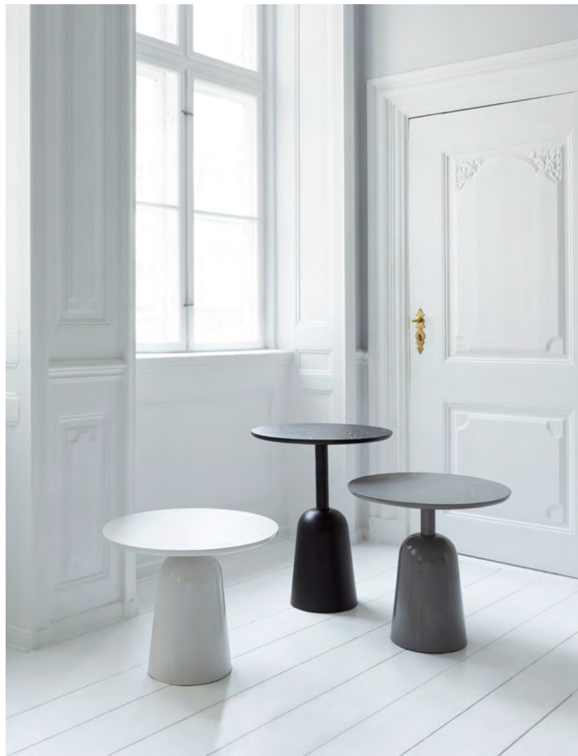
Turn Table in White, Black and Grey