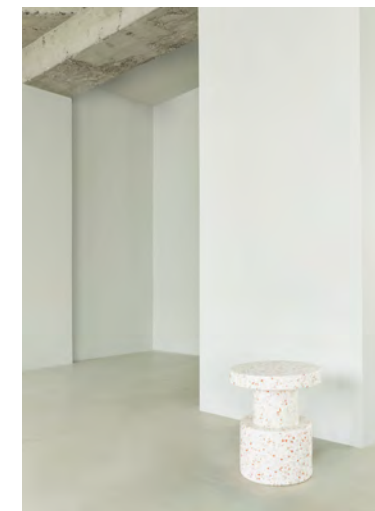
Bit Stool in White