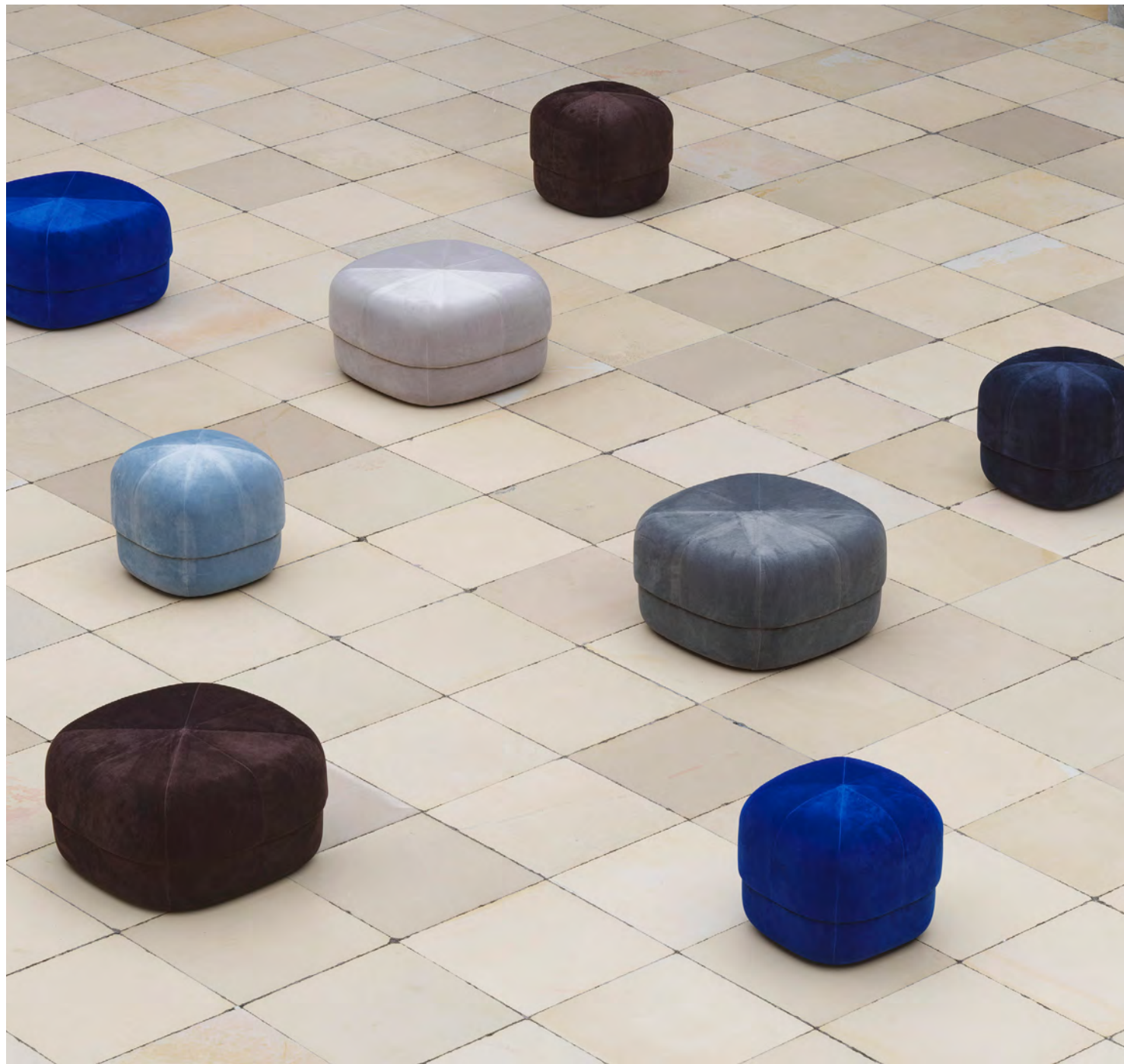
Circus Pouf in various colors and sizes