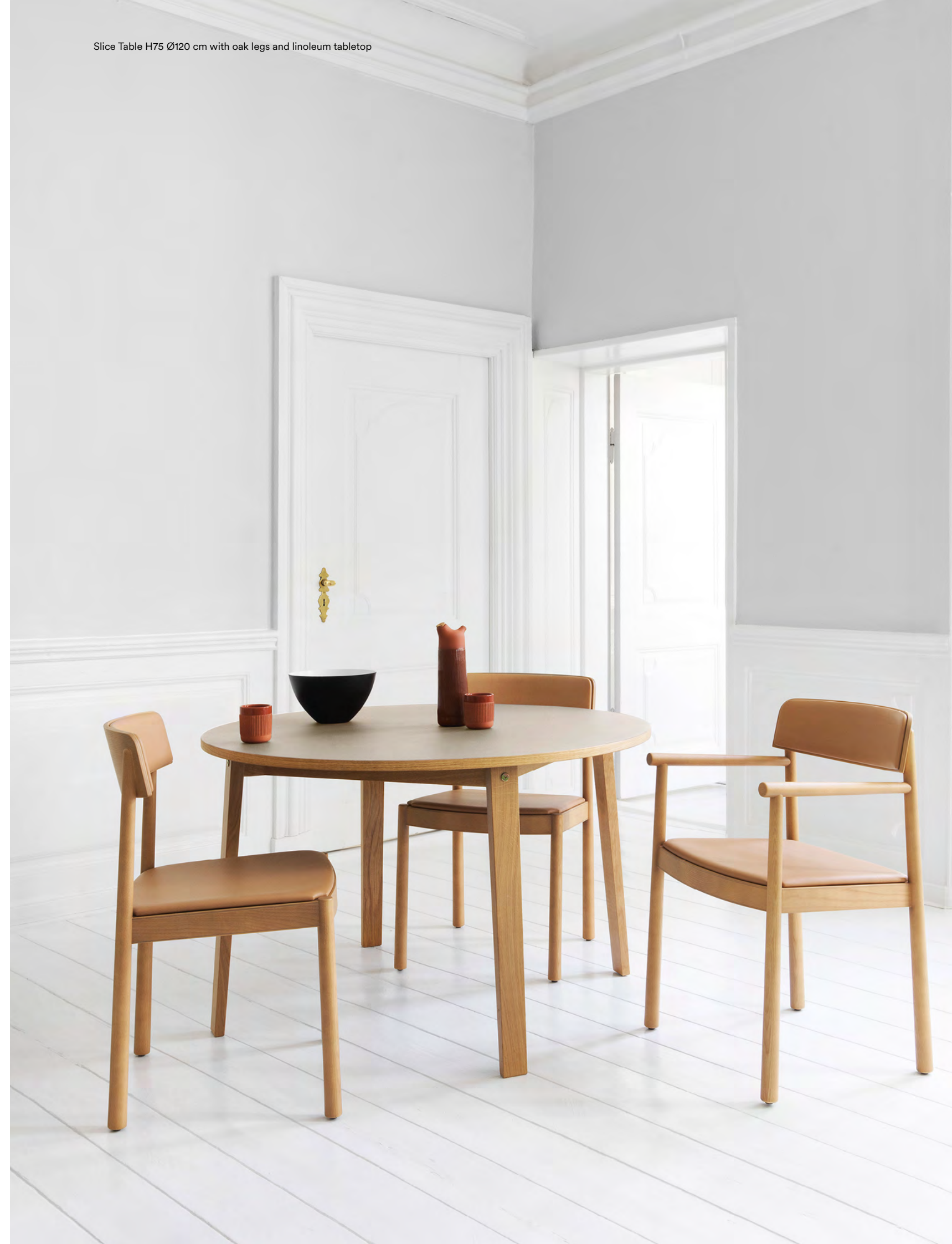
Slice Table H75 Ø120 cm with oak legs and linoleum tabletop