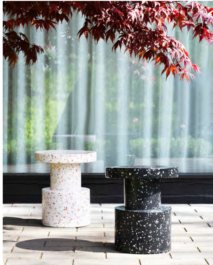
Bit Stool in White and Black