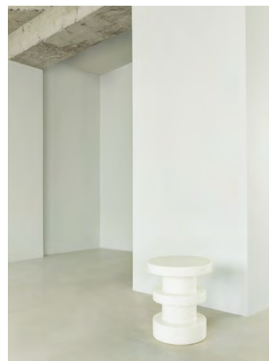
Bit Stool Stack in White/White