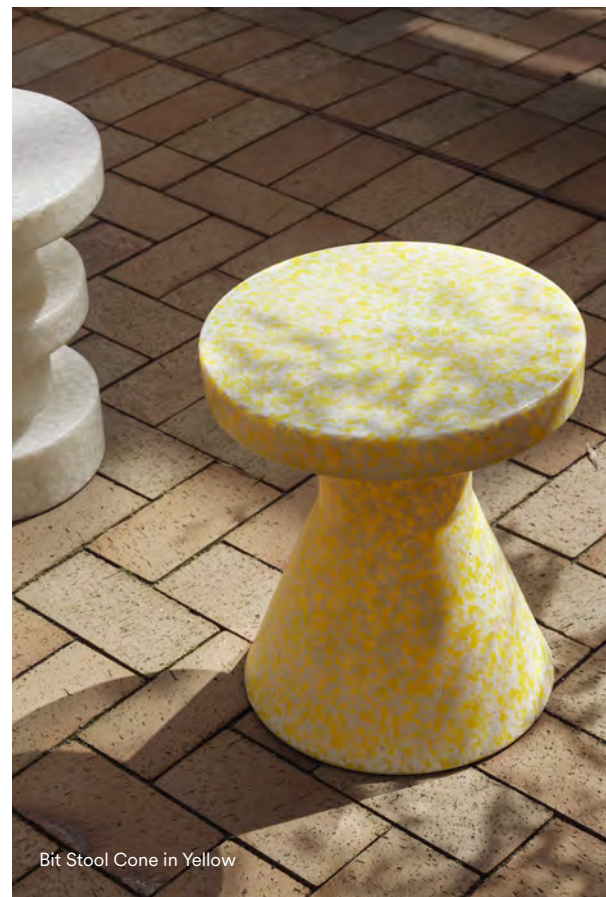
Bit Stool Cone in Yellow

Repurposing plastic waste, the Bit Stool boasts the added bonus of weather-resistant material, making it ideal for both indoor and outdoor settings. The versatile stool, which doubles as a pedestal or side table, withstands temperatures of -10°C to +50°C, making it suitable as a multifunctional piece of furniture for small apartment balcony as well as the grand garden or any other kind of environment outside. With its compact size and a weight of only 4.5 kg, Bit is easy to move around, allowing it to fulfill any need in any setting throughout the day.