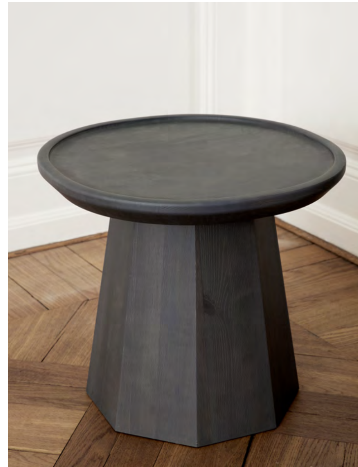
Pine Table Small in Dark Grey