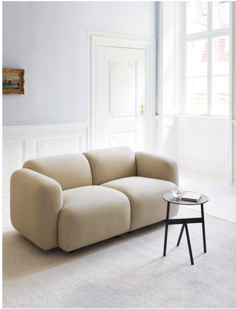
Swell Sofa 2 seater