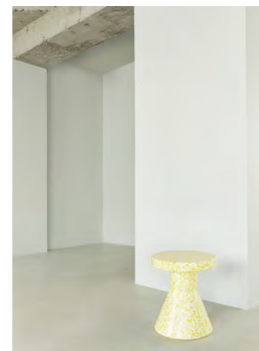
Bit Stool Cone in Yellow