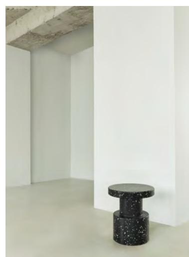
Bit Stool in Black