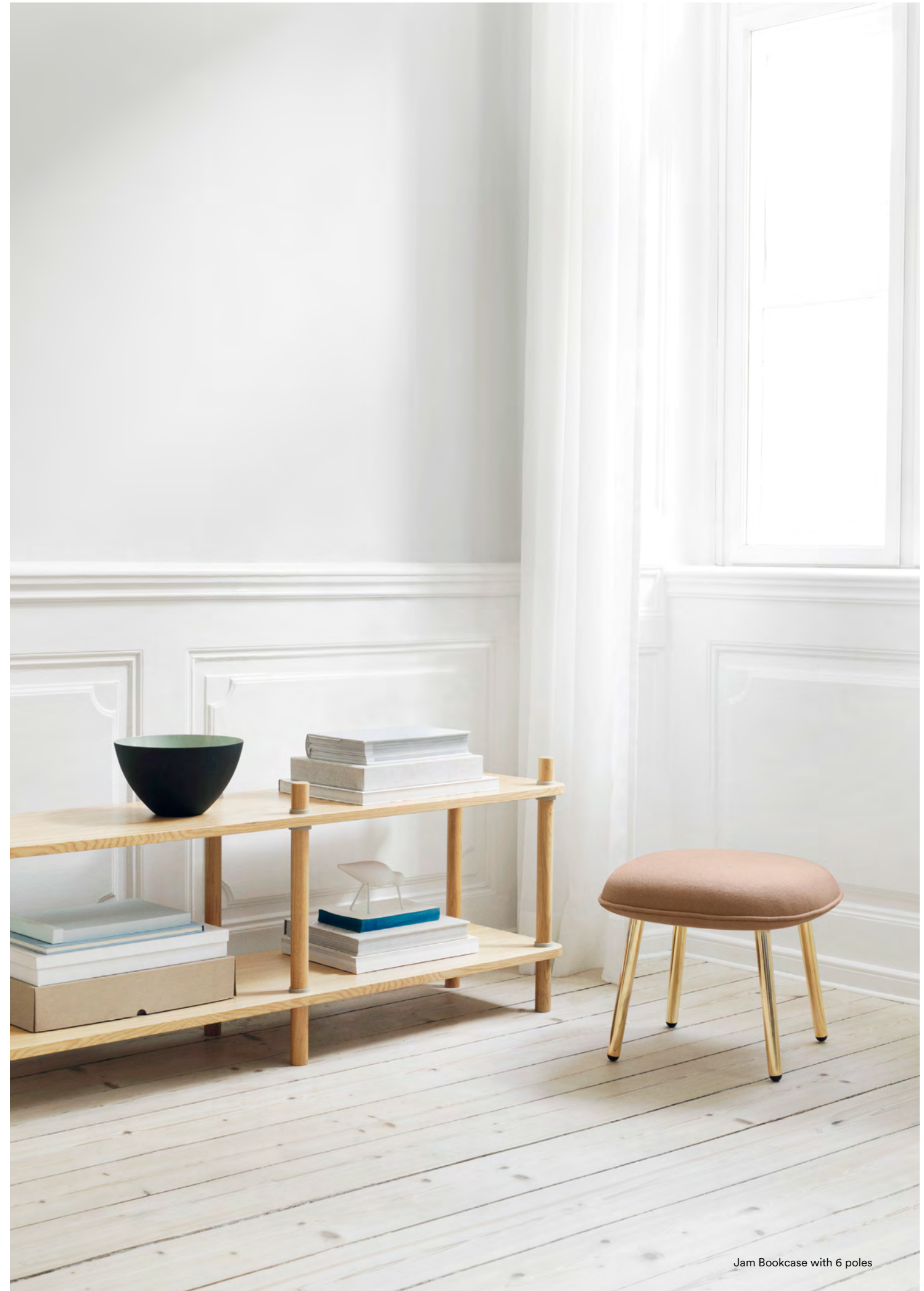
Jam Bookcase with 6 poles