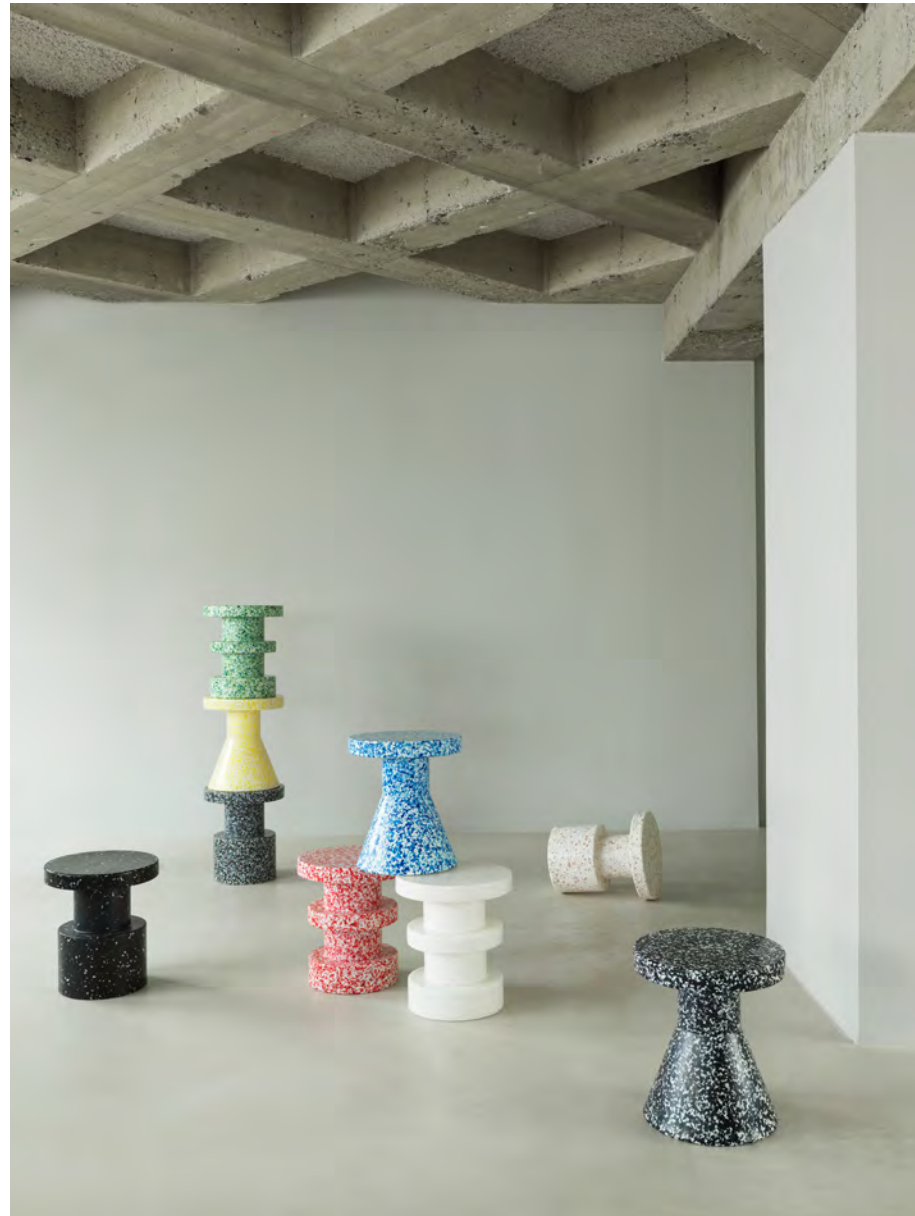
Bit Stool in different variations

Crafted from 100% recycled plastic, Bit Stool is a circular and versatile design with countless possibilities for any space.