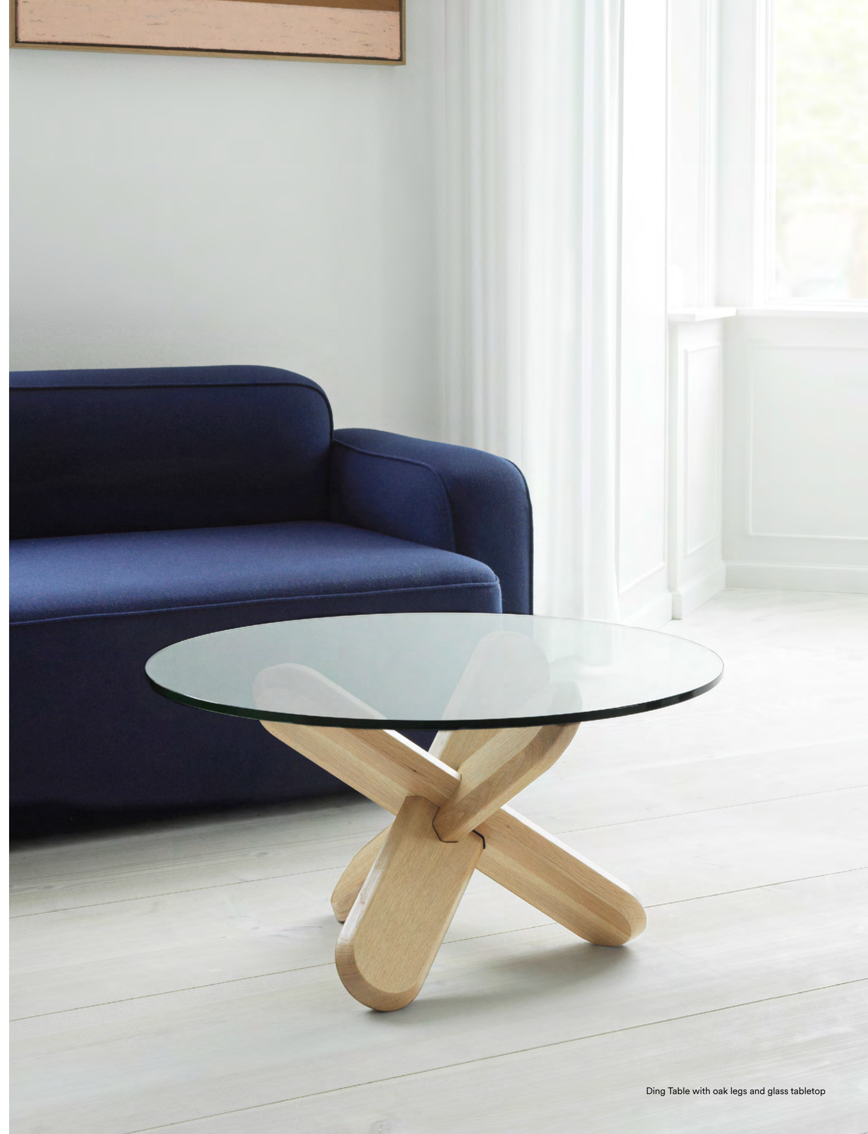
Ding Table with oak legs and glass tabletop