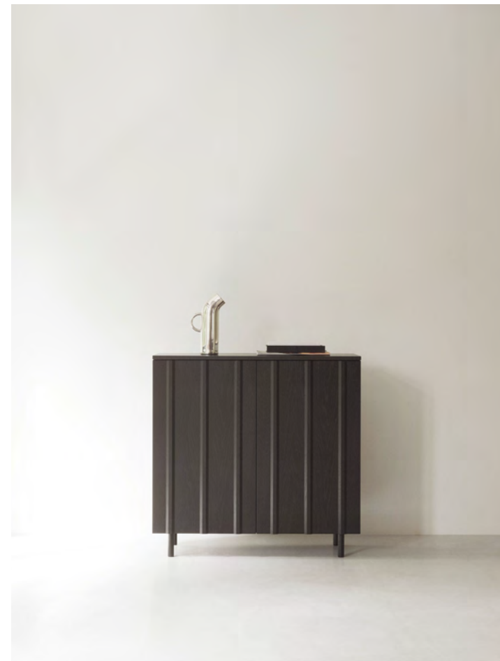
Rib Cabinet in Black oak