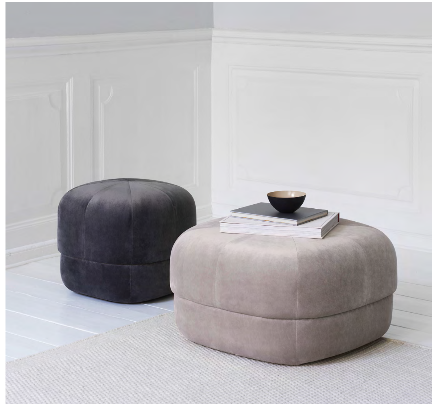
Circus Pouf Small in Grey Circus Pouf Large in Beige