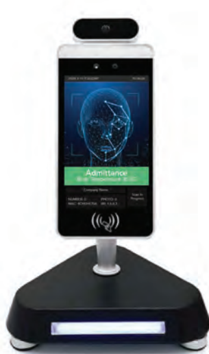
Temperature Scanner Kiosk with Table Stand