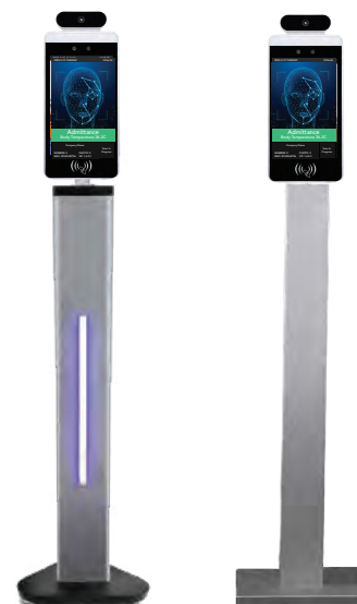
Temperature Scanner Kiosk with Floor Stand

Providing real-time protection and peace of mind for your organization and its customers. Temperature and facial scanners with a \leq .5^{\circ}\text{C} accuracy.