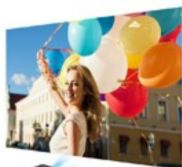
SuperColor™ projectors offer color accuracy levels

ViewSonic's proprietary SuperColor Technology offers a wider color range than conventional DLP projectors for true-to-life color performance in any light. SuperColor™ 6-Segment Color Wheel maximizes brightness Increased by 15% or more with the highest color saturation over others in the same class.