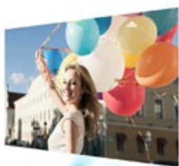
Conventional projectors offer low-quality images