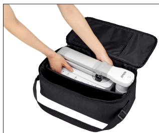
Carrying case included.