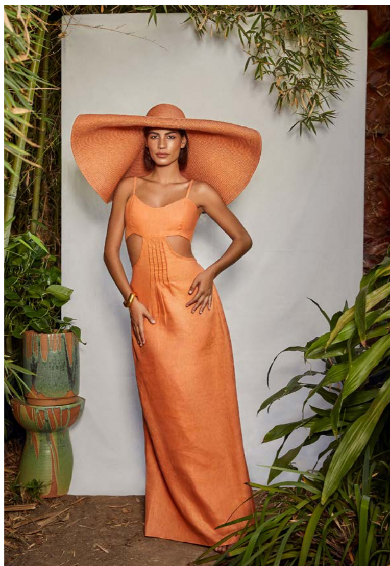
PAPAIŶO X MEILING TRINIDAD & TOBAGO