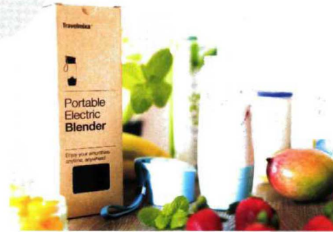
CLOCKWISE / From top left: Magimix 3200 Food Processor, $559; NutriBullet Balance 9 piece set, $329.99; Travelmixa Portable USB Blender in blue, $79; Smeg Blender, Cream, $629.