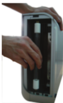
4. Replace UV lamp.