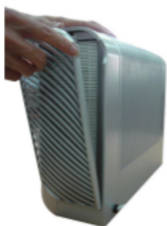
1. Remove the pre-filter grid.

Unit must be unplugged before servicing filter or UV light. UV may be damaging to the eyes.