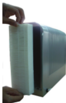
2. Remove the HEPA/charcoal filter.