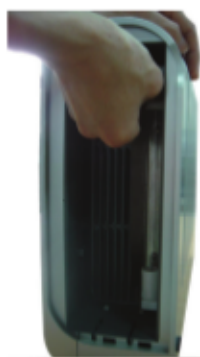
3. Unplug the UV lamp from the photo chamber.