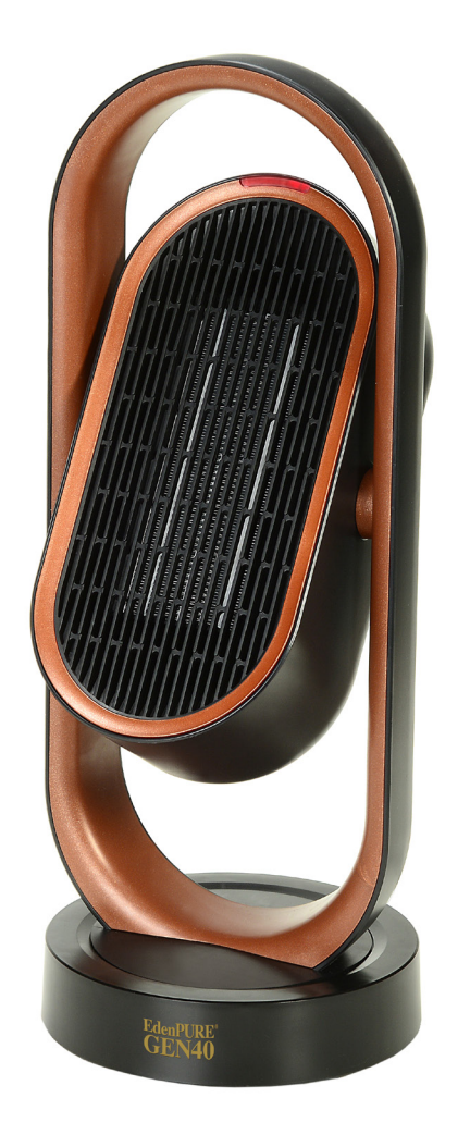
User Manual Please read and save these instructions