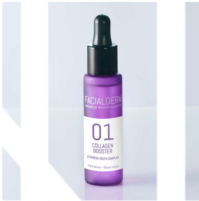
01 Collagen Booster and D-Stress Youth Complex