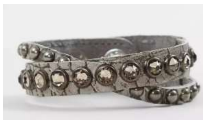
Leatherock Double Strap Leather Bracelet