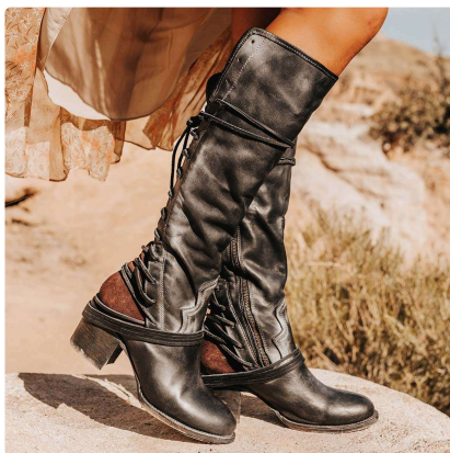
COAL Freebird Boots