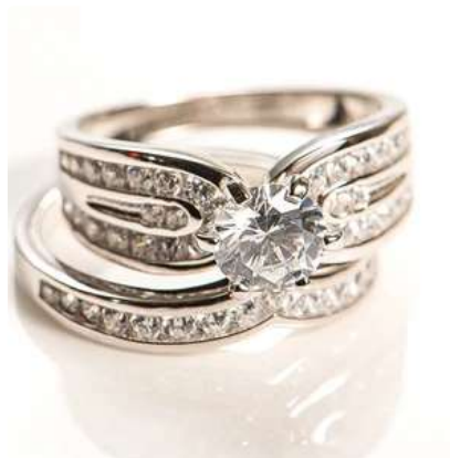
Starlette Galleria 1.5 Carat Round Cut Wedding Set