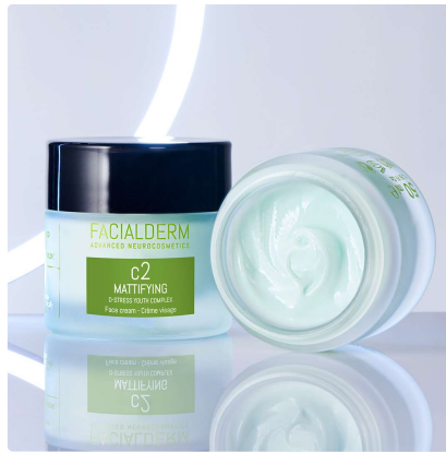
C2 Mattifying and D-Stress Face Cream – Combination-Oily Skin