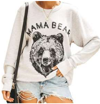
Long Sleeve Top Loose Mama Bear Crewneck Pullover Sweatshirt