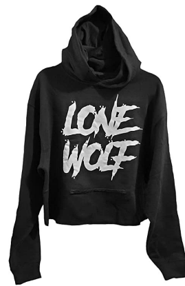
The Drive Clothing – Lone Wolf Crop Hoodie – Road Rash Collection