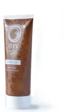
Vainilla Hand Cream from GYV Mesoamerican Beauty: Rich in moisturizing botanicals using our proprietary formula and our signature fragrance Vainilla to leave your hands feeling beautifully soft and smooth.