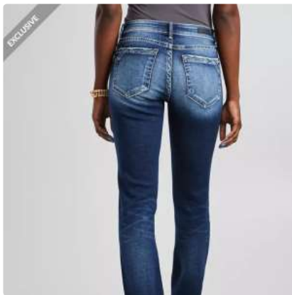
Buckle Black Fit No. 53 Mid-Rise Straight Jean