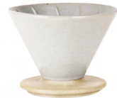
POUR OVER 11.5 / 8.8 / 9.2CM 4.5" / 3.4" / 3.6" 534250