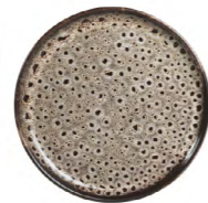
BREAD + BUTTER D19CM / H2CM D7.5" / H1.4" 201602