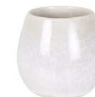
CANVAS LATTE 400ML / H9CM 13.5OZ / H3.5" 302670