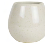
CANVAS LATTE 400ML / H9CM 13.5OZ / H3.5" 302608