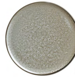
CANVAS DINNER PLATE D28CM / H1.5CM D11" / HO.6" 3018