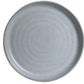
GREY SMOKE DINNER PLATE 26.7CM 10.5" 480150