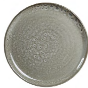
BREAD + BUTTER D19CM / H2CM D7.5" / H1.4" 201683