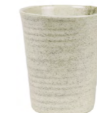
LARGE CUP* 300ML 10.1OZ 102008