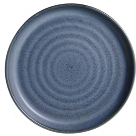
BLUE STORM DINNER PLATE 26.7CM 10.5" 480146