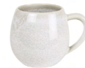
CANVAS MUG 400ML / H9CM 13.5OZ / H3.5" 302770