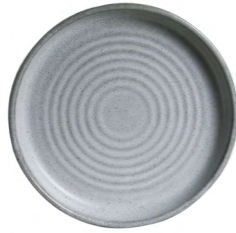
ENTREE PLATE 23.5CM 9.2" 480050