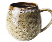
CANVAS MUG 400ML / H9CM 13.5OZ / H3.5" 302702