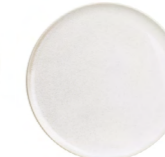
BREAD & BUTTER D16CM / H1.5CM D6.3" / HO.6" 302370