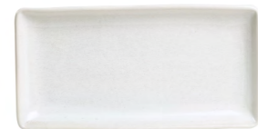
SML TRAY L23CM / W12CM / H2.5CM L9.8" / W4.7" / H1" 126070