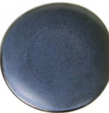
SIDE PLATE 21.5CM 8.5" 530246