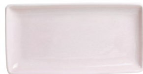
SML TRAY L23CM / W12CM / H2.5CM L9.8" / W4.7" / H1" 1260