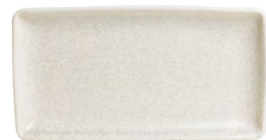
SML TRAY L23CM / W12CM / H2.5CM L9.8" / W4.7" / H1" 126008