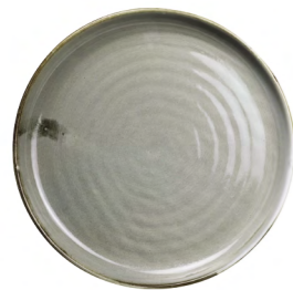
TERRA DINNER PLATE D27.5CM / H2.5CM D10.8" / H1" 201819