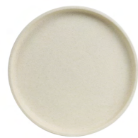
ENTREE PLATE 23CM 9.1" 485552