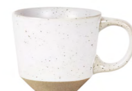
MUG 280ML 9.4OZ 535110