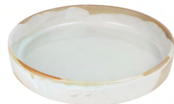
STACK BOWL 21 / 1.6CM 8.5 / 0.6" 471088