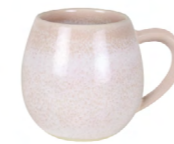
CANVAS MUG 400ML / H9CM 13.5OZ / H3.5" 3027