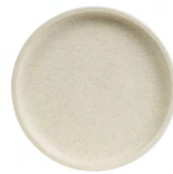
SIDE PLATE 16.5CM 6.5" 485452