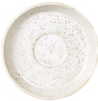
WHITE SPECKLE LGE SAUCER* D14 / H1CM 5.5" / 0.3" 535210