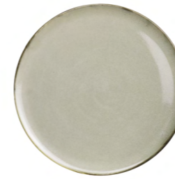
CANVAS DINNER PLATE D28CM / H1.5CM D11" / HO.6" 301819