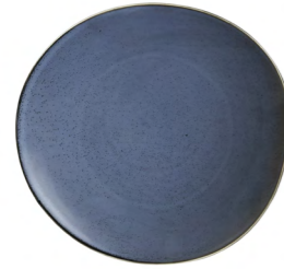
BLUE STORM DINNER PLATE 27.5CM 10.8" 530146