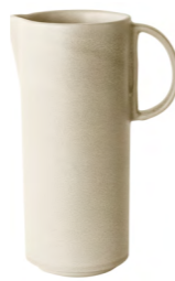
COFFEE JUG 22CM / 1L 8.6" / 33.8" 486052