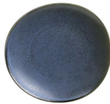
ENTREE PLATE 23CM 9.1" 530046