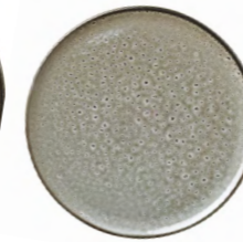
CANVAS ENTREE PLATE D23CM / H1.5CM D9.1" / HO.6" 3021