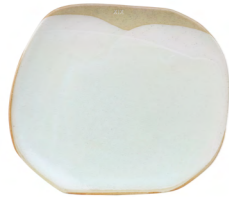
ENTREE PLATE 24 / 19.5 / 2.5CM 9.4 / 7.7 / 1" 470188