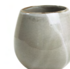
CANVAS LATTE 400ML / H9CM 13.5OZ / H3.5" 302619