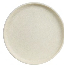
SAND DINNER PLATE 26.5CM 10.4" 485652