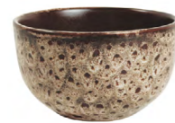
LGE NOODLE BOWL D15CM / H9.5CM D5.9" / H3.7" 316702