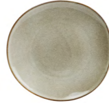
SIDE PLATE 19CM 8.5" 530262