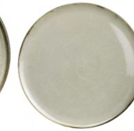
SIDE PLATE D20CM / H1.5CM D7.9" / HO.6" 301919