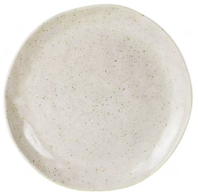
NATURAL DINNER PLATE 27.5CM 10.8" 530186