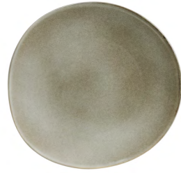
PIER DINNER PLATE 27.5CM 10.8" 530162