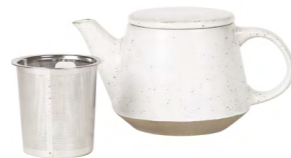
TEAPOT & INFUSER 500ML 16.9OZ 534110