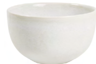
LGE NOODLE BOWL D15CM / H9.5CM D5.9" / H3.7" 316770