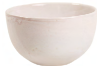
LGE NOODLE BOWL D15CM / H9.5CM D5.9" / H3.7" 3167