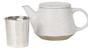
TEAPOT & INFUSER 500ML 16.9OZ 534150