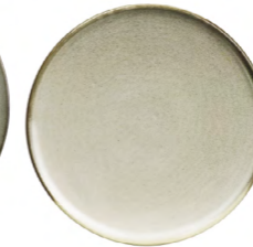
ENTREE PLATE D23CM / H1.5CM D9.1" / HO.6" 302119