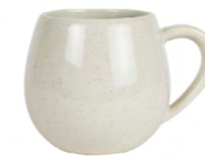
CANVAS MUG 400ML / H9CM 13.5OZ / H3.5" 302708