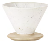
POUR OVER 11.5 / 8.8 / 9.2CM 4.5" / 3.4" / 3.6" 534210