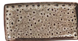
SML TRAY L23CM / W12CM / H2.5CM L9.8" / W4.7" / H1" 126002