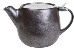
TEAPOT* 500ML 16.9OZ 623423