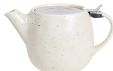
TEAPOT* 500ML 16.9OZ 623486