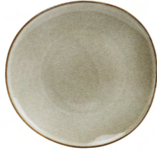
ENTREE PLATE 23CM 9.1" 530062