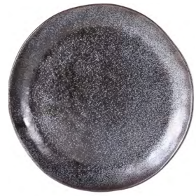
BLACK DINNER PLATE 27.5CM 10.8" 530123