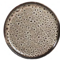
SIDE PLATE D23CM / H2.5CM D9.1" / H1" 201902