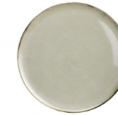
BREAD & BUTTER D16CM / H1.5CM D6.3" / HO.6" 302319