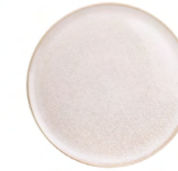
BREAD & BUTTER D16CM / H1.5CM D6.3" / HO.6" 3023