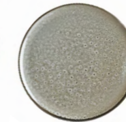
CANVAS SIDE PLATE D20CM / H1.5CM D7.9" / HO.6" 3019