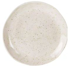
SIDE PLATE 21.5CM 8.5" 530286