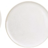
SIDE PLATE D20CM / H1.5CM D7.9" / HO.6" 301970