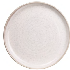
SIDE PLATE D23CM / H2.5CM D9.1" / H1" 2019