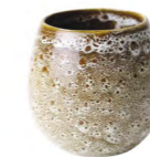
CANVAS LATTE 400ML / H9CM 13.5OZ / H3.5" 302602