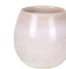
CANVAS LATTE 400ML / H9CM 13.5OZ / H3.5" 3026