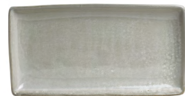
SML TRAY L23CM / W12CM / H2.5CM L9.8" / W4.7" / H1" 126019