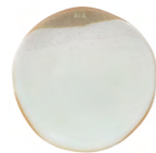
BREAD & BUTTER 13 / 1.5CM 5.1 / 0.6" 470388