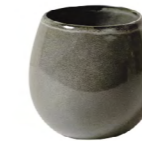
CANVAS LATTE 400ML / H9CM 13.5OZ / H3.5" 302683