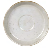
SML SAUCER* D12 / H1CM 4.7" / 0.3" 534650