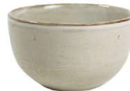
LGE NOODLE BOWL D15CM / H9.5CM D5.9" / H3.7" 316719