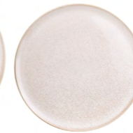
SIDE PLATE D20CM / H1.5CM D7.9" / HO.6" 3019