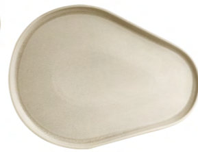
SERVE PLATTER 35.5 / 26 / 2CM 13.9" / 0.7" / 0.7" 486252