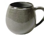
CANVAS MUG 400ML / H9CM 13.5OZ / H3.5" 302783