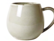
CANVAS MUG 400ML / H9CM 13.5OZ / H3.5" 302719