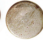
BREAD & BUTTER D16CM / H1.5CM D6.3" / H0.6" 302302