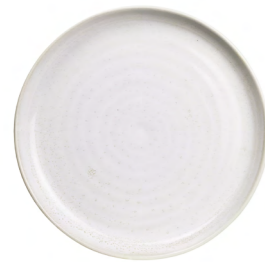
TERRA DINNER PLATE D27.5CM / H2.5CM D10.8" / H1" 201870

Designed in Australia, Made in Melbourne.