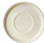
ROUND SAUCER* D15 / 2.3CM D5.9" / 0.9" 485852