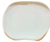
SIDE PLATE 19.5 / 15 / 2CM 7.7 / 5.9 / 0.8" 470288