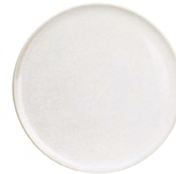
CANVAS DINNER PLATE D28CM / H1.5CM D11" / HO.6" 301870