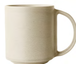
LGE MUG 10CM / 400ML 3.9" / 13.5OZ 485352