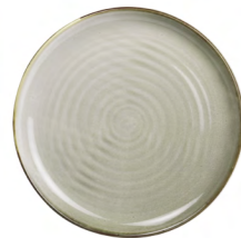
SIDE PLATE D23CM / H2.5CM D9.1" / H1" 201919