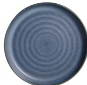
SIDE PLATE 19.1CM 7.5" 480246