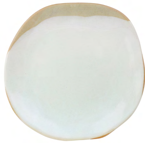
LAGOON DINNER PLATE 29.5 / 3.5CM 11.6 / 1.4" 470088