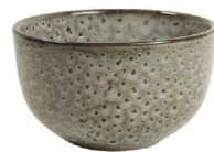
LGE NOODLE BOWL D15CM / H9.5CM D5.9" / H3.7" 316783