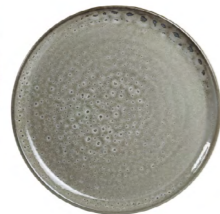
SIDE PLATE D23CM / H2.5CM D9.1" / H1" 201983