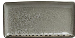
SML TRAY L23CM / W12CM / H2.5CM L9.8" / W4.7" / H1" 126083