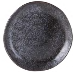
SIDE PLATE 21.5CM 8.5" 530223