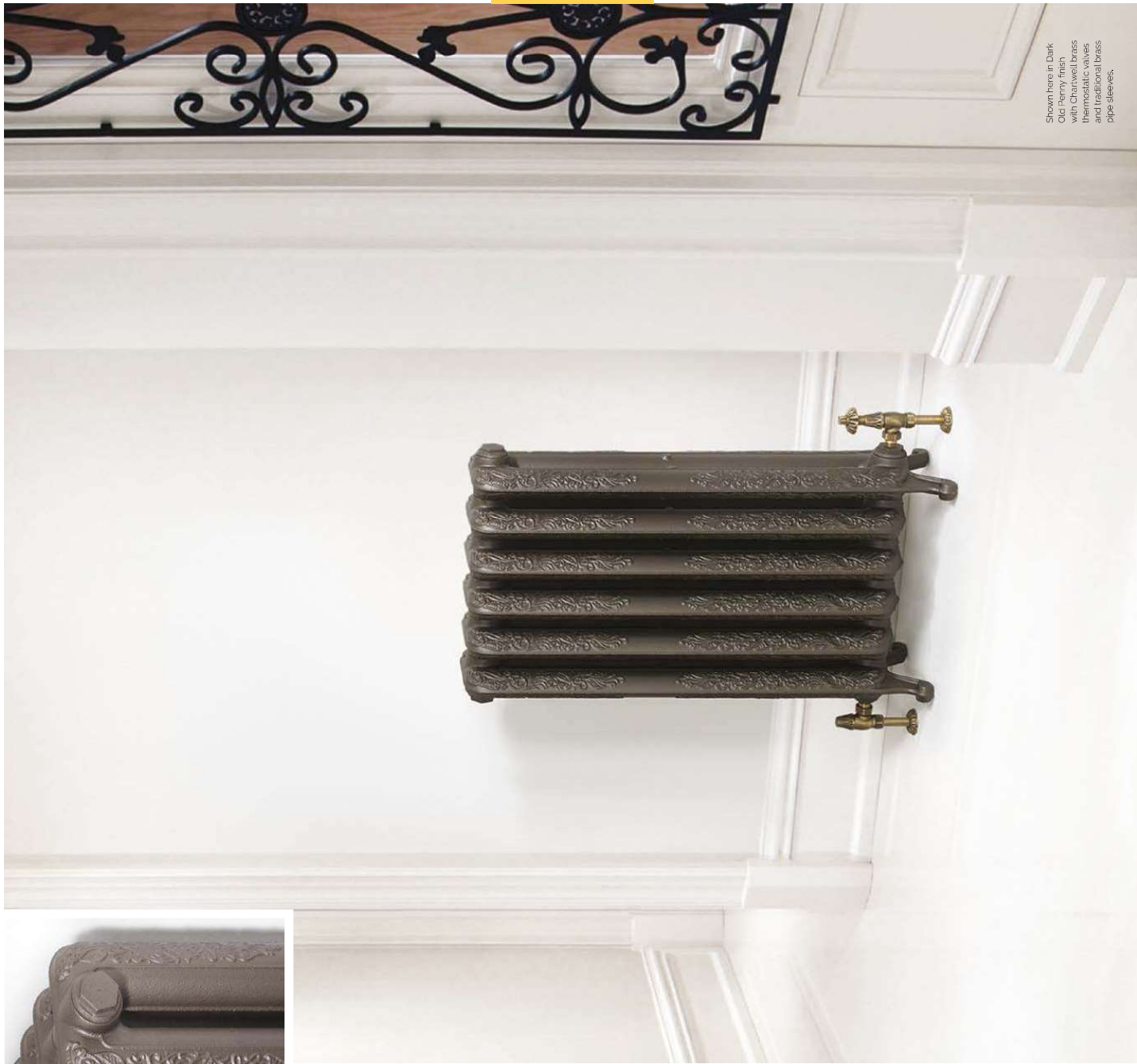
Shown here in Dark Old Cherry finish with Charwell brass thermostatic valves and traditional brass pipe sleeves.