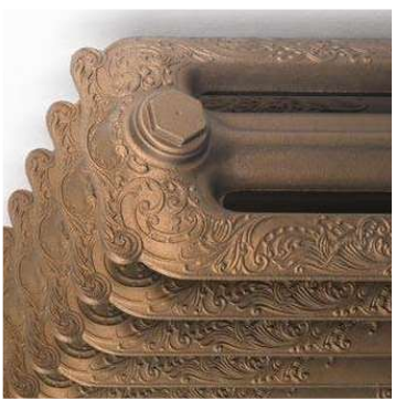
Shown here in Light Old Penny finish with Nostalgia brass thermostatic valves and traditional brass pipe sleeves.