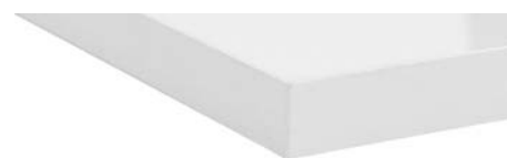
1mm Matching Edge

Designed for a sleek, modern and minimalistic look creating clean flowing lines.