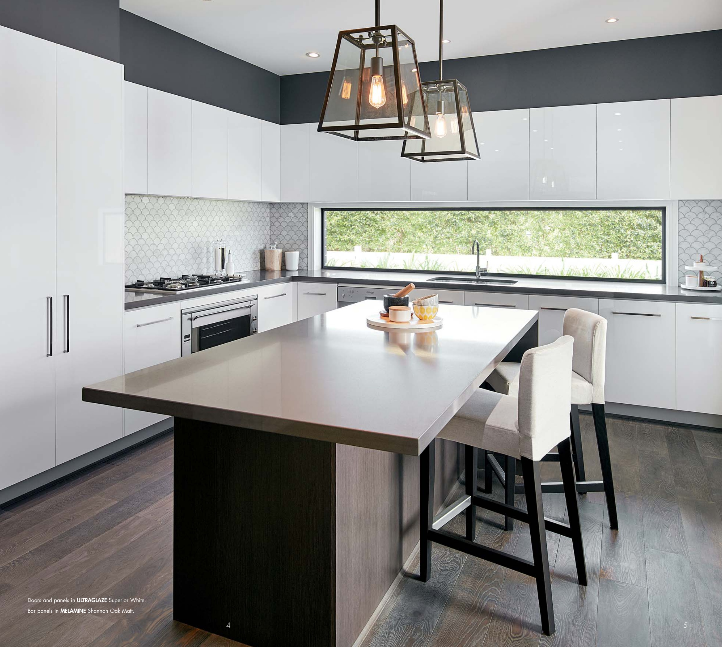
Doors and panels in ULTRAGLAZE Superior White. Bar panels in MELAMINE Shannon Oak Matt.