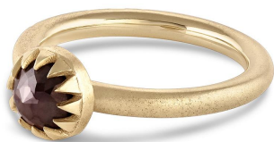
*Peristome Diamond Ring 6mm rose cut rustic diamond ~1ct

R-18Y-PERI $1,291 WS | $2,840 MSRP Please specify green or brown.