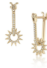
Pavé Baby Spur Earring 10mm latch | black or white diamonds

E-18Y-P-MSPR-WHT $1,156 WS | $2,545 MSRP