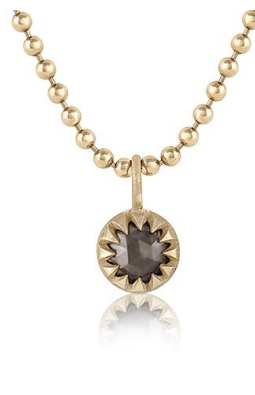
*Peristome Diamond Pendant 8mm | 6mm rose cut rustic diamond ~1ct

P-18Y-SPR-PERI $951 WS | $2,090 MSRP Please specify green or brown.