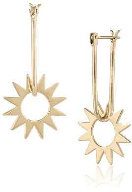
Spur Earring 23mm latch