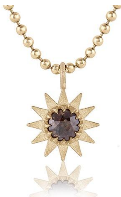
*Spur Peristome Diamond Pendant 15mm | 6mm rose cut rustic diamond ~1ct

P-18Y-SPR-INV-BLK $214 WS | $470 MSRP P-18Y-SPR-INV-WHT $367 WS | $805 MSRP