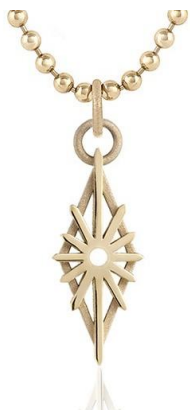
Rhombus Pendant 24mm