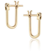
Huggie Latch Earring 10mm