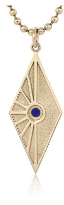
Evil Eye Pendant 33mm height, 15mm width | lapis lazuli center

P-18Y-RHO-BLK $338 WS | $745 MSRP P-18Y-RHO-WHT $347 WS | $760 MSRP