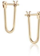
Half Latch Earring 15mm