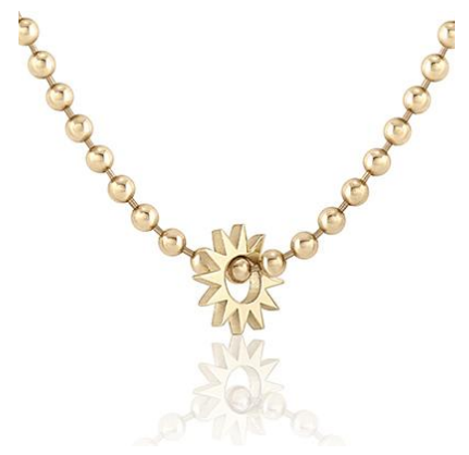
Baby Spur Pendant 8mm diameter