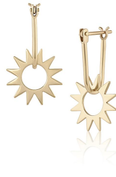
Mini Spur Earring 15mm latch