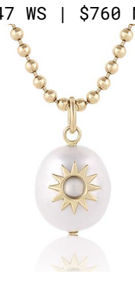
Pearl Spur Pendant ~15mm, size will vary