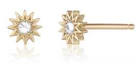
Inverted Diamond Mini Spur Stud 5mm | black or white brilliant cut diamond 0.03ctw

E-18Y-SPRSTD-INVT-BLK $206 WS | $455 MSRP E-18Y-SPRSTD-INVT-WHT $359 WS | $790 MSRP