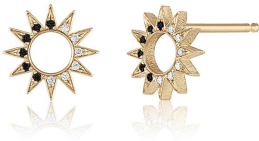
Chiaroscuro Pavé Spur Stud 8mm diameter | white and black diamonds

E-18Y-P-SPRSTD-WHT-BLK $213 WS | $470 MSRP