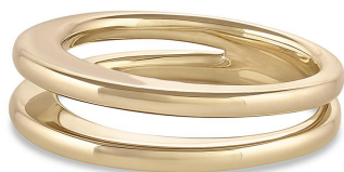
Twin Crescent Ring

R-18Y-NOVA-BLK $798 WS | $1,755 MSRP R-18Y-NOVA-WHT $806 WS | $1,775 MSRP