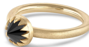
*Peristome Inverted Diamond Ring 6mm brilliant cut black diamond ~1ct

R-18Y-SPR-PERI $1,410 WS | $3,105 MSRP Please specify green or brown.