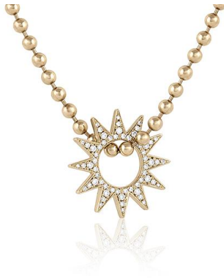
Pavé Mini Spur Pendant 16mm diameter | black or white diamonds

P-18Y-P-SPR-BLK $935 WS | $2,060 MSRP P-18Y-P-SPR-WHT $1,086 WS | $2,390 MSRP