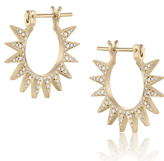
Pavé Spur Hoop 11mm inner diameter | black or white diamonds