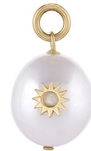
Pearl Mini Spur Earring Charm ~15mm, size will vary

EC-18Y-RHO-BLK $318 WS | $700 MSRP EC-18Y-RHO-WHT $326 WS | $720 MSRP