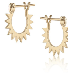
Baby Spur Hoop 8mm inner diameter