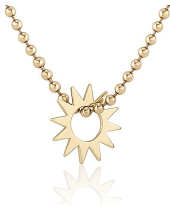
Mini Spur Pendant 15mm diameter