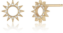
Pavé Spur Stud 8mm | black or white diamonds

E-18Y-P-SPRSTD-BLK $205 WS | $450 MSRP E-18Y-P-SPRSTD-WHT $222 WS | $490 MSRP