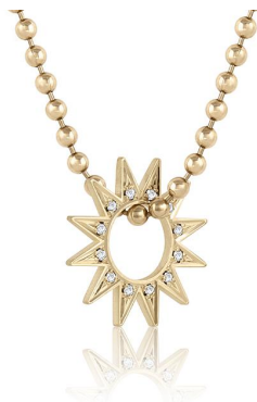
Eclipse Pavé Mini Spur Pendant 16mm diameter | black or white diamonds

P-18Y-P-BBSPR-BLK $192 WS | $420 MSRP P-18Y-P-BBSPR-WHT $209 WS | $460 MSRP