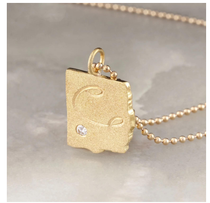
Custom Tablet Pendant ~12mm height, 11mm width | white brilliant cut diamond 0.02ctw