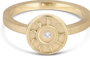
Ennead Ring black or white brilliant cut diamond 0.02ctw

R-18Y-STR-BLK $673 WS | $1,480 MSRP R-18Y-STR-WHT $681 WS | $1,500 MSRP