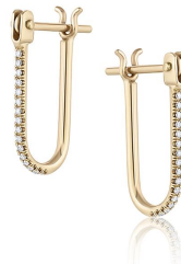
Pavé Half Latch Earring 15mm | black or white diamonds