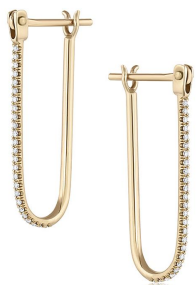
Pavé Latch Earring 23mm | black or white diamonds