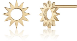
Spur Stud 8mm

E-18Y-P-SPRSTD-BLK $205 WS | $450 MSRP E-18Y-P-SPRSTD-WHT $222 WS | $490 MSRP