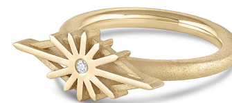
Supernova Ring black or white brilliant cut diamond 0.02ctw

R-18Y-CRES-BLK $607 WS | $1,335 MSRP R-18Y-CRES-WHT $666 WS | $1,465 MSRP