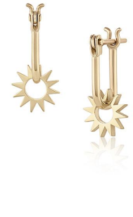
Baby Spur Earring 10mm latch