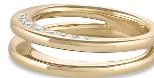
Twin Crescent Diamond Ring black or white brilliant cut diamonds 0.21ctw

R-18Y-TWNCRES-BLK $1,261 WS | $2,775 MSRP R-18Y-TWNCRES-WHT $1,379 WS | $3,035 MSRP