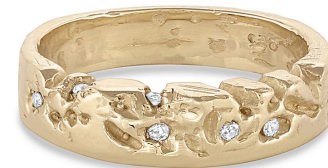
Erosion Diamond Ring