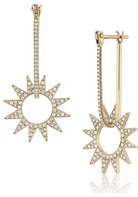
Pavé Spur Earring 23mm latch | black or white diamonds