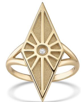
Rhombus Ring white brilliant cut diamond 0.02ctw

R-18Y-P-SQR-BLK $561 WS | $1,235 MSRP R-18Y-P-SQR-WHT $659 WS | $1,450 MSRP