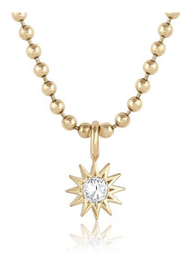
Inverted Diamond Spur Pendant 8mm | black or white brilliant cut diamond 0.17ctw

P-18Y-SPR-INV-BLK $214 WS | $470 MSRP P-18Y-SPR-INV-WHT $367 WS | $805 MSRP