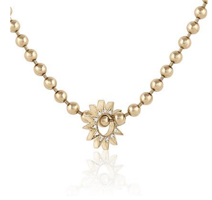
Pavé Baby Spur Pendant 8mm diameter | black or white diamonds

P-18Y-P-MSPR-BLK $758 WS | $1,670 MSRP P-18Y-P-MSPR-WHT $857 WS | $1,885 MSRP