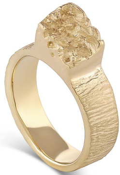
Ice Cap Ring