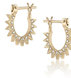
Pavé Baby Spur Hoop 8mm inner diameter | black or white diamonds