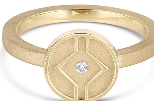
Choice Ring black or white brilliant cut diamond 0.02ctw

R-18Y-COM-BLK $673 WS | $1,480 MSRP R-18Y-COM-WHT $681 WS | $1,500 MSRP