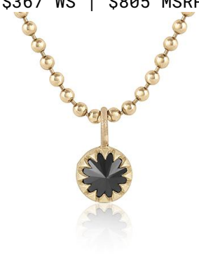
*Peristome Inverted Diamond Pendant 8mm | 6mm brilliant cut black diamond ~1ct

P-18Y-PERI $826 WS | $1,815 MSRP Please specify green or brown.