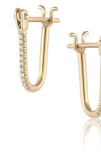
Pavé Huggie Latch Earring 10mm | black or white diamonds