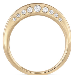
Crescent Diamond Ring black or white brilliant cut diamonds 0.10ctw

R-18Y-CRES-BLK $607 WS | $1,335 MSRP R-18Y-CRES-WHT $666 WS | $1,465 MSRP