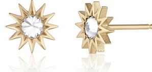
Inverted Diamond Spur Stud 8mm | black or white brilliant cut diamond 0.17ctw

E-18Y-P-SPRSTD-WHT-BLK $213 WS | $470 MSRP