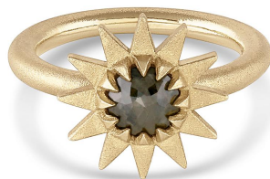
*Spur Peristome Diamond Ring 6mm rose cut rustic diamond ~1ct

R-18Y-PERI $1,291 WS | $2,840 MSRP Please specify green or brown.