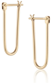
Latch Earring 23mm