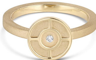
Compass Ring black or white brilliant cut diamond 0.02ctw

R-18Y-COS-BLK $673 WS | $1,480 MSRP R-18Y-COS-WHT $681 WS | $1,500 MSRP