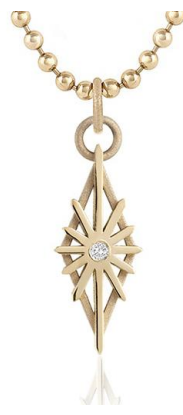
Rhombus Diamond Pendant 24mm | black or white brilliant cut diamond 0.02ctw

P-18Y-RHO-BLK $338 WS | $745 MSRP P-18Y-RHO-WHT $347 WS | $760 MSRP