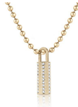
*Urn Pendant 8mm diameter | black or white diamonds