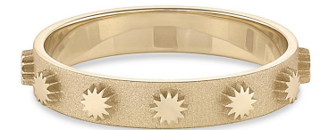
Spur Half Cigar Band 4mm

R-18Y-CHOICE-BLK $673 WS | $1,480 MSRP R-18Y-CHOICE-WHT $681 WS | $1,500 MSRP