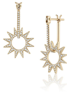
Pavé Mini Spur Earring 15mm latch | black or white diamonds

E-18Y-P-MSPR-BLK $1,006 WS | $2,280 MSRP