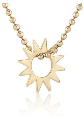
Spur Pendant 18mm diameter