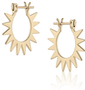
Spur Hoop 11mm inner diameter