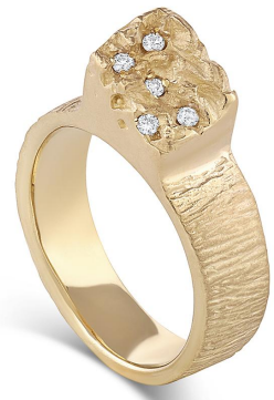
Ice Cap Diamond Ring