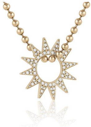
Pavé Spur Pendant 20mm diameter | black or white diamonds

P-18Y-P-SPR-BLK $935 WS | $2,060 MSRP P-18Y-P-SPR-WHT $1,086 WS | $2,390 MSRP