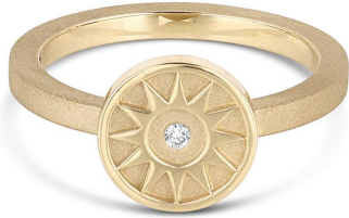
Star Ring black or white brilliant cut diamond 0.02ctw

R-18Y-STR-BLK $673 WS | $1,480 MSRP R-18Y-STR-WHT $681 WS | $1,500 MSRP