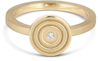
Cosmos Ring black or white brilliant cut diamond 0.02ctw

R-18Y-ENN-BLK $673 WS | $1,480 MSRP R-18Y-ENN-WHT $681 WS | $1,500 MSRP