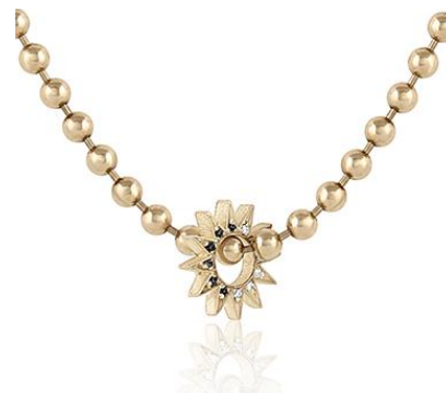
Chiaroscuro Pavé Baby Spur Pendant 8mm diameter | white and black diamonds

P-18Y-P-ECL-MSPR-BLK $373 WS | $820 MSRP P-18Y-P-ECL-MSPR-WHT $400 WS | $880 MSRP