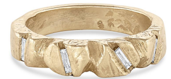
Nugget Diamond Ring