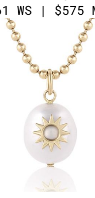
Pearl Spur Pendant ~15mm, size will vary