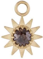
*Spur Peristome Diamond Earring Charm 15mm | 6mm rose cut rustic diamond ~1ct

EC-14Y-SPR-PERI $877 WS | $1,930 MSRP Please specify green or brown.