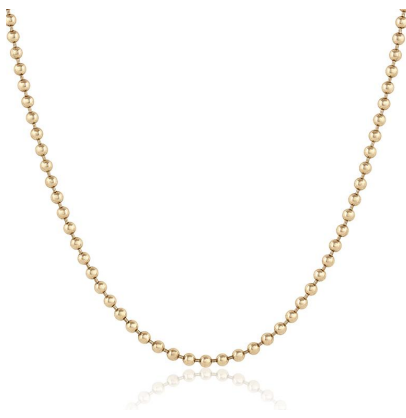
Ball Chain 2mm