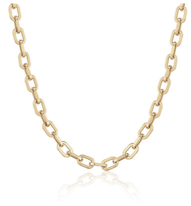
Chain Link Necklace 5.2mm cable chain