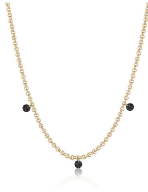
Triple Floating Black Diamond Necklace 16" | 1.4mm rolo chain black brilliant cut diamonds 0.45ctw