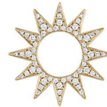
Pavé Mini Spur Pin 16mm diameter | black or white diamonds gold plated butterfly back

PIN-14Y-P-SPR-BLK $863 WS | $1,900 MSRP PIN-14Y-P-SPR-WHT $1013 WS | $2,230 MSRP