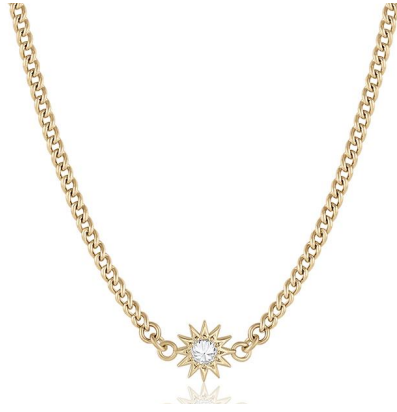
Baby Spur Chain Diamond Necklace curb chain | black or white brilliant cut diamond 0.17ctw