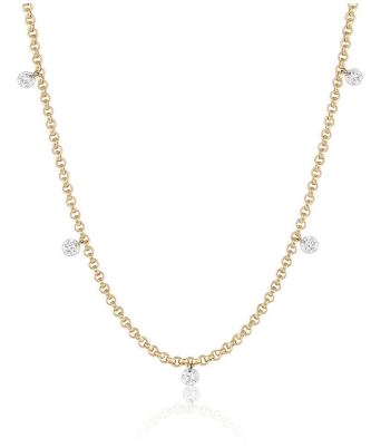
Floating Diamond Necklace 16" | 1.4mm rolo chain white brilliant cut diamonds 0.7ctw

N-14Y-FLT3-RC-WHT $1,073 WS | $2,360 MSRP