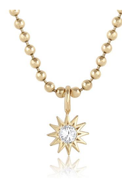
Inverted Diamond Spur Pendant 8mm | black or white brilliant cut diamond 0.17ctw

P-14Y-SPR-INV-BLK $193 WS | $425 MSRP P-14Y-SPR-INV-WHT $346 WS | $760 MSRP