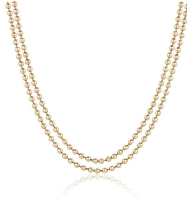
Double Ball Chain 16" | 2mm