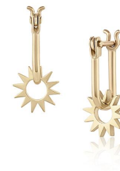
Baby Spur Earring 10mm latch