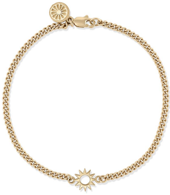
Baby Spur Chain Bracelet 7" | curb chain