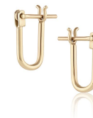
Huggie Latch Earring 10mm