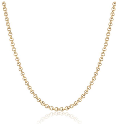
Rolo Chain 2mm

14k yellow gold | sterling silver C-14Y-SS-BC-48 $742 WS | $1,630 MSRP