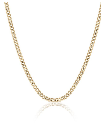
Curb Chain 2.3mm