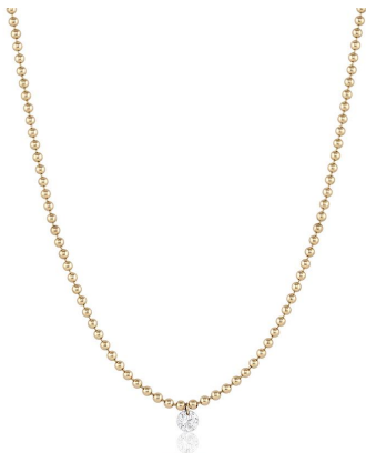
Single Floating Diamond Necklace 16" | 1.5mm ball chain white brilliant cut diamond 0.14ctw