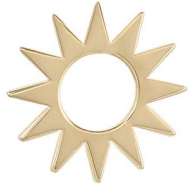
Spur Pin 18mm diameter | gold plated butterfly back