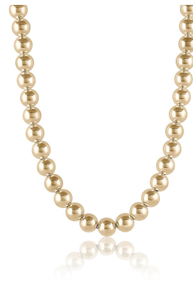
Jumbo Ball Necklace 15" | 7mm ball beads