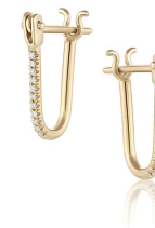
Pavé Huggie Latch Earring 10mm | black or white diamonds

E-14Y-P-HLAT-BLK $256 WS | $565 MSRP E-14Y-P-HLAT-WHT $279 WS | $615 MSRP