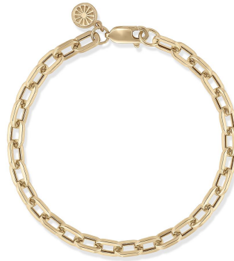
Chain Link Bracelet 7" | 5.2mm cable chain