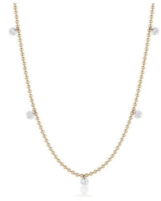
Floating Diamond Necklace 16" | 1.5mm ball chain white brilliant cut diamonds 0.7ctw