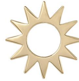
Mini Spur Pin 15mm diameter | gold plated butterfly back