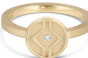
Choice Ring black or white brilliant cut diamond 0.02ctw

R-14Y-COM-BLK $496 WS | $1,090 MSRP R-14Y-COM-WHT $504 WS | $1,110 MSRP