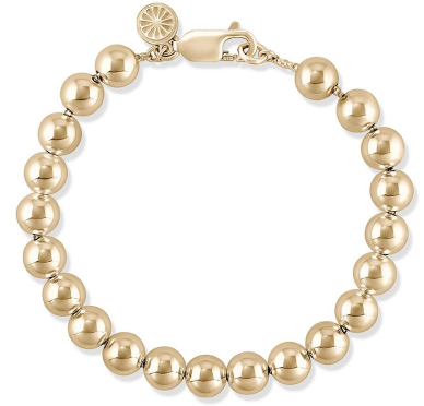
Jumbo Ball Bracelet 7" | 7mm ball beads