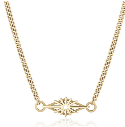
Supernova Necklace curb chain | no diamond