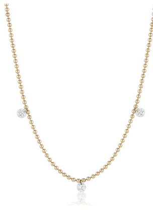
Triple Floating Diamond Necklace 16" | 1.5mm ball chain white brilliant cut diamonds 0.42ctw