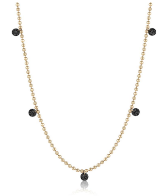
Floating Black Diamond Necklace 16" | 1.5mm ball chain black brilliant cut diamonds 0.75ctw