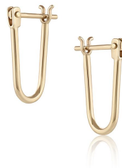
Half Latch Earring 15mm