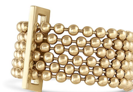
Ball Chain Ring available with pavé white diamonds on face

R-14Y-TWNCRES-BLK $967 WS | $2,125 MSRP R-14Y-TWNCRES-WHT $1,085 WS | $2,385 MSRP