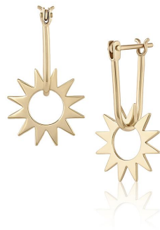
Mini Spur Earring 15mm latch