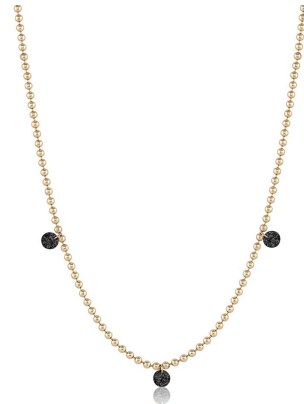
Triple Floating Black Diamond Necklace 16" | 1.5mm ball chain black brilliant cut diamonds 0.45ctw