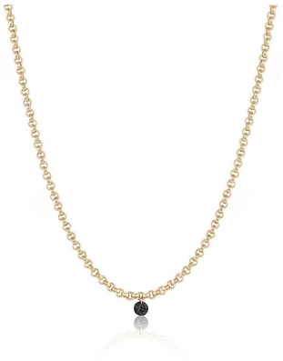
Single Floating Black Diamond Necklace 16" | 1.4mm rolo chain black brilliant cut diamond 0.15ctw

N-14Y-FLT5-RC-WHT $1,600 WS | $3,520 MSRP