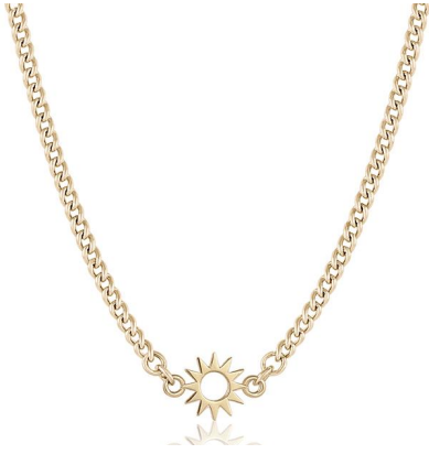
Baby Spur Chain Necklace curb chain