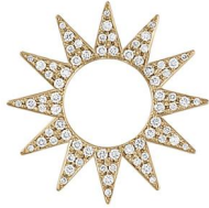
Pavé Spur Pin 20mm diameter | black or white diamonds gold plated butterfly back

PIN-14Y-P-SPR-BLK $863 WS | $1,900 MSRP PIN-14Y-P-SPR-WHT $1013 WS | $2,230 MSRP