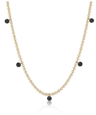
Floating Black Diamond Necklace 16" | 1.4mm rolo chain black brilliant cut diamonds 0.75ctw