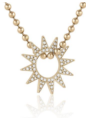
Pavé Spur Pendant 20mm diameter | black or white diamonds

P-14Y-P-SPR-BLK $853 WS | $1,875 MSRP P-14Y-P-SPR-WHT $1,003 WS | $2,210 MSRP