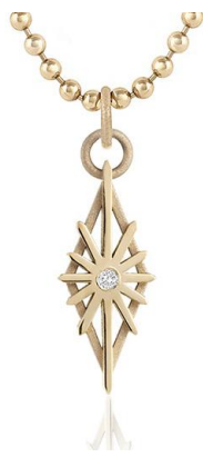
Rhombus Diamond Pendant 24mm | black or white brilliant cut diamond 0.02ctw

P-14Y-RHO-BLK $253 WS | $555 MSRP P-14Y-RHO-WHT $261 WS | $575 MSRP