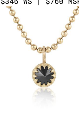
*Peristome Inverted Diamond Pendant 8mm | 6mm brilliant cut black diamond ~1ct

P-14Y-PERI $795 WS | $1,750 MSRP Please specify green or brown.