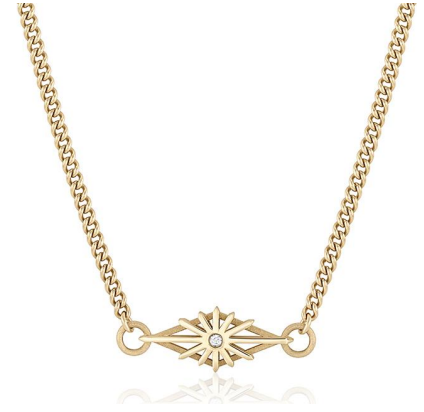
Supernova Diamond Necklace curb chain | black or white brilliant cut diamond 0.02ctw