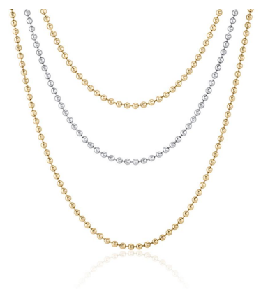
Two Tone Ball Chain 48" | 2mm

14k yellow gold | 14k white gold C-14YW-BC-48 $1,383 WS | $3,045 MSRP