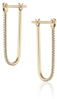
Pavé Latch Earring 23mm | black or white diamonds

E-14Y-P-BBSPR-BLK $357 WS | $815 MSRP E-14Y-P-BBSPR-WHT $403 WS | $885 MSRP