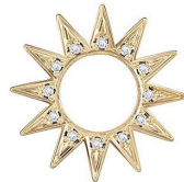
Eclipse Pavé Mini Spur Pin 16mm diameter | black or white diamonds gold plated butterfly back

PIN-14Y-P-BBSPR-BLK $187 WS | $410 MSRP PIN-14Y-P-BBSPR-WHT $204 WS | $450 MSRP