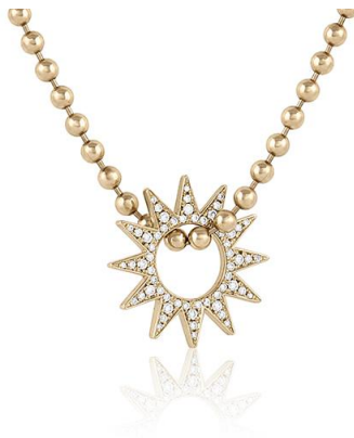
Pavé Mini Spur Pendant 16mm diameter | black or white diamonds

P-14Y-P-SPR-BLK $853 WS | $1,875 MSRP P-14Y-P-SPR-WHT $1,003 WS | $2,210 MSRP