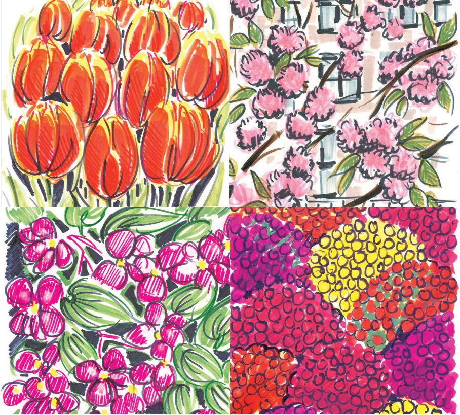
CLAIRE WARD ILLUSTRATIONS

The seasonal plantings on the Park Avenue Malls are a source of joy for both New Yorkers and visitors alike. The Fund for Park Avenue, founded in 1980 as one of the city's first public-private partnerships, is the proud steward of this iconic stretch of parkland between 54th and 86th Streets.