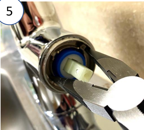
Remove retaining nut in a counter clockwise direction