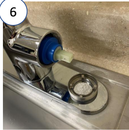
Remove cartridge. Clean area before installing new cartridge.