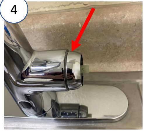
Remove handle. Remove collar by twisting it in a counter clockwise direction.