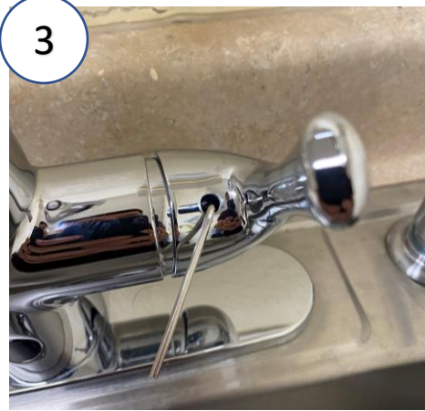
Use a 2.5mm allen wrench to loosen the screw. (Counter clockwise)