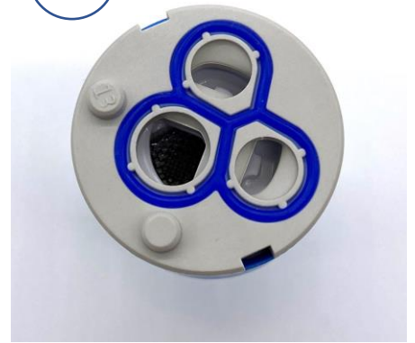
Align holes on cartridge with holes on the faucet. Install replacement parts in reverse order.