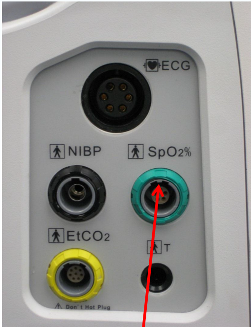
Digital SpO2 Monitors - 2 Keyway Guides; 5 pin connector