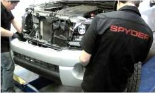
29) Seat the front bumper fascia. Be sure to reconnect the foglight harnesses, if equipped.