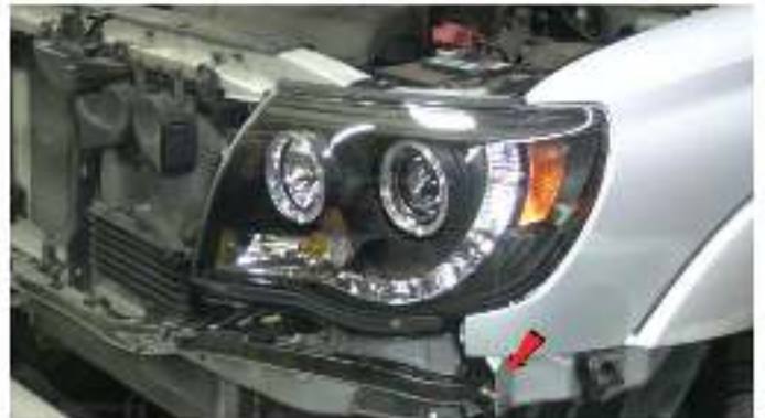
26) Reinstall [1x] 10mm bolt to secure the headlight.