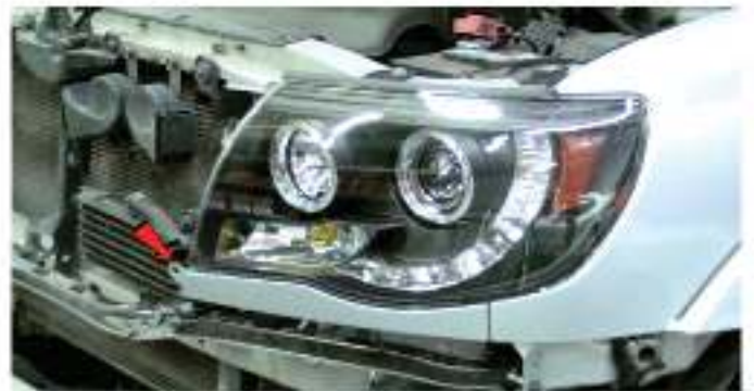
28) Reinstall [1x] plastic retainer to secure the garnish.