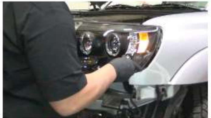
24) Seat the Spyder headlight, being sure to properly seat the headlight retainer tabs.