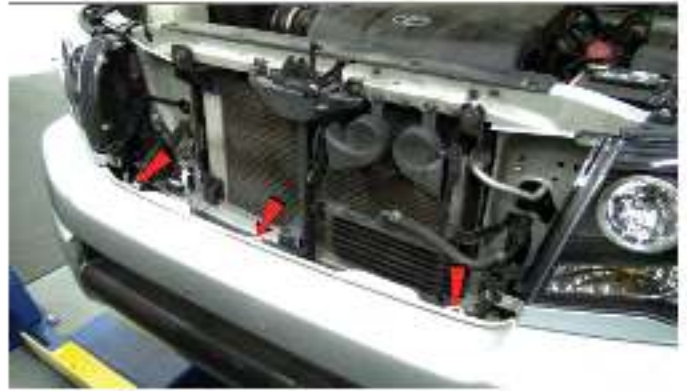
30) Reinstall [3x] plastic retainers to secure the fascia.