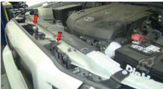
33) Reinstall [2x] phillips screws to secure the grille.