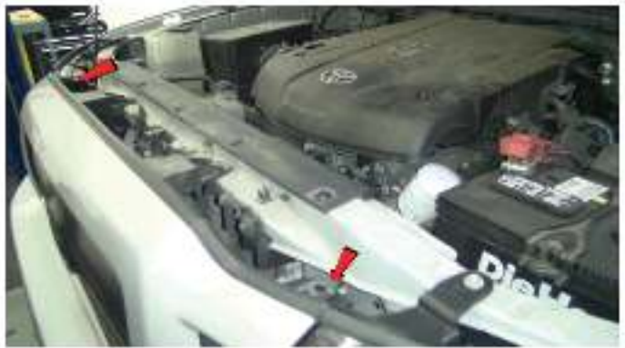
32) Reinstall [2x] plastic retainers to secure the grille.