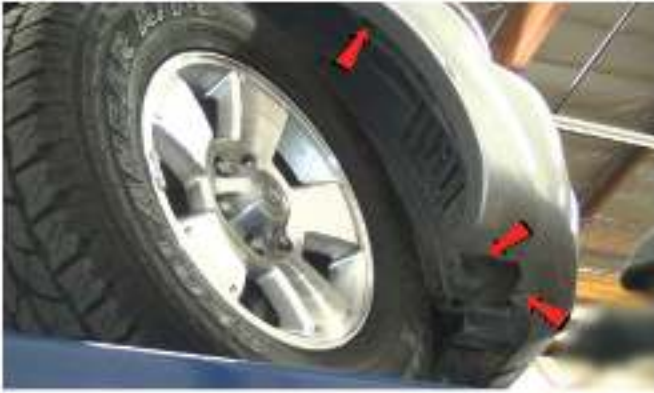
35) Reinstall [3x] phillips screws to secure the fender liner to the fascia.