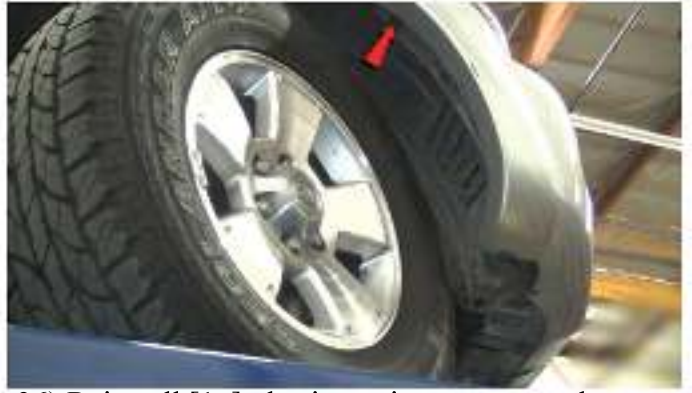
36) Reinstall [1x] plastic retainer to secure the fender liner.