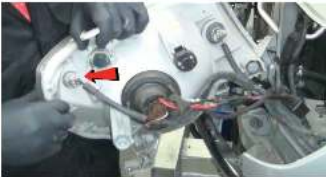
15) Disconnect the sidemarker harness.