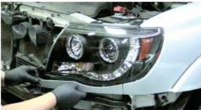
27) Replace the headlight garnish.