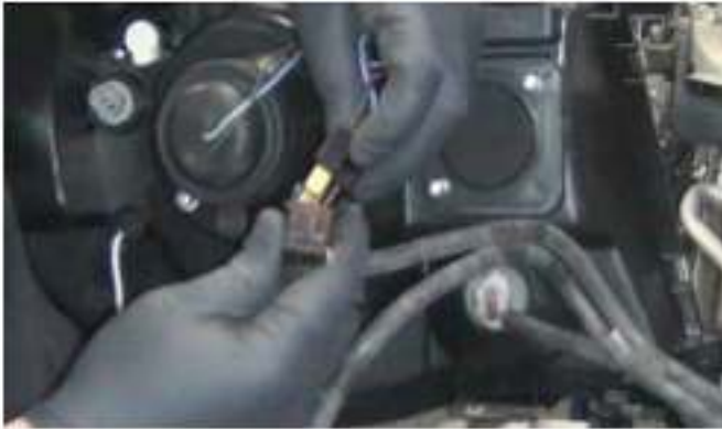
23) Reconnect the headlight harness to the Spyder headlight.