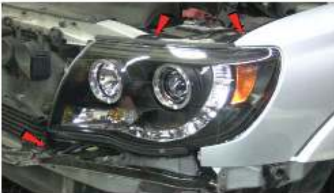
25) Reinstall [3x] phillips screws to secure the headlight.