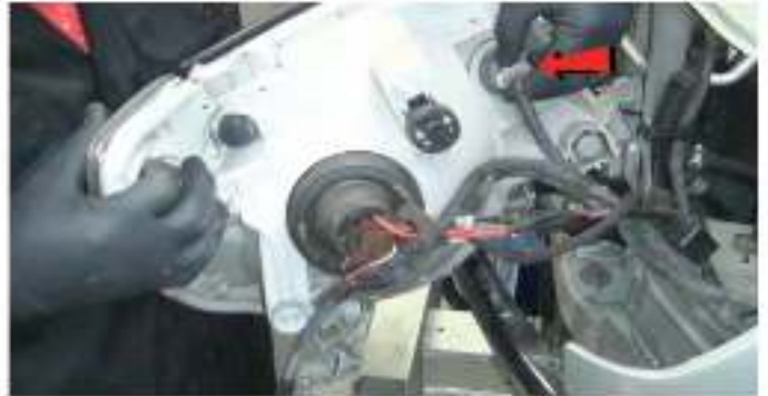
16) Disconnect the turn signal socket.