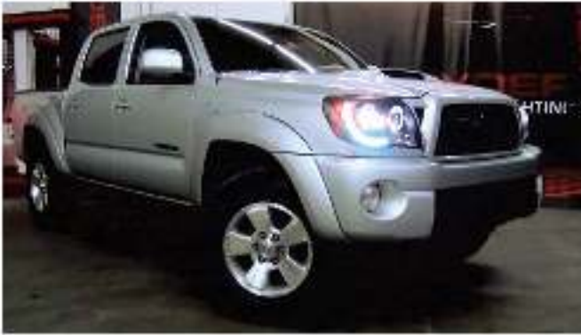
37) Close the hood and enjoy your new Spyder projector headlights.