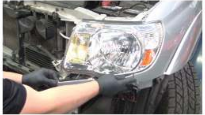
12) Remove the headlight garnish by gently swinging it outwards and away.