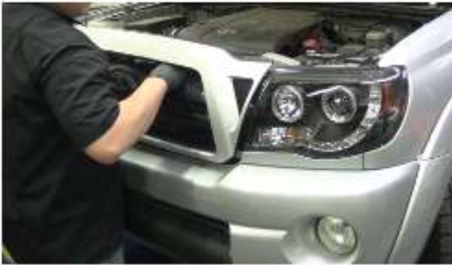
31) Seat the grille.