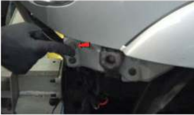
11) Remove [1x] 10mm bolt securing the headlight from the side.