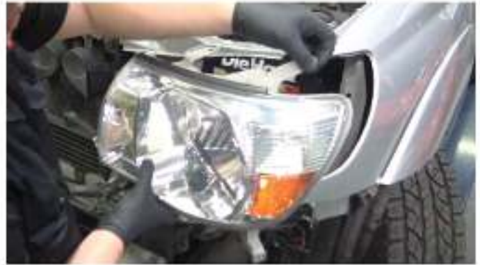
14) Unseat and remove the headlight.