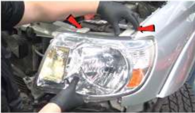
13) Release the headlight retainer tabs.