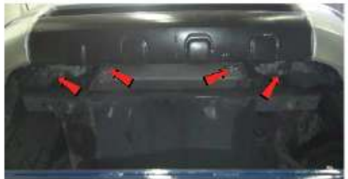
34) Reinstall [4x] plastic retainers to secure the fascia from below.