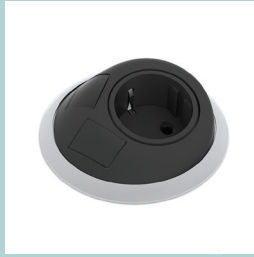
Power socket SHZ005