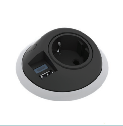
Power socket SHZ004