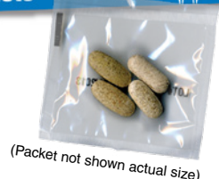
(Packet not shown actual size)