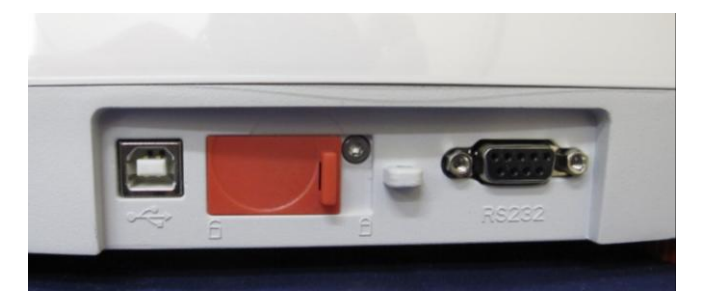
FIGURE 6/4C/292 - 2

(a) Security Switch in the Unlocked Position