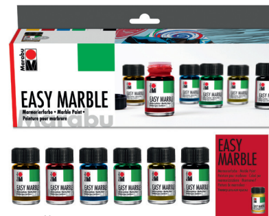
Easy Marble Starter Set