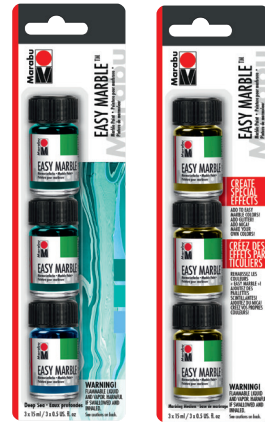
Deep Sea Trial Set Crystal Clear Trial Set