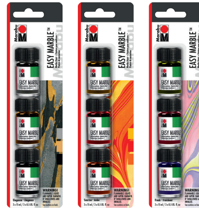
Elegance Trial Set Sunrise Trial Set Fresh Trial Set