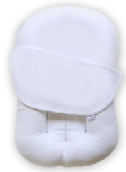
Snuggle Me ORIGINAL™

All Snuggle Me™ loungers are exactly the same in function, it's the materials that make a difference. Choose the one that fits your lifestyle and budget below.