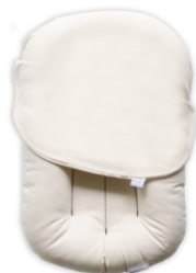
Snuggle Me ORGANIC™