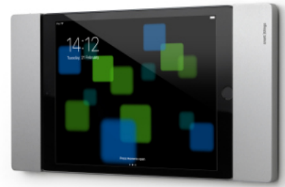
Illustration with iPad mini