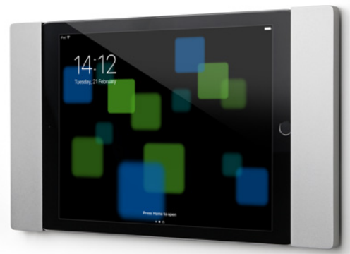
Illustration with iPad Air