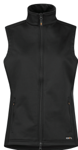
40424CUSTOM Softshell Riding Vest