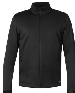
40427CUSTOM Men's Softshell Riding Jacket