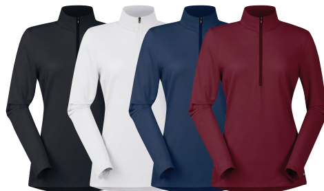
Women's 40423CUSTOM / Kids 60236CUSTOM Ice Fil® Lite Long Sleeve Shirt