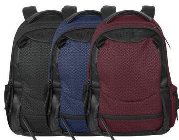
30444CUSTOM EQ Back Pack