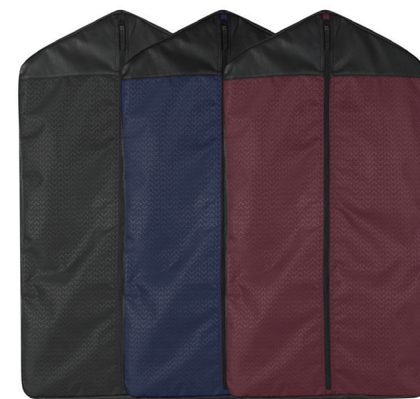
30445CUSTOM EQ Garment Bag