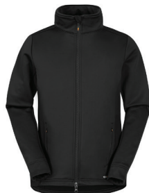
60238CUSTOM Kids Softshell Riding Jacket