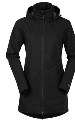
40426CUSTOM Waterproof Jacket Embroidery may damage the integrity of the waterproofing.