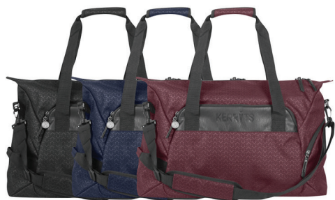
30379CUSTOM EQ Duffle Bag