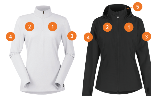
1: Left Chest 2: Right Chest 3: Left Bicep 4: Right Bicep 5: Back of Collar