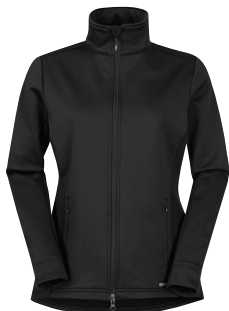
40425CUSTOM Women's Softshell Riding Jacket