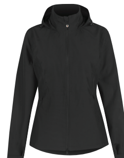
40472CUSTOM Waterproof All Around Rain Jacket Embroidery may damage the integrity of the waterproofing.