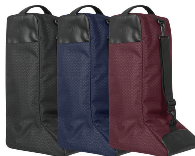
30446CUSTOM EQ Boot Bag