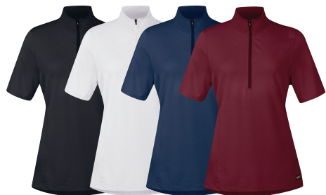
Women's 40422CUSTOM / Kids 60235CUSTOM Ice Fil® Lite Short Sleeve Shirt