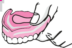
Plate must be thoroughly dry and clean. With fingers, spread Cushion Grip ball from one end of gum groove to the other in a thin even layer. Be sure to cover

entire back edge of upper plate with a thin layer of Cushion Grip as shown. Press layer firmly to plate. Wait 5 minutes. When inserting upper denture, press against front gum. Then, with thumb push up firmly to roof of mouth. Complete the seal by biting down firmly.