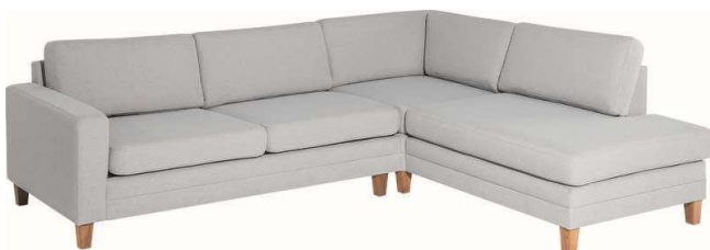
Big corner sofa bed right-sided