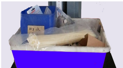
For safe transfer of small items always use a picking bin