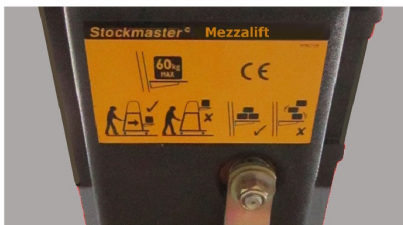
A reliable manually operated winch transfers loads up to 60Kg.