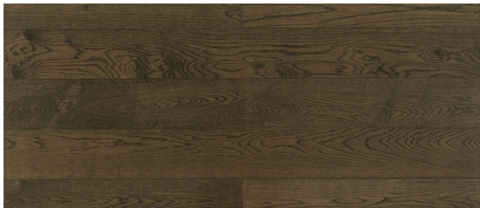
FRENCH GREY 003