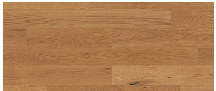
NATURAL OAK 006