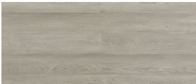
OYSTER GREY 007