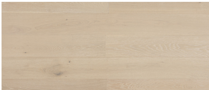
LIMED OAK 005