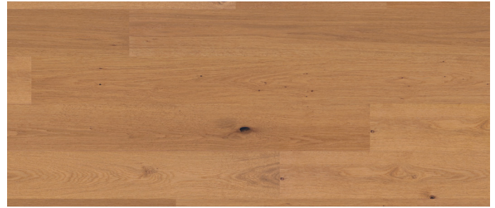
CLASSIC OAK 002