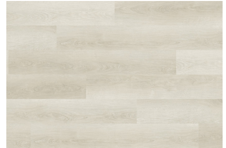
OYSTER GREY 502