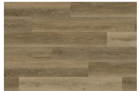
SEASONED BLACKBUTT 506