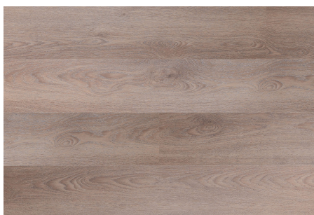
WARM SPOTTED GUM 505