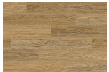
TIDAL GREY 501