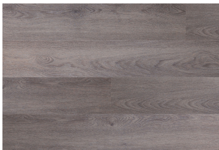
SEPIA OAK 508