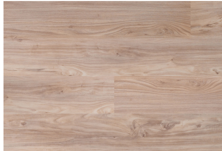
COASTAL OAK 507