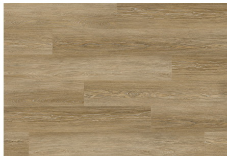
SEASIDE OAK 503