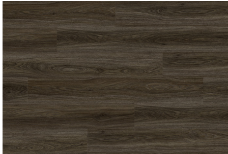
CENTRAL SPOTTED GUM 504