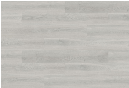
ALPINE WHITE OAK