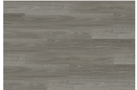
EASTERN GREY GUM