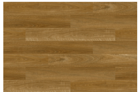
NATIVE SPOTTED GUM