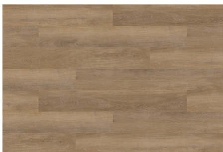
SELECT NATURAL OAK