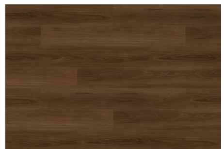
WESTERN RED IRONBARK