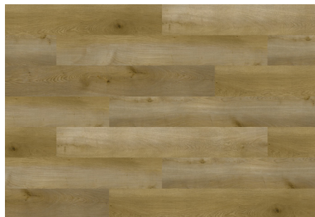
MOUNTAIN TASMANIAN OAK