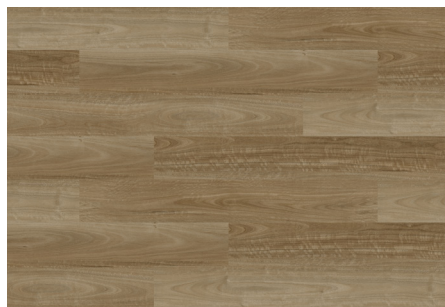
QLD SPOTTED GUM