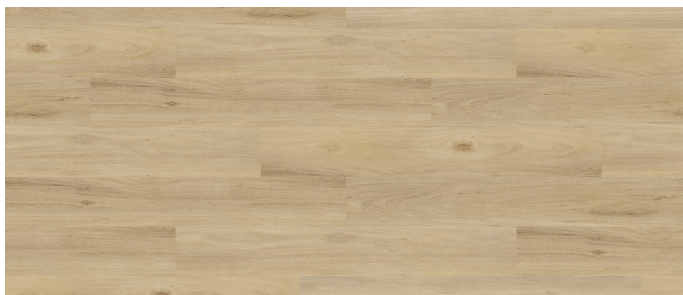
SOUTHERN TASSIE OAK