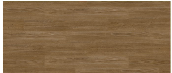
MOCHA SPOTTED GUM