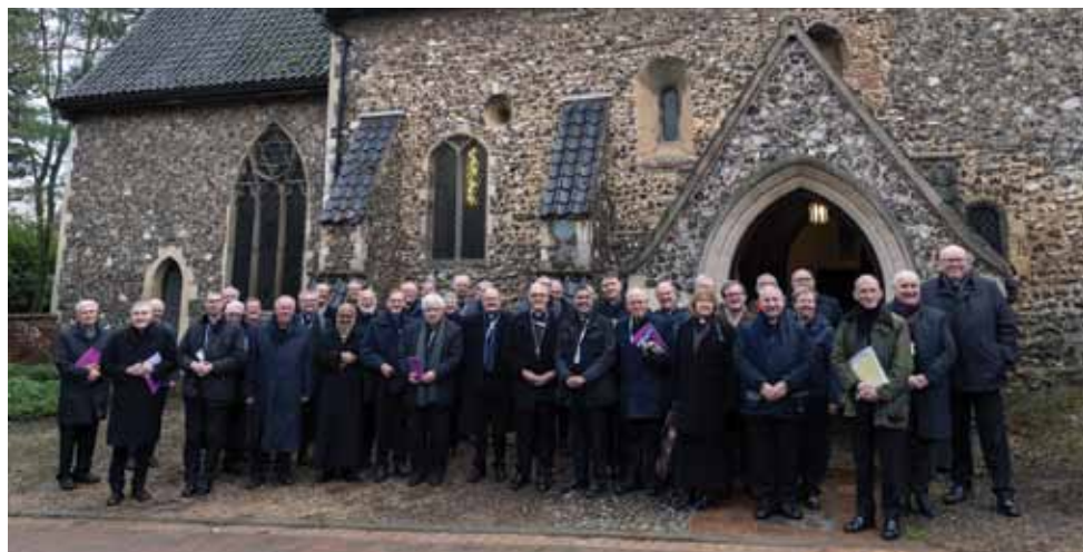
ABOVE: Joint Anglican-Roman Catholic bishops meeting at St Julian's