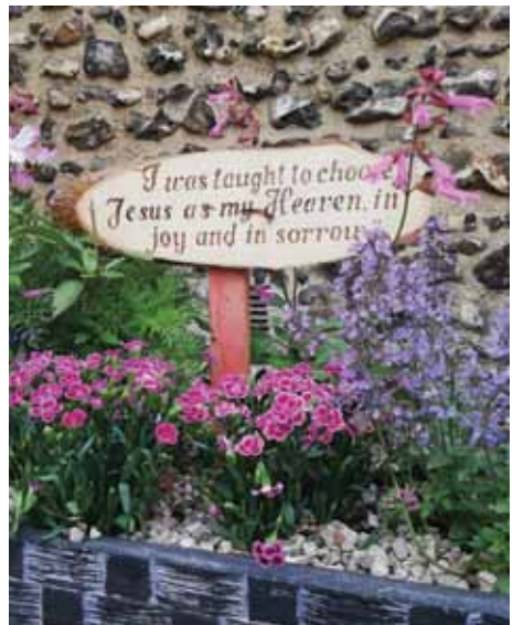
Garden Festival at St Julian's (continued overleaf)