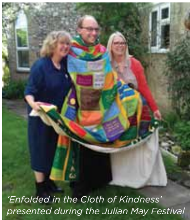
'Enfolded in the Cloth of Kindness' presented during the Julian May Festival

As well as lectures, discussions and retreats there have been events reaching