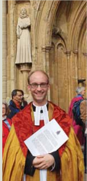
Photo: Holding the letter sent by Pope Francis