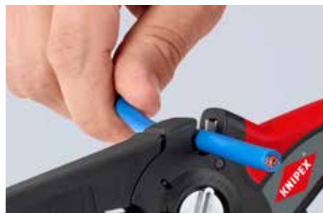
The cable cutter on top cuts up to 6 AWG (16 mm 2 )