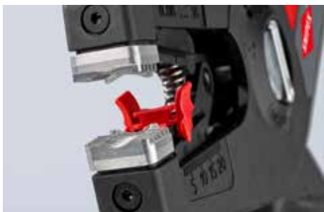
Semi-circular grooved holding clamp provides a better grip and holds the material securely in place

The parabolic blade pair (red) encloses and cuts the insulation.