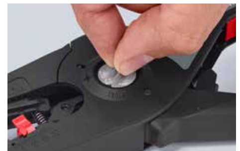
For hard or soft insulation materials, use the fine dial adjustment wheel with locking positions