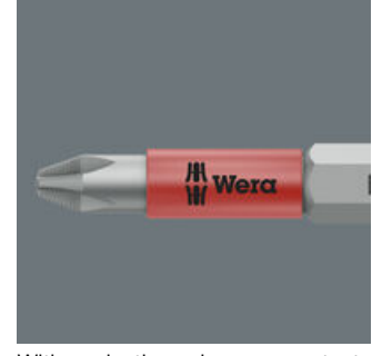
With plastic sleeve, protects components from being damaged when screwdriving