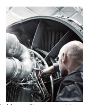
Kraftform Plus screwdrivers ergonomics you can grasp. They relieve the entire hand-arm system even when used intensively. Along with other technical and product advantages such as the Lasertip for a secure fit in the screw head, Kraftform screwdrivers are the ideal choice whenever manual screwdriving jobs are concerned.