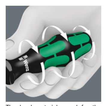
The hard materials used for the handle ensure rapid hand repositioning without any danger of the skin "sticking" to the handle. The surrounding hard zones with large diameters glide like wheels through the hand.