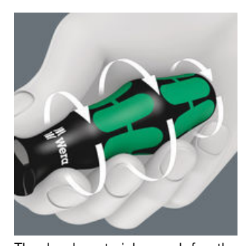
The hard materials used for the handle ensure rapid hand repositioning without any danger of the skin "sticking" to the handle. The surrounding hard zones with large diameters glide like wheels through the hand.