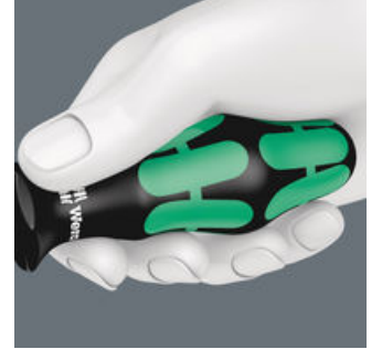
The large contact area - with particularly high friction to the soft zones - results in high torque transfer without any bruising from the edges.