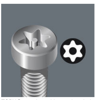
TORX® tools with a borehole prevent the unauthorised unfastening of safety screws. The screws contain a pin that protrudes into the drive profile so that "normal" TORX® tools cannot be used. This pin fits into the borehole of TORX® BO tools allowing safety screws to be unfastened.