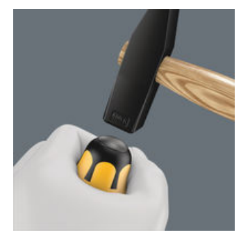
An integrated impact cap lengthens the service life and reduces the danger of splintering. Nevertheless, always wear protective goggles.