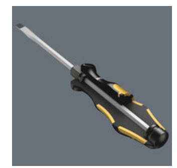
A hexagon blade made out of highquality bit material extends right through the handle - thereby ensuring full transfer of force, even when struck with a hammer. The ductile tempered material prevents the blade from splintering or breaking.