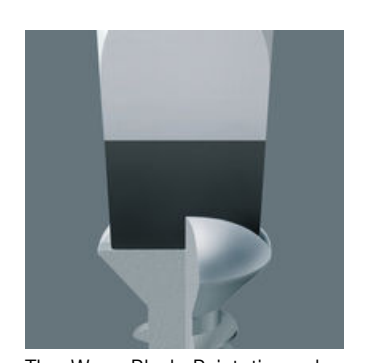
The Wera Black Point tip and a refined hardening process ensure long service life of the tip, improved corrosion protection and an exact fit.