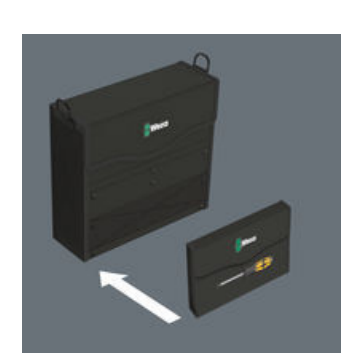
Suitable for docking with the Wera 2go system.