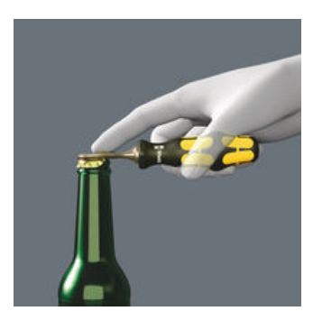
Plus iconic Wera bottle opener.