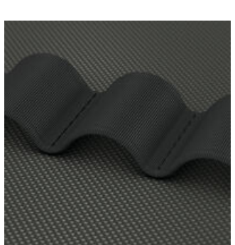
The robust loops made of broad rubber band hold the tool safe and tight.

Flexible thanks to hook and loop fastener strips