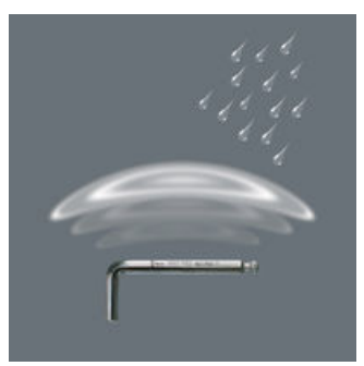
Chrome-plated hexagon L-keys for outstanding surface protection and long service life. High corrosion protection.