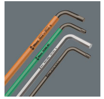
The size of each L-keys has been engraved by a laser. In addition Take it easy L-keys have a colour coding according to sizes - for simple and rapid accessing of the required tool. Making it easy to find the right tool.