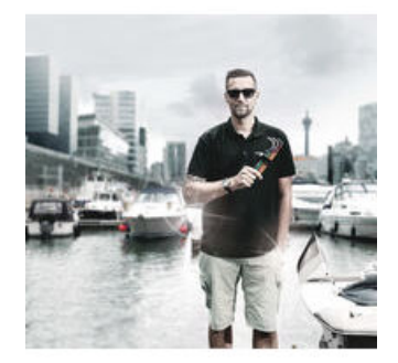
We questioned the classic L-key design, since all too often the screw head recess is rounded out, meaning screws can no longer be tightened or loosened - and so the user finds the L-key slipping out of the recess. Wera Hex-Plus tools have a larger contact surface in the screw head. The notching effects are reduced and thereby the deformation of the screws. At the same time, as much as 20 %more torque can be applied.