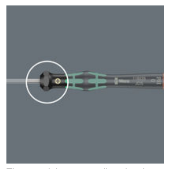
The precision zone directly above the blade gives the user a better feel for the right rotation angle during fine adjustment work.