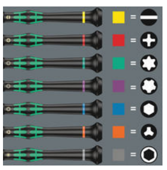
Screwdrivers with "Take it easy" tool finder: colour coding according to profile and size stamp.